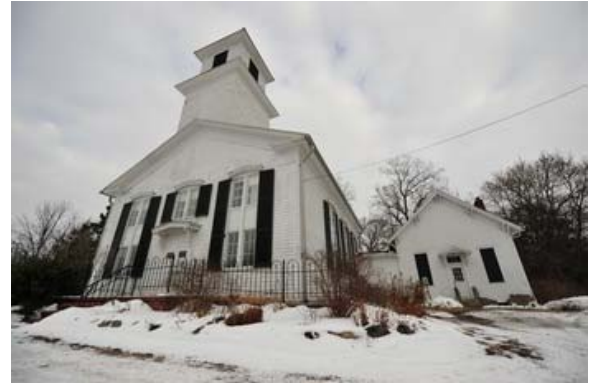
The congregation of the Webster United Church of Christ recently decided to relinquish the development rights to 94.4 acres of property to the city of Ann Arbor's Greenbelt Program.