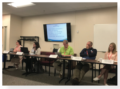
Utility stakeholder group meeting.

On Aug. 1, the Michigan Department of Environment, Great Lakes and Energy (EGLE) hosted a utility stakeholder group to support their regulatory development process for PFAS. I was able to participate in this work group representing the City of Ann Arbor, and was able to share our concerns on how this group of chemicals may be regulated by the state in the future, while the science and health effects are still being developed and studied. EGLE was very receptive to receiving feedback and will be sharing a draft regulatory framework for comment over the coming months.