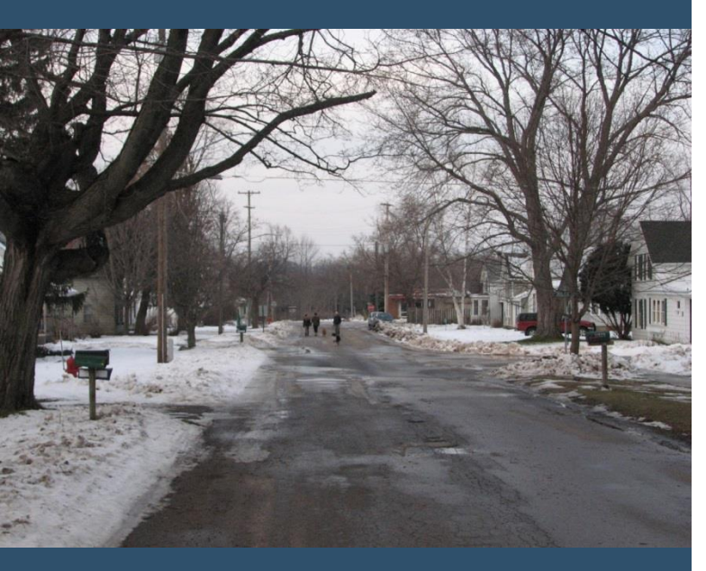
Long Term Policy 6:15 – 6:40