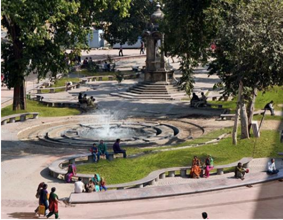
Bhadra Court, India