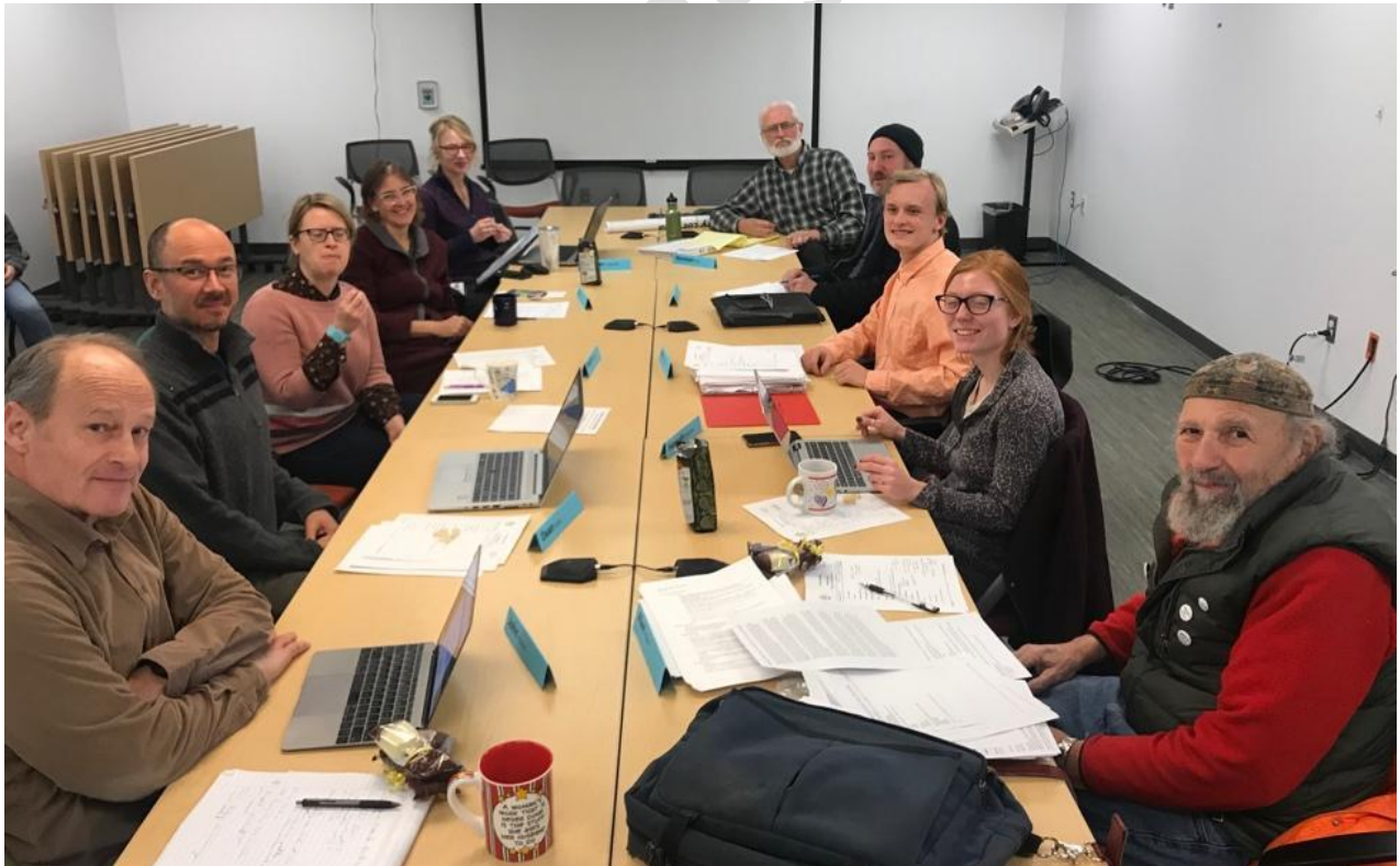
Members of the Task Force