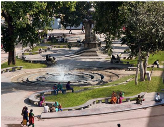
Bhadra Court, India

Shown here are the two of the highest rated photos: