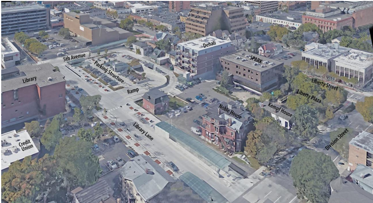
Birdseye photo of Library Block from southeast