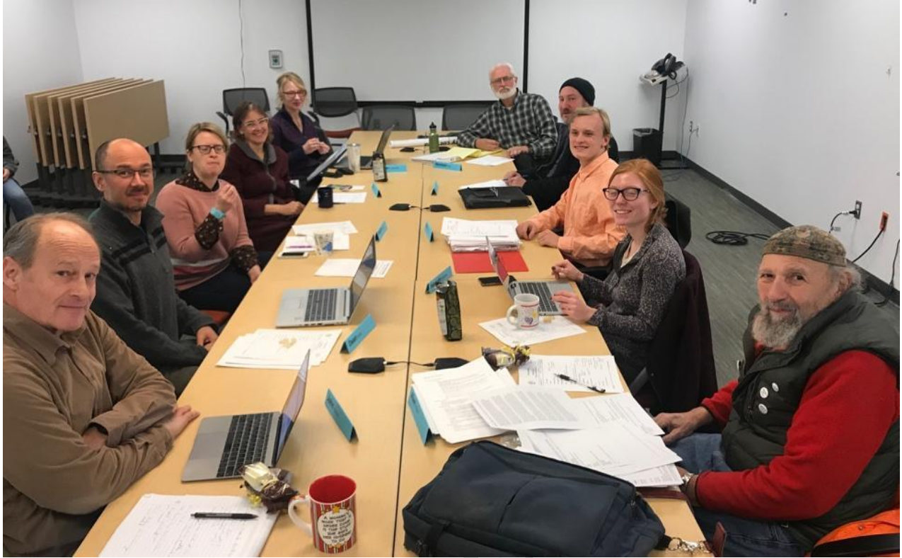
Members of the Task Force