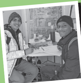
Participants visit the Idea Pod in November 2019

AS OF THE WRITING OF THIS INVITATION the Task Force has held community engagement meetings with the AAATA, the DDA, the downtown library, the Old Fourth Ward Neighborhood Association, Kempf House, the Delonis Center, a Y Lot consultant and businesses and residents near the Library Block. The Task Force also gathered survey responses in an “Idea Pod” decadome on the Library block, through an online survey, and at a community-wide open house.