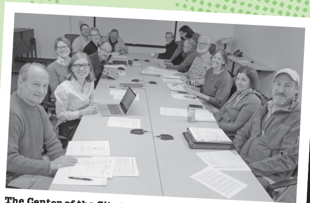
The Center of the City Task Force: We are nine appointed resident volunteers, plus two liaison members from City Council and one staff person.

BY FEBRUARY 28, 2020 , the CENTER OF THE CITY TASK FORCE will present recommendations to the Ann Arbor City Council for implementing the City Charter direction to develop these these public lands as a Central Park and Civic Center Commons. WE NEED YOUR INPUT!