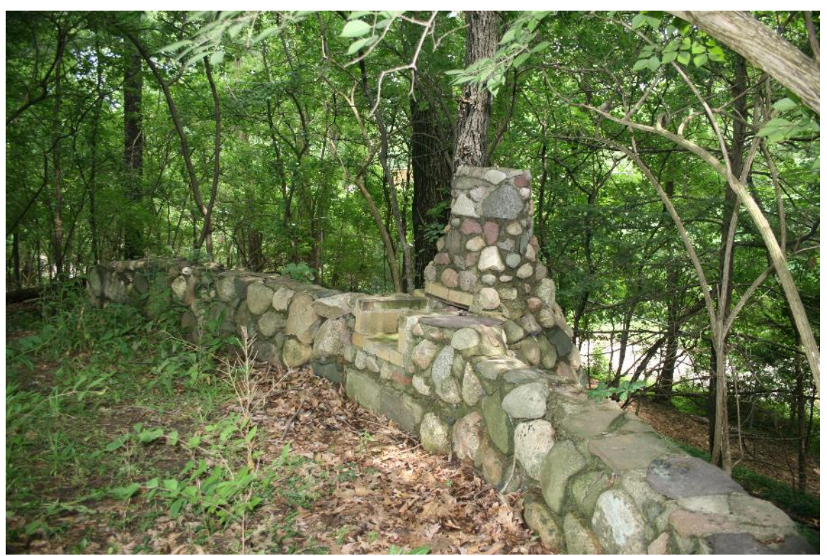
15 - Fireplace built into east wall of wild garden, July 2017