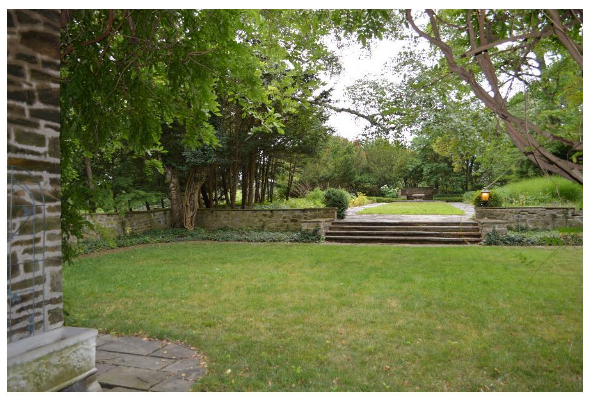
11 - Looking south at south lawn panel and formal garden, July 2017