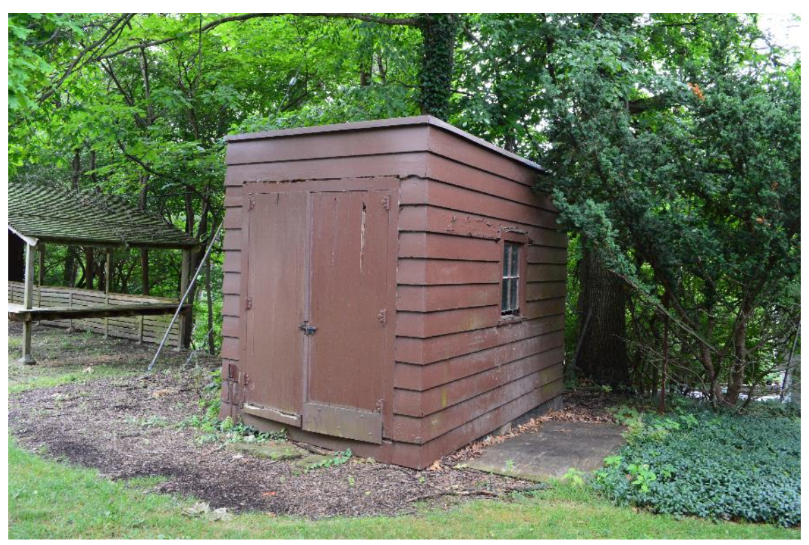
9 - Looking southeast at peacock house/drying shed, July 2017