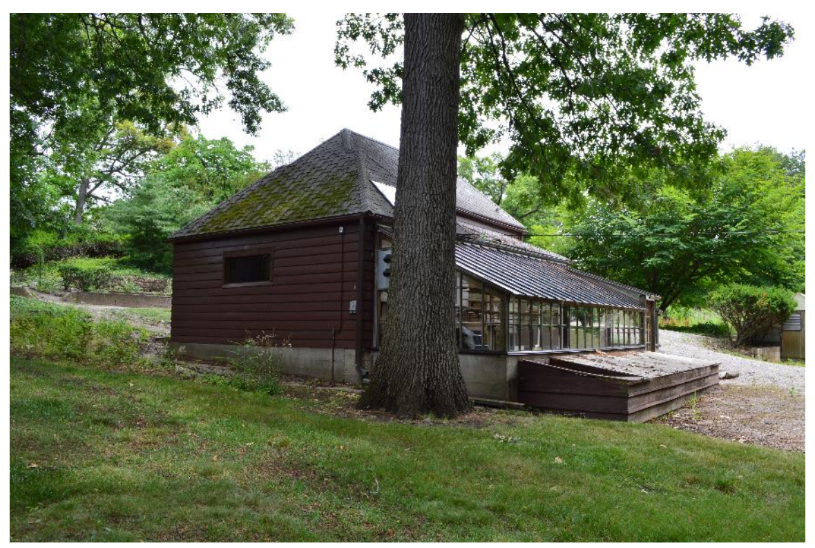
7 - Looking northeast at shop and greenhouse, July 2017