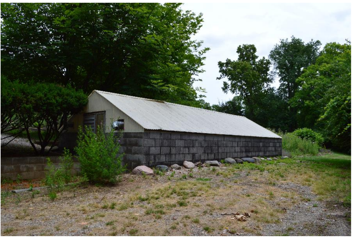
10 - Looking northeast at coldhouse, July 2017