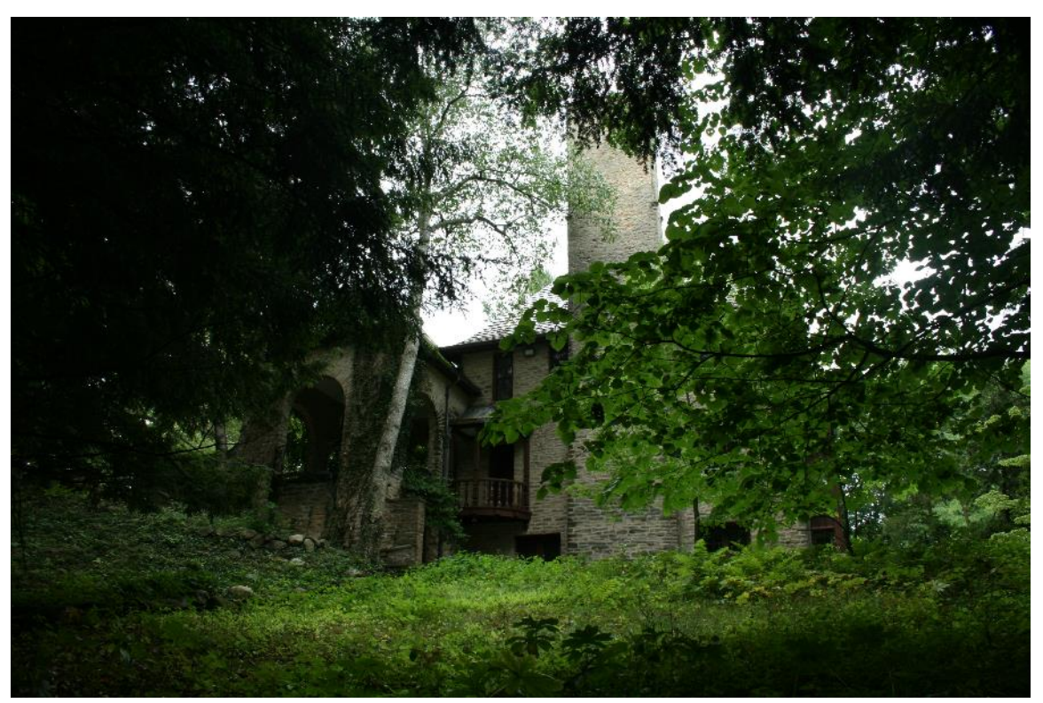
3 - Looking west at wild garden and east end of house, July 2017