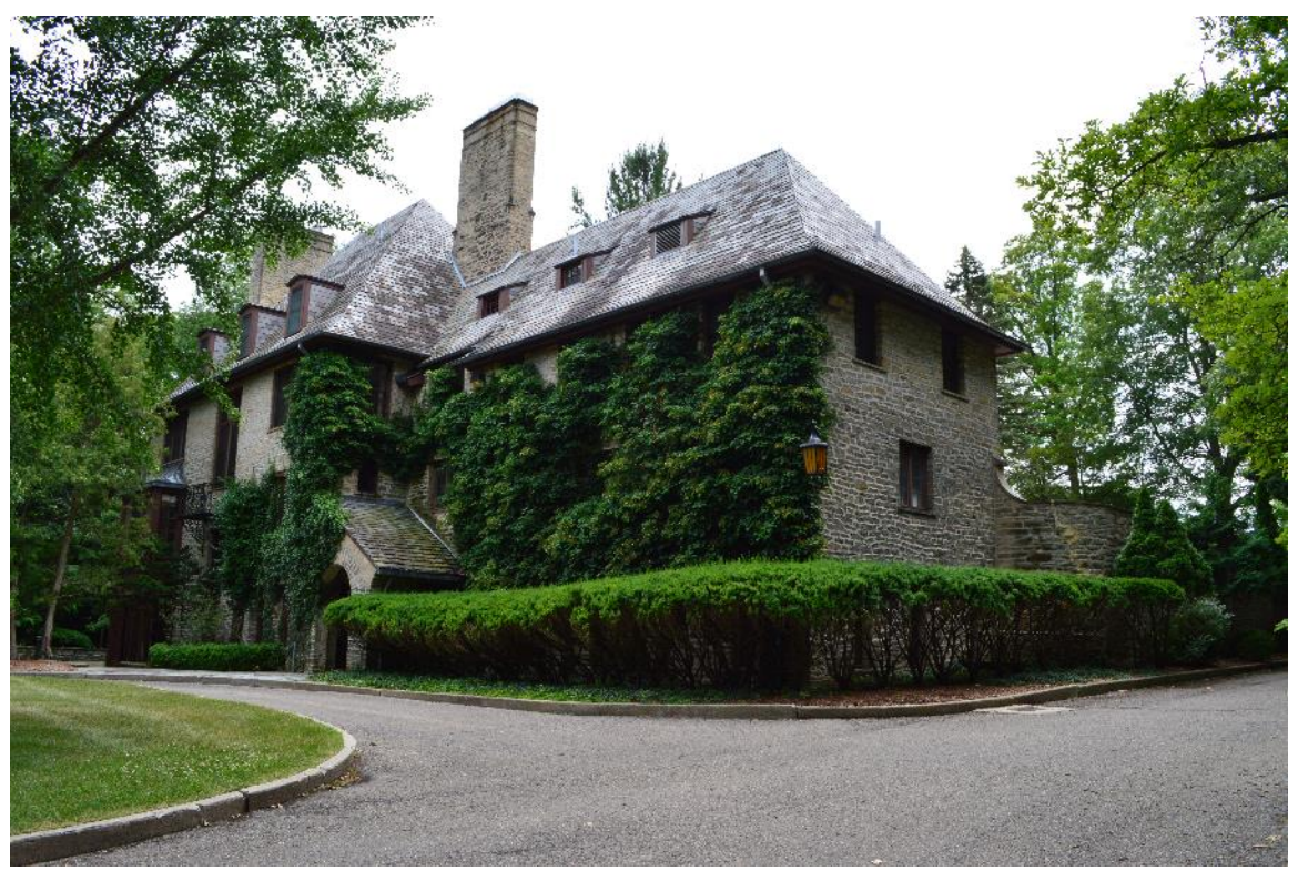
1 - Looking southeast at front of Inglis House and oval arrival court, July 2017