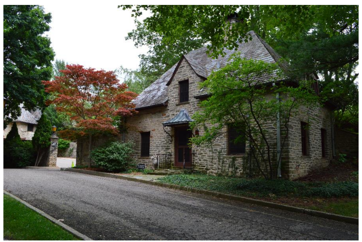
5 - Looking northeast at gardener's cottage with house to left, July 2017