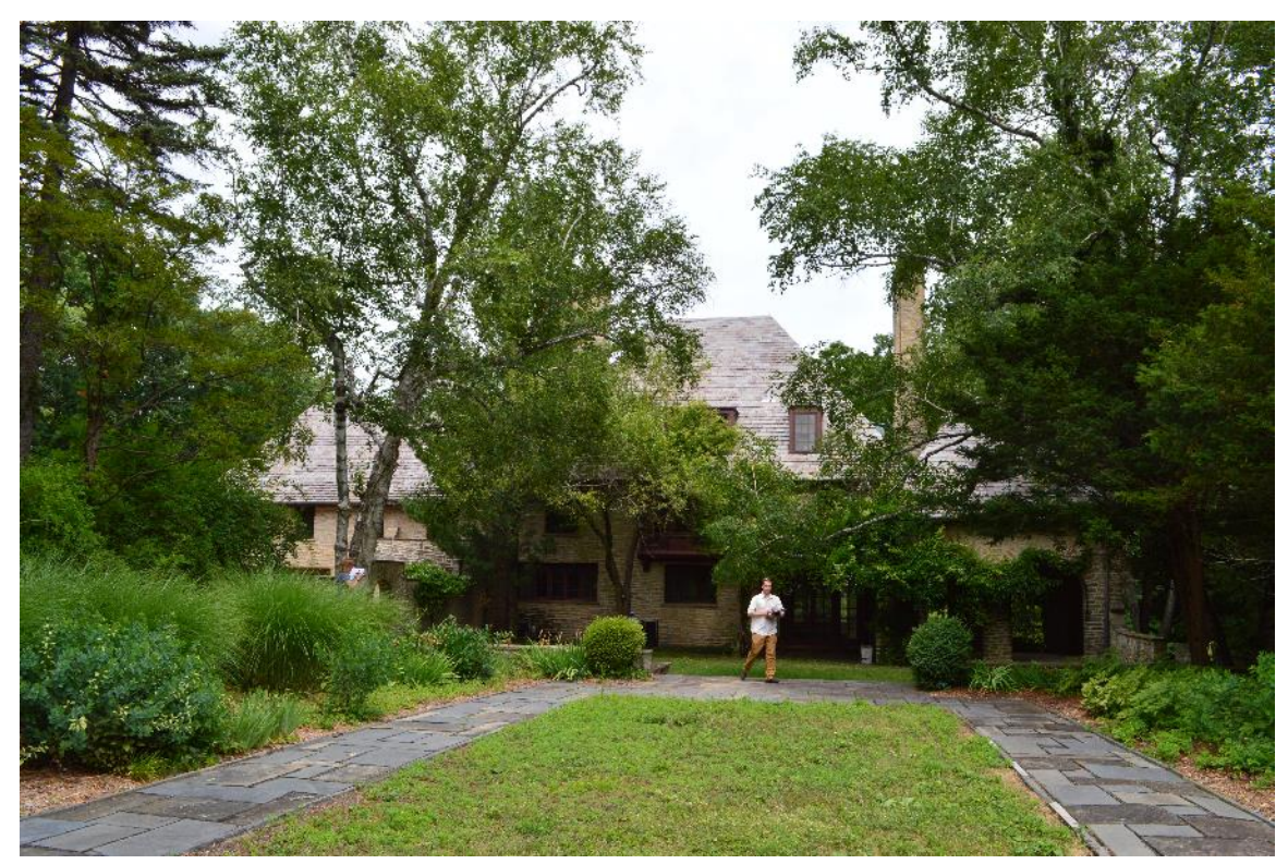
4 - Looking north in formal garden to rear of Inglis House, July 2017