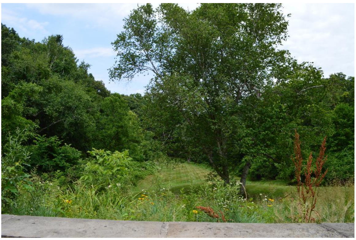
14 - Looking north from oval arrival court out to north lawn, July 2017