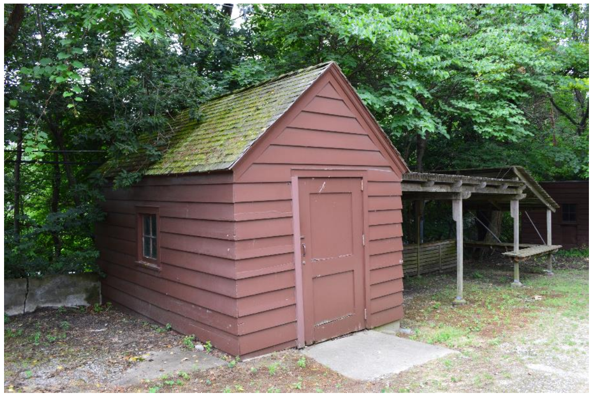
8 - Looking southwest at garden shed and lath house, July 2017