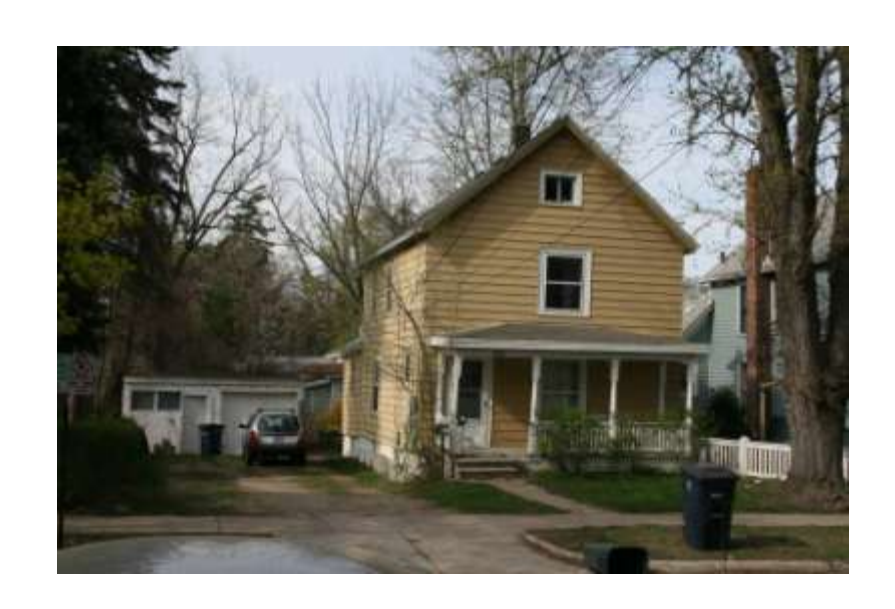
PHOTO INFO File name Wash_W_506.JPG Date April-May, 2008