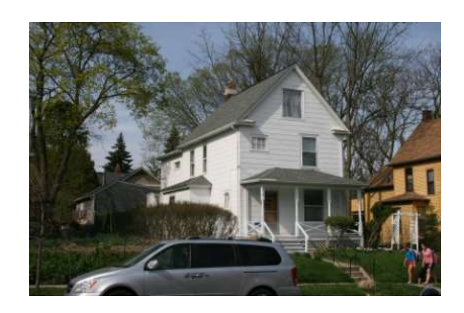
PHOTO INFO File name Wash_W_812.JPG Date April-May, 2008