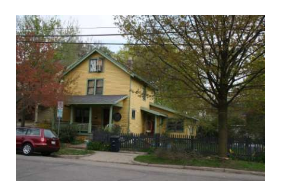
PHOTO INFO File name William_504.JPG Date April-May, 2008