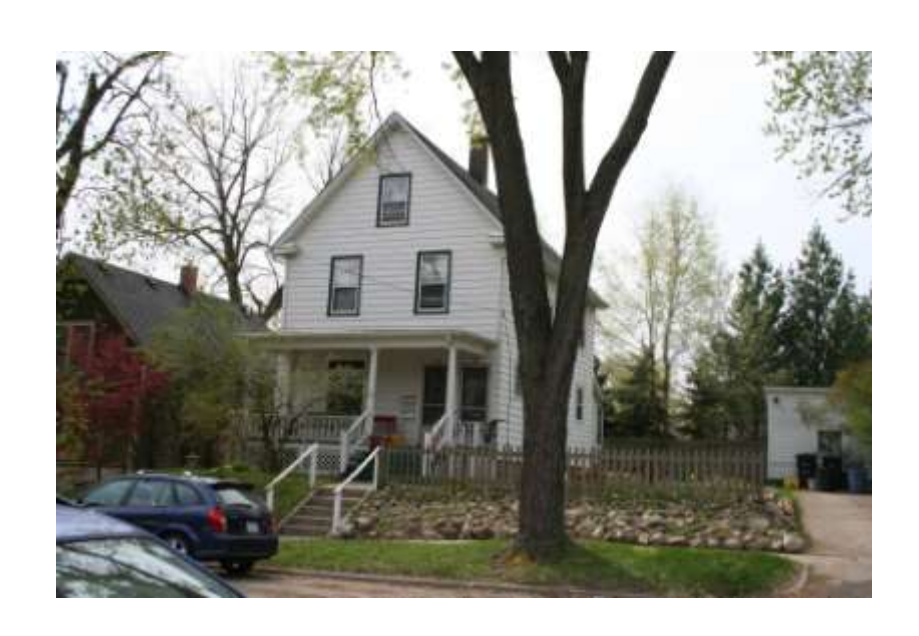
PHOTO INFO File name William_311.JPG Date April-May, 2008