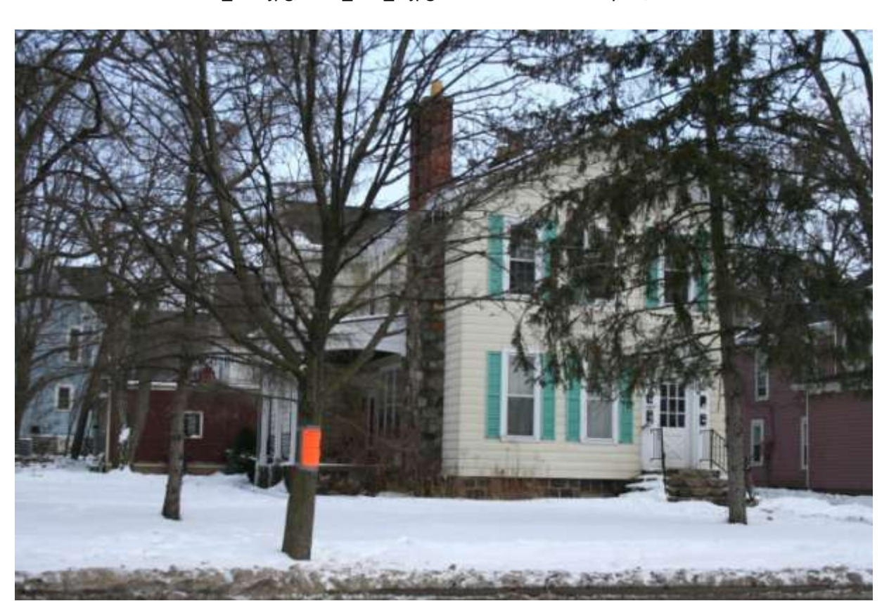
PHOTO FILE NAME: Fifth_433.jpg, Fifth_433_2.jpg DATE: February 16, 2010

REFERENCES: www.flickr.com/photos/leylabunny/2322194889/in/set-721576 (Defend the Ann Arbor 7)