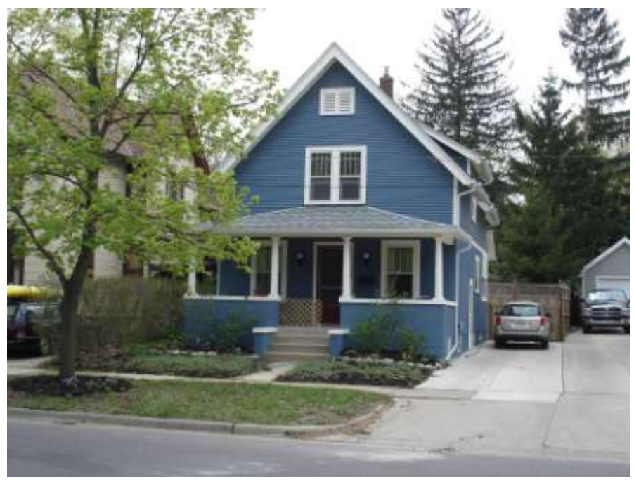
PHOTO INFO File name First_450.JPG Date April-May, 2008