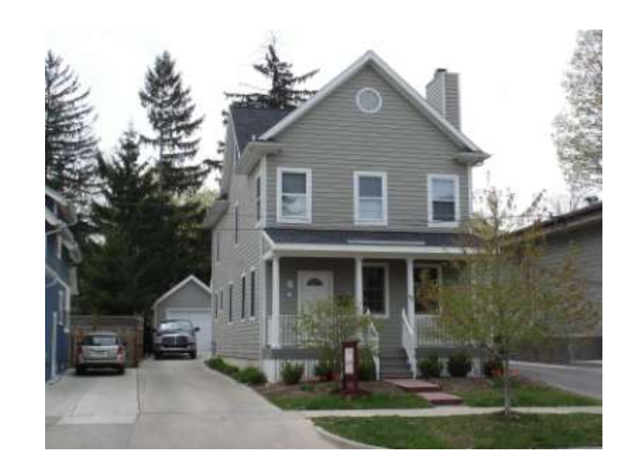
PHOTO INFO File name First_448.JPG Date April-May, 2008