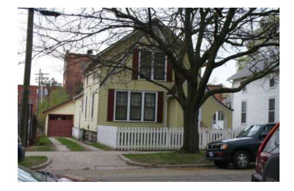
PHOTO INFO File name Fifth_413_2.JPG Date April-May, 2008