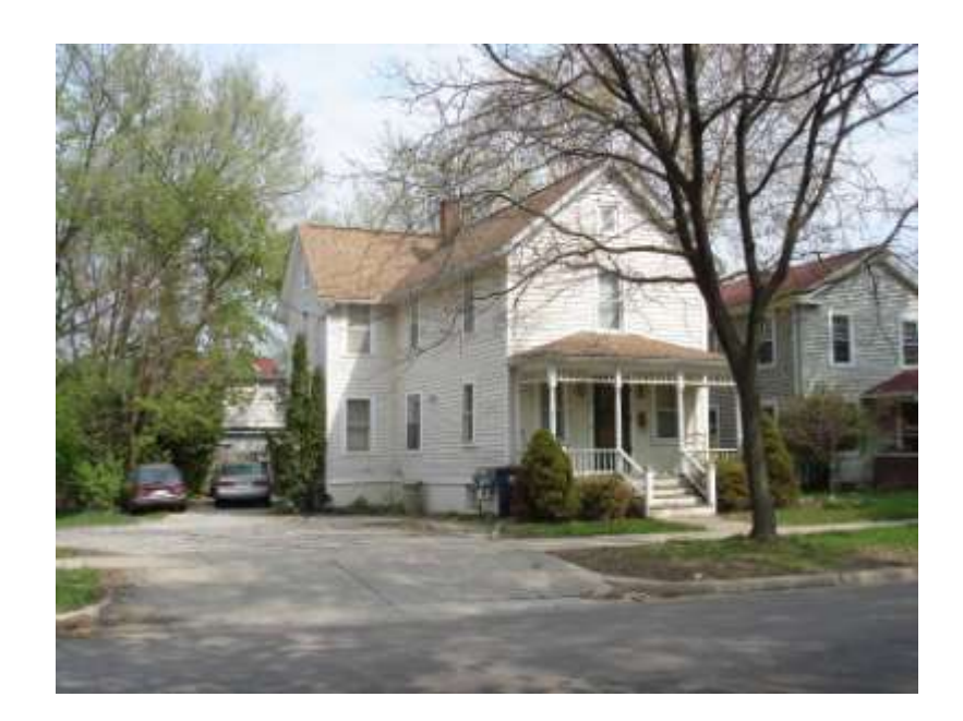
PHOTO INFO File name First_515.JPG Date April-May, 2008