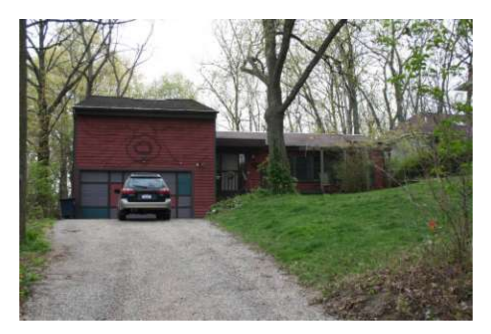
PHOTO INFO File name Fifth_701_1.JPG Date April-May, 2008