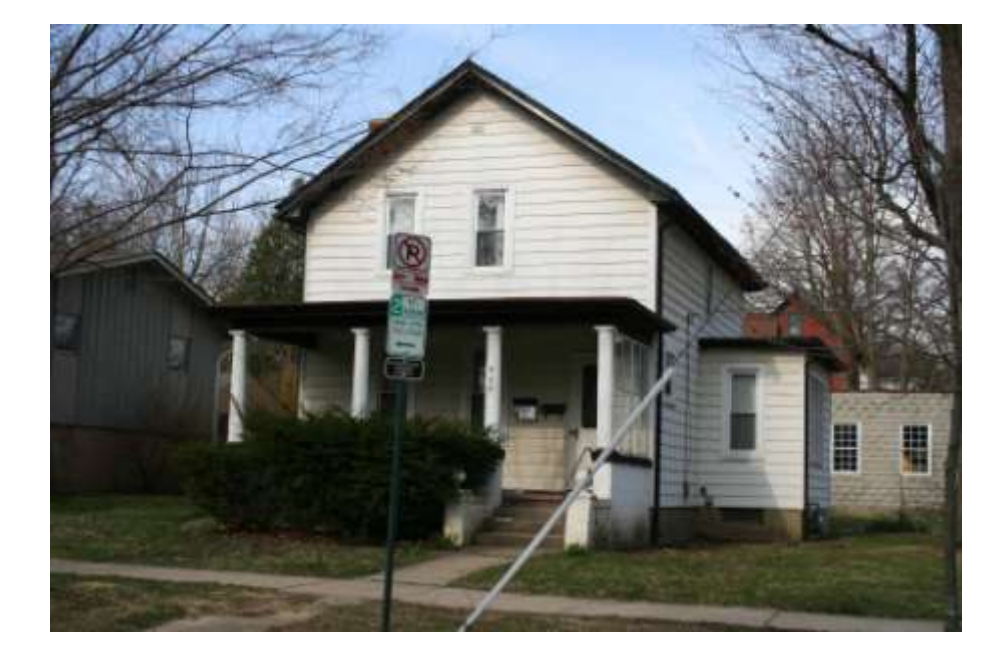
PHOTO INFO File name First_602.JPG Date April-May, 2008