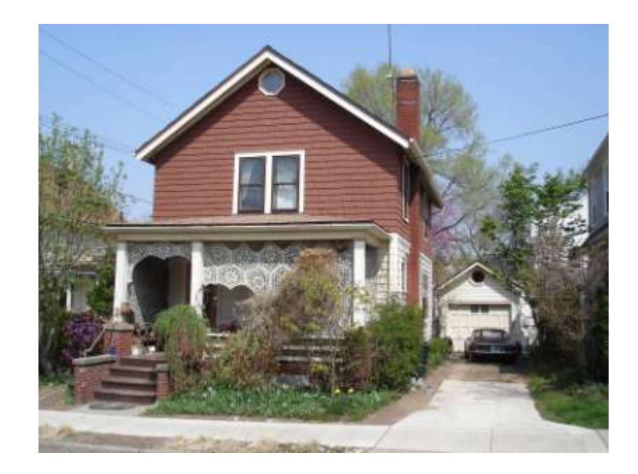
PHOTO INFO File name First_711.JPG Date April-May, 2008