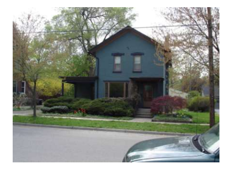
PHOTO INFO File name First_548_2.JPG Date April-May, 2008