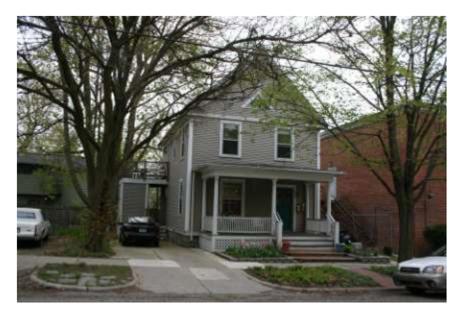
PHOTO INFO File name Fifth_317_2.JPG Date April-May, 2008