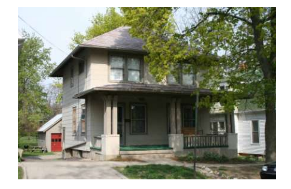
PHOTO INFO File name Fifth_420_2.JPG Date April-May, 2008