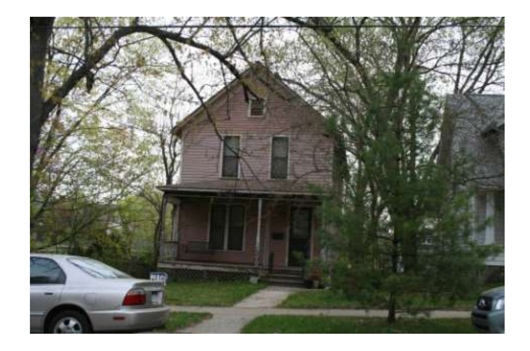
PHOTO INFO File name Fifth_613_1.JPG Date April-May, 2008