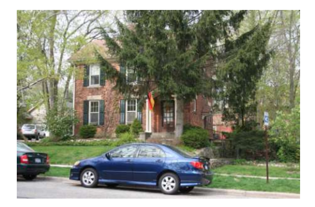
PHOTO INFO File name Fifth_618_1.JPG Date April-May, 2008