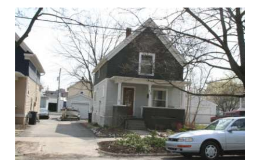
PHOTO INFO File name First_617.JPG Date April-May, 2008