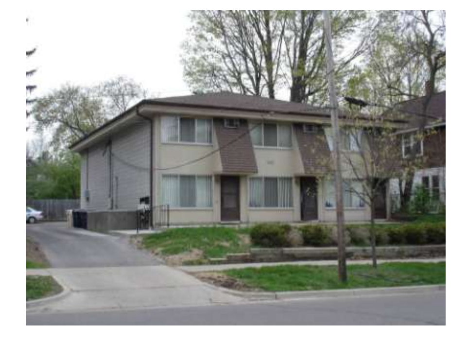
PHOTO INFO File name First_442.JPG Date April-May, 2008