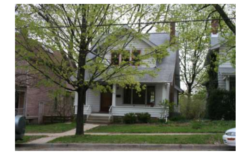
PHOTO INFO File name Fifth_617_1.JPG Date April-May, 2008