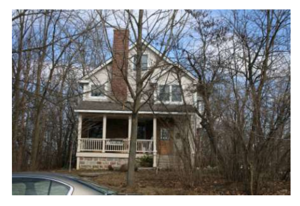
PHOTO INFO File name Fifth_719_2.JPG  Date April-May, 2008