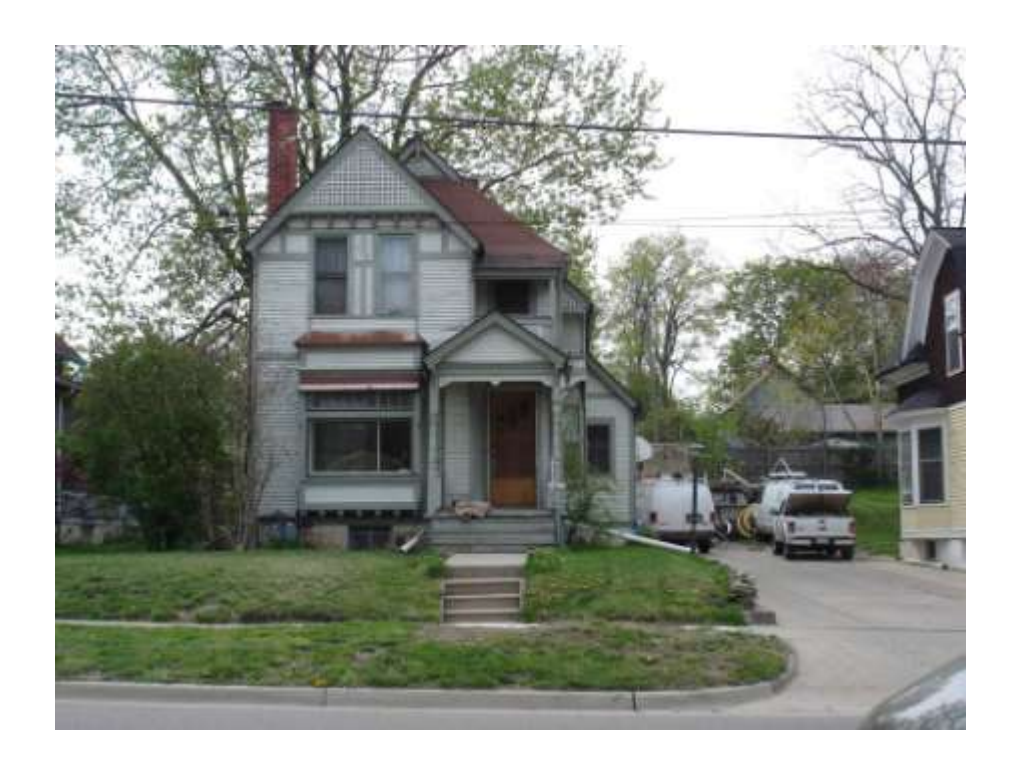
PHOTO INFO File name First_412.JPG Date April-May, 2008