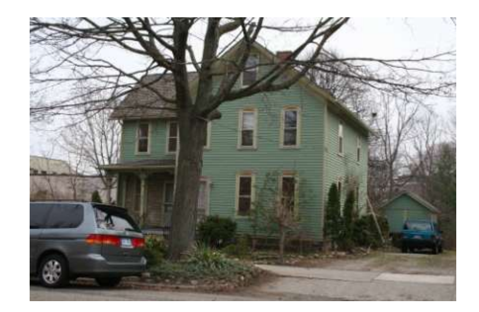
PHOTO INFO File name Fourth_427_3.JPG Date April-May, 2008