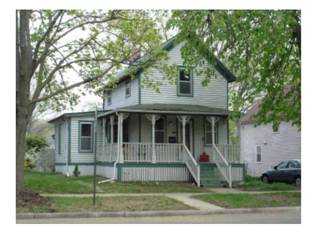
PHOTO INFO File name First_507.JPG Date April-May, 2008