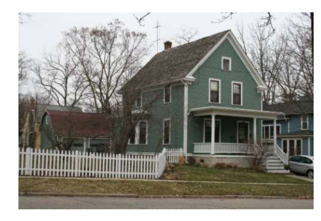
PHOTO INFO File name Fourth_546_2.JPG Date April-May, 2008