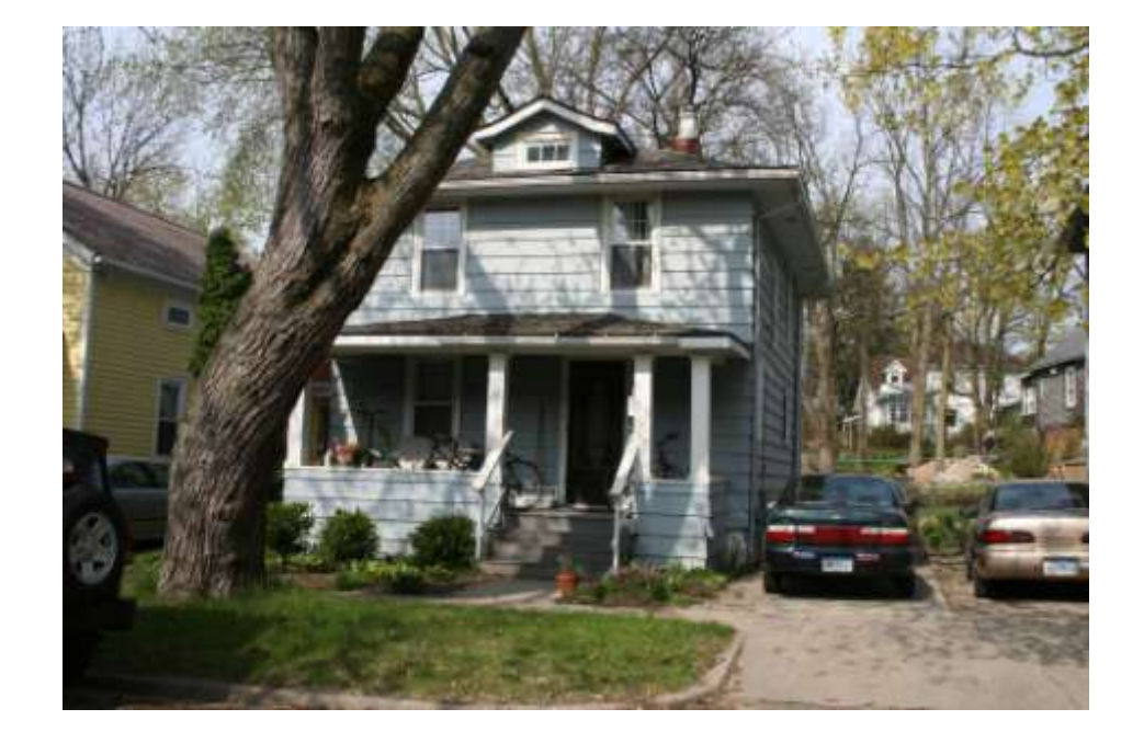
PHOTO INFO File name Fifth_328_1.JPG Date April-May, 2008