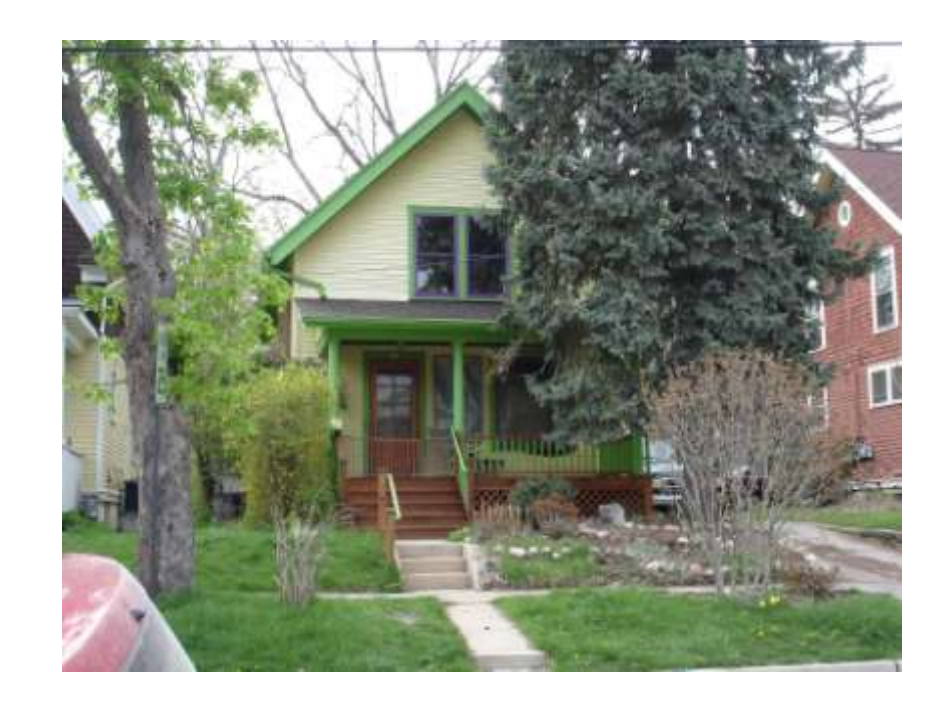
PHOTO INFO File name First_408.JPG Date April-May, 2008