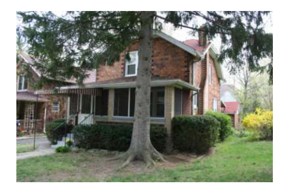
PHOTO INFO File name Fifth_637_1.JPG Date April-May, 2008