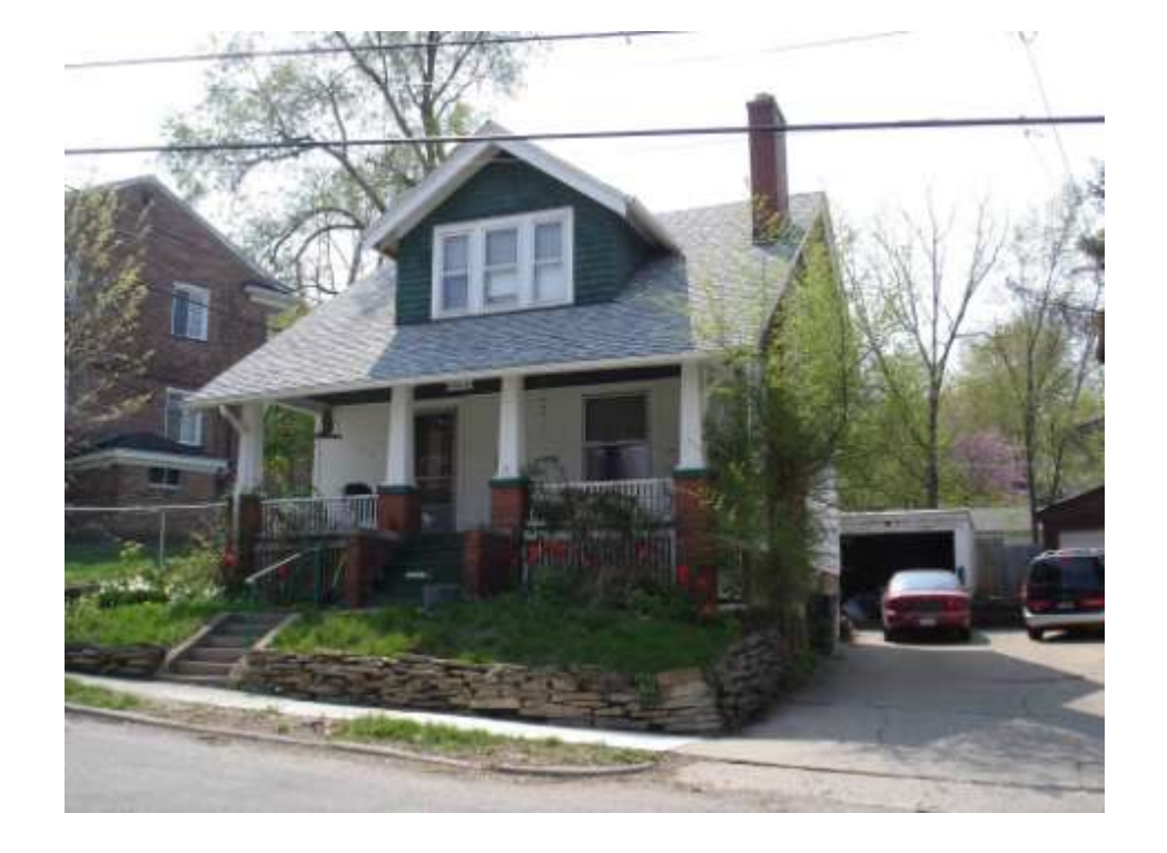
PHOTO INFO File name First_806JPG Date April-May, 2008