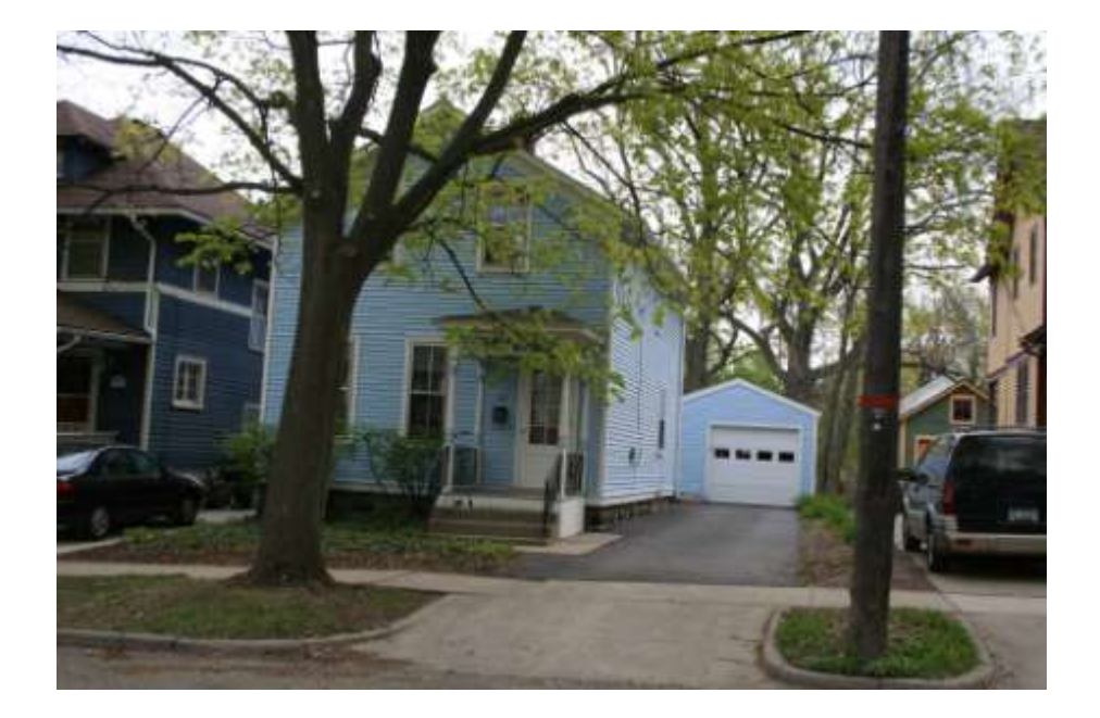
PHOTO INFO File name Fifth_521_1.JPG Date April-May, 2008