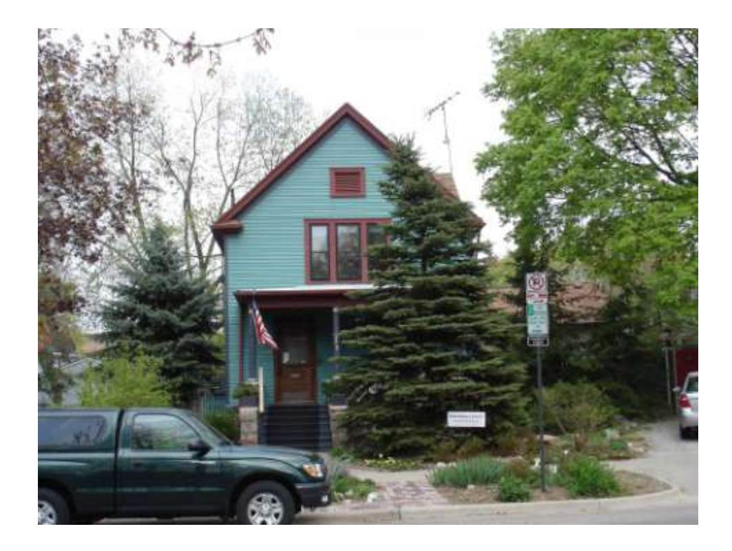
PHOTO INFO File name First_549_2.JPG Date April-May, 2008