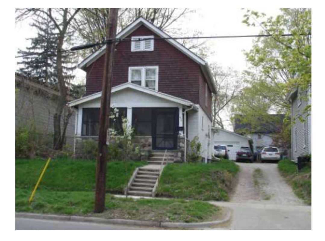
PHOTO INFO File name First_436.JPG Date April-May, 2008