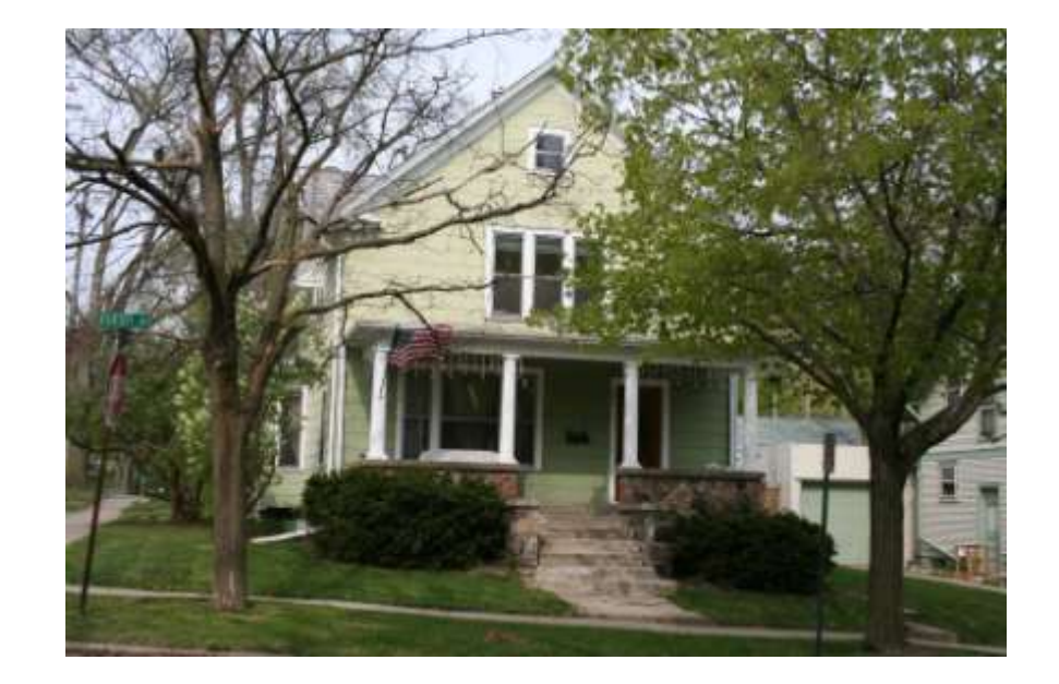
PHOTO INFO File name Fifth_552_2.JPG Date April-May, 2008