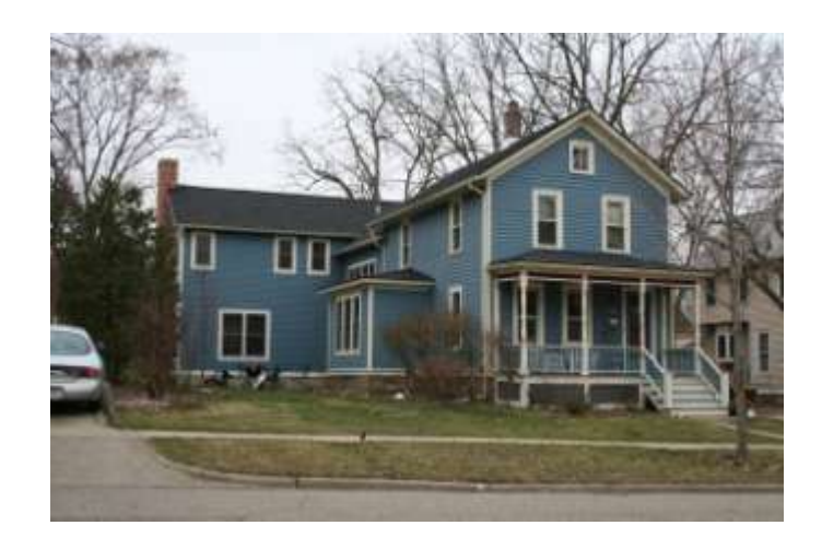
PHOTO INFO File name Fourth_542_2.JPG Date April-May, 2008

COMMENTS OWS Tour 1991 says house built about 1878