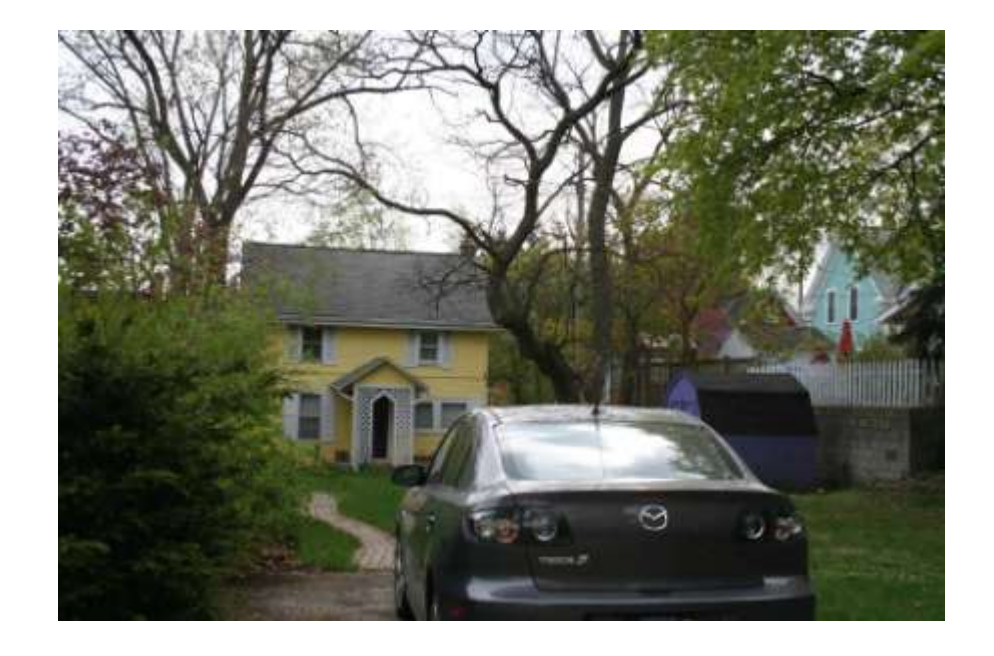
PHOTO INFO File name Fifth_549_1.jpg Date April-May, 2008