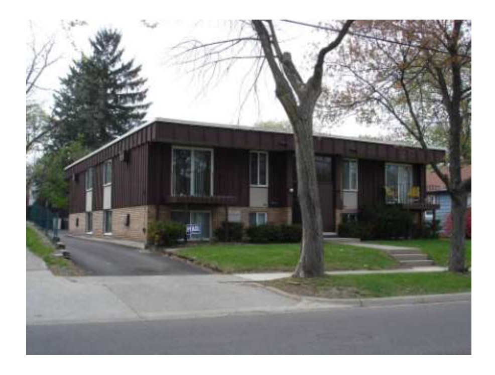
PHOTO INFO File name First_426.JPG Date April-May, 2008