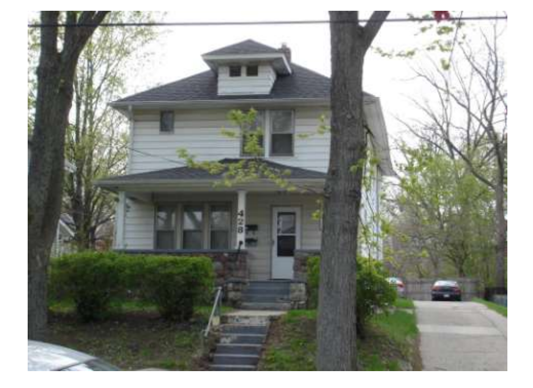
PHOTO INFO File name First_428.JPG Date April-May, 2008