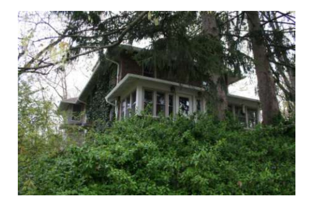
PHOTO INFO File name Fifth_707_2.JPG Date April-May, 2008