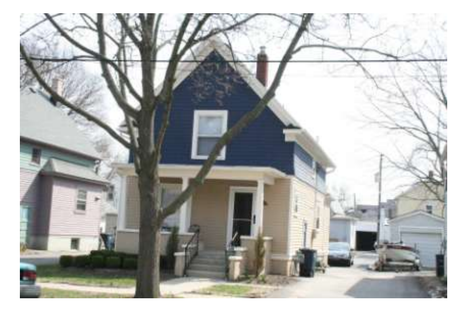
PHOTO INFO File name First_613_2.JPG Date April-May, 2008