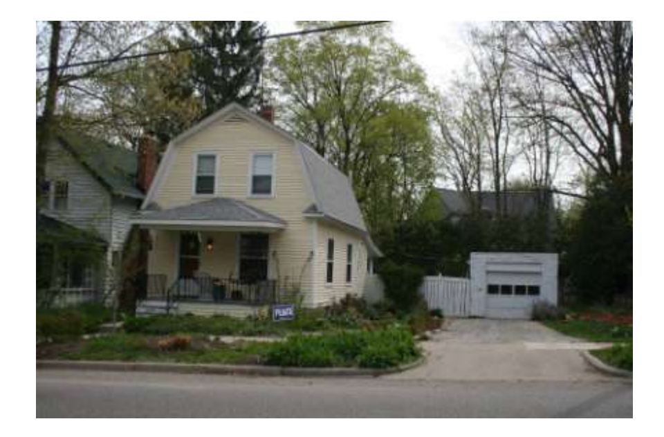
PHOTO INFO File name Fifth_629_1.JPG Date April-May, 2008