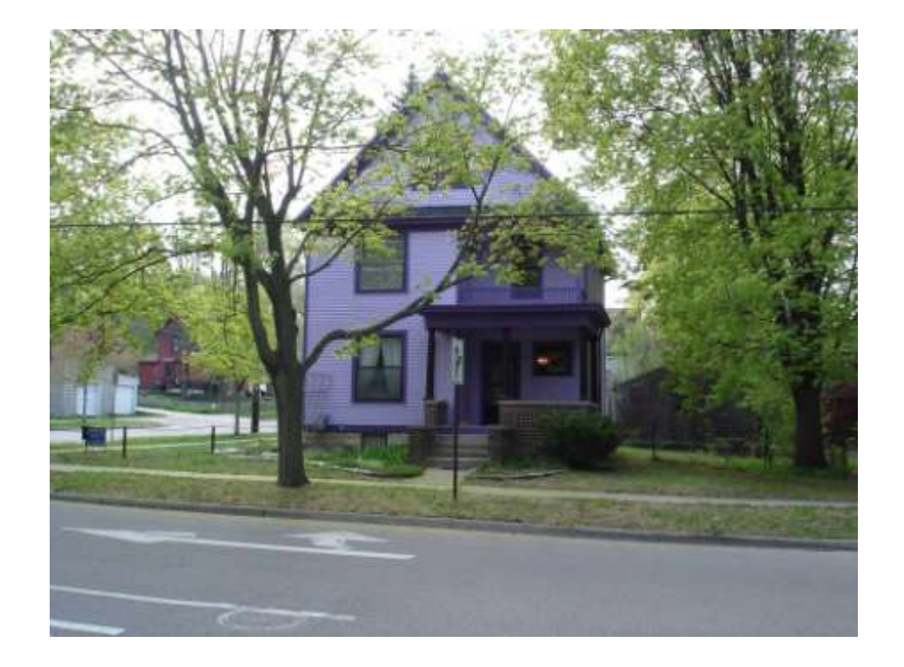
PHOTO INFO File name First_560_2.JPG Date April-May, 2008