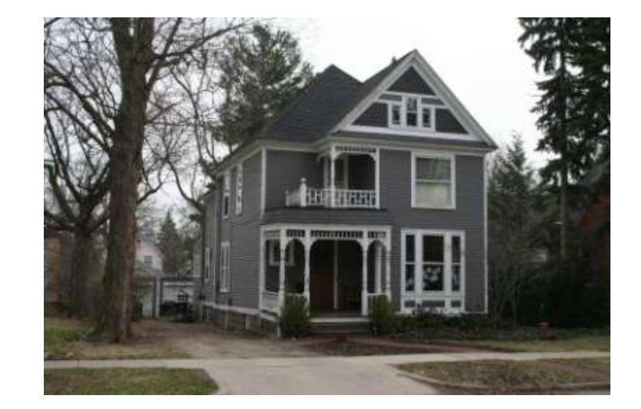
PHOTO INFO File name Fourth_449.JPG Date April-May, 2008