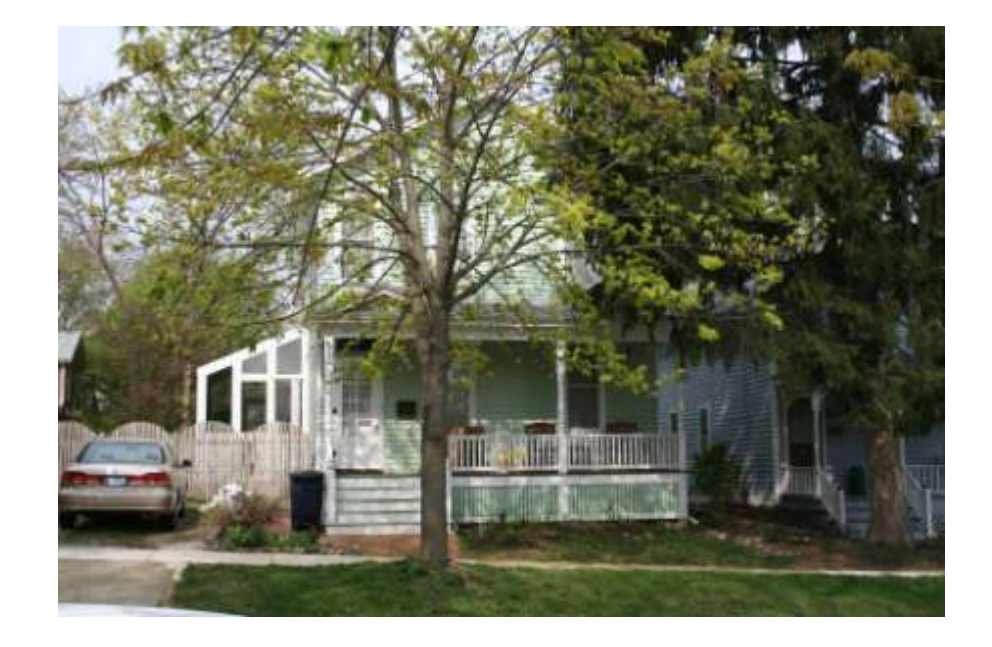
PHOTO INFO File name Fifth_546_2.JPG Date April-May, 2008