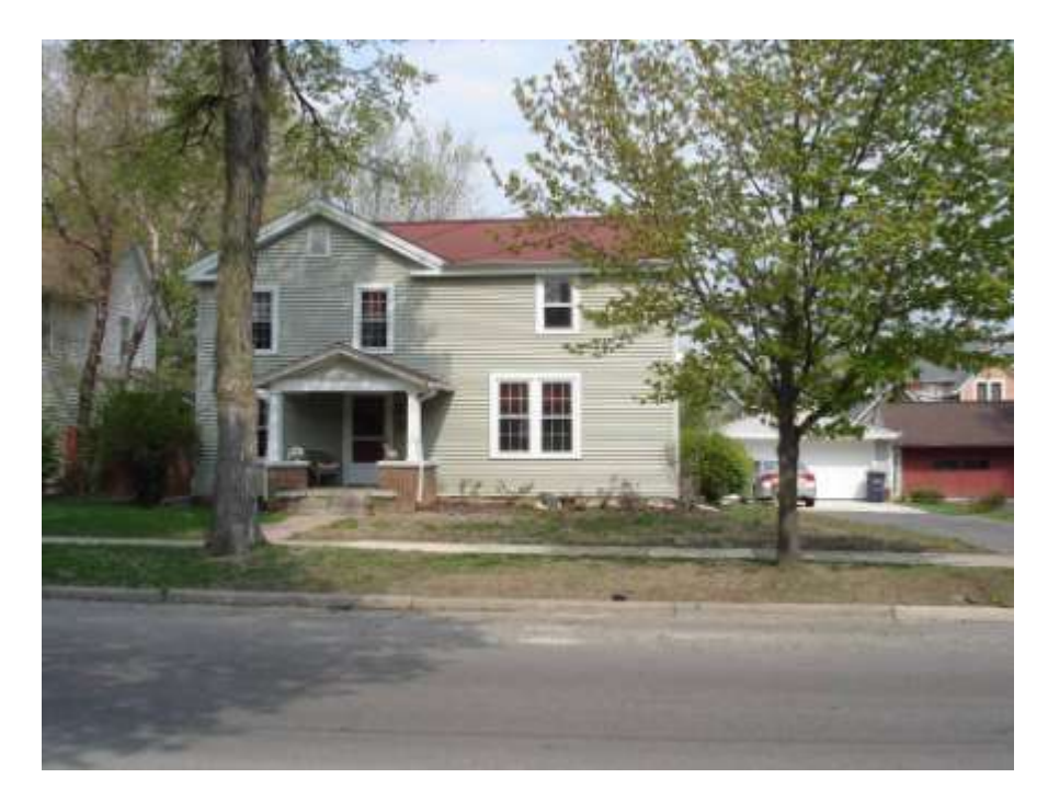
PHOTO INFO File name First_519_2.JPG Date April-May, 2008