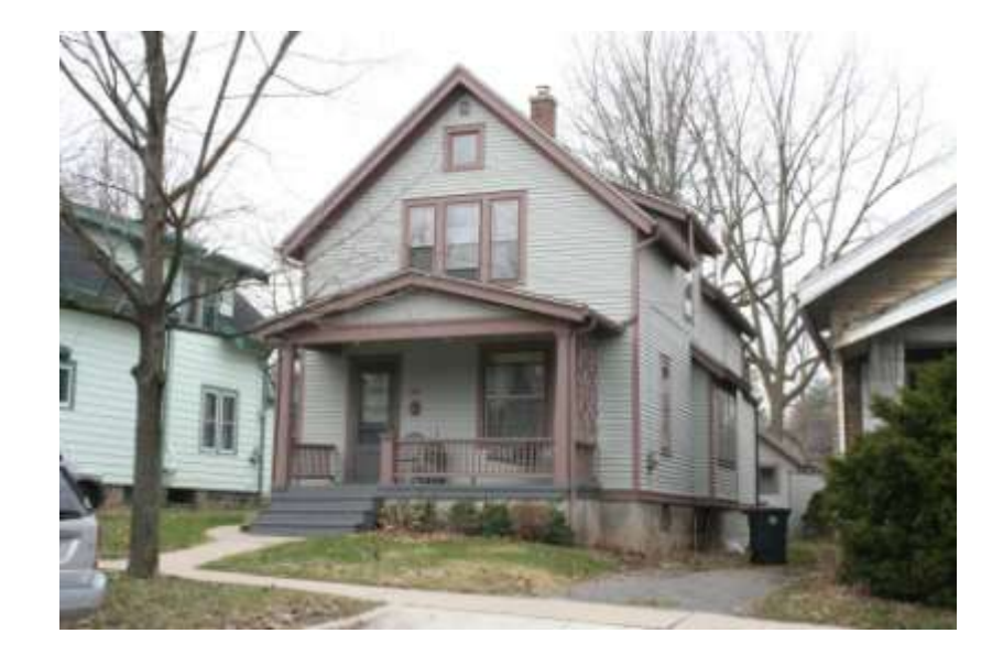
PHOTO INFO File name Fourth_510_2.JPG Date April-May, 2008