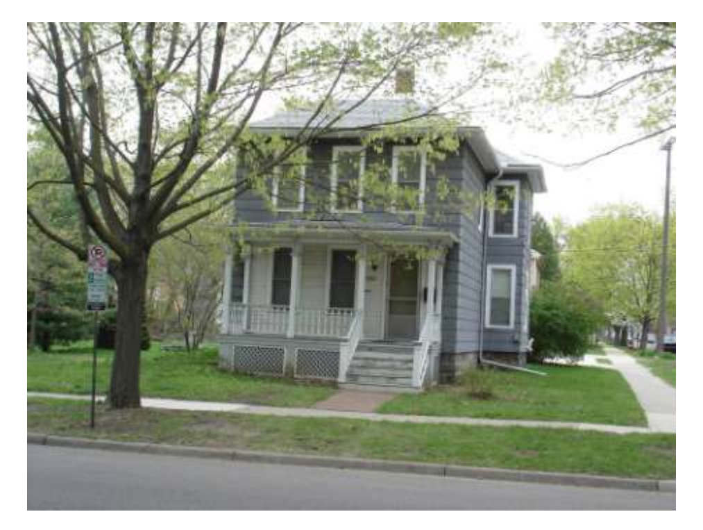
PHOTO INFO File name First_502_2.JPG Date April-May, 2008