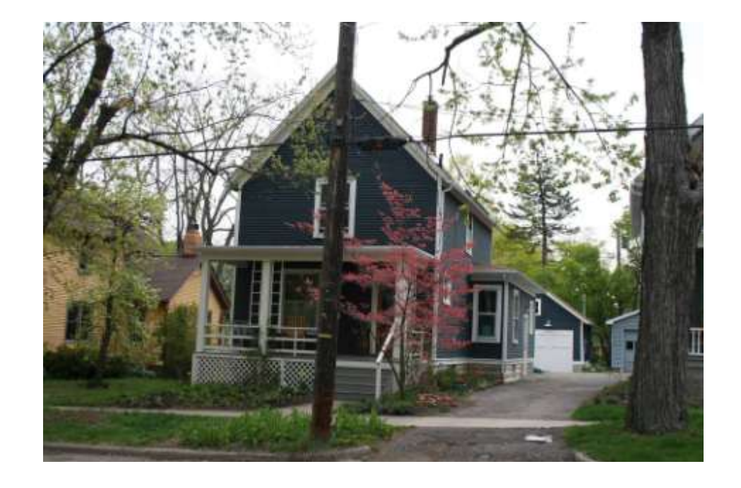
PHOTO INFO File name Fifth_529_1.JPG Date April-May, 2008