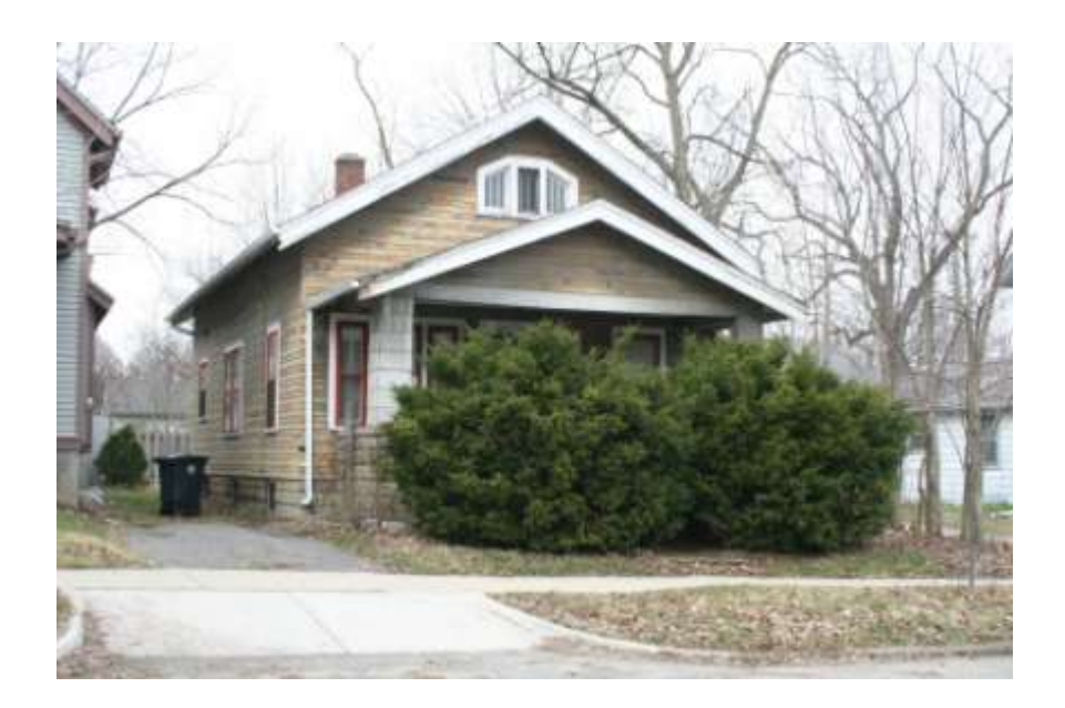
PHOTO INFO File name Fourth_508.JPG Date April-May, 2008