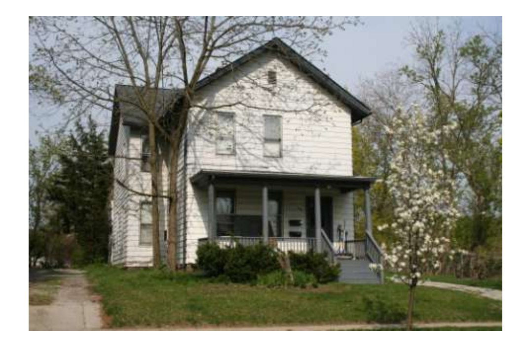
PHOTO INFO File name Fifth_432_2.JPG Date April-May, 2008