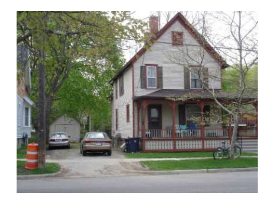
PHOTO INFO File name First_532.JPG Date April-May, 2008