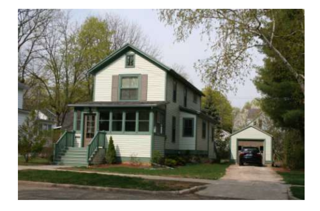
PHOTO INFO File name Fifth_516_1.JPG Date April-May, 2008