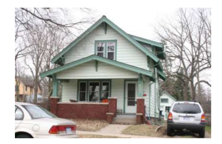
PHOTO INFO File name Fourth_512_2.JPG Date April-May, 2008