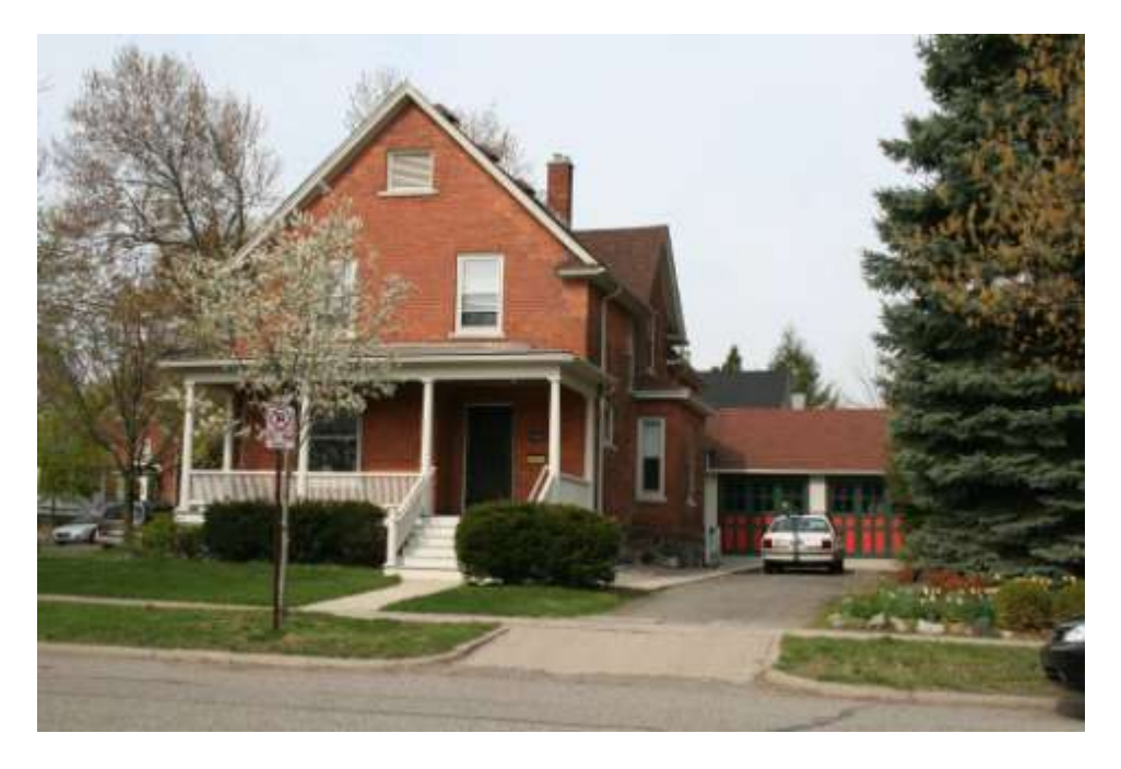
PHOTO INFO File name Fifth_454_1.JPG Date April-May, 2008