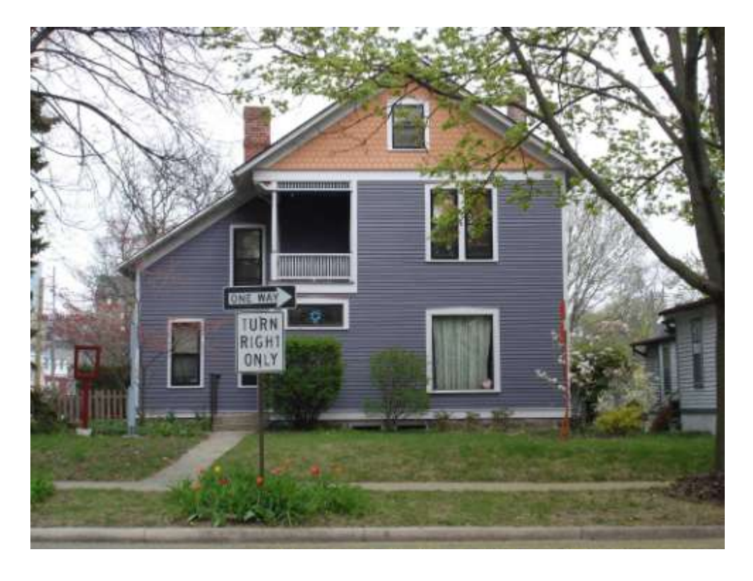
PHOTO INFO File name First_503_2.JPG Date April-May, 2008