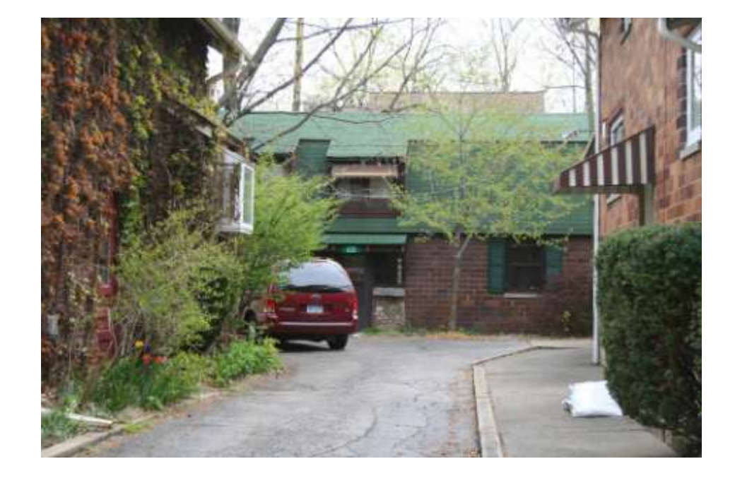
PHOTO INFO File name Fifth_635_1.JPG Date April-May, 2008