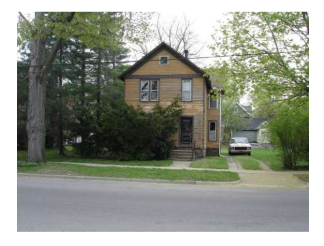
PHOTO INFO File name First_514.JPG Date April-May, 2008