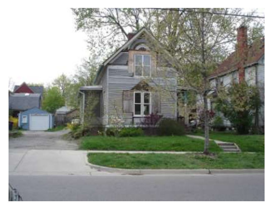
PHOTO INFO File name First_414.JPG Date April-May, 2008