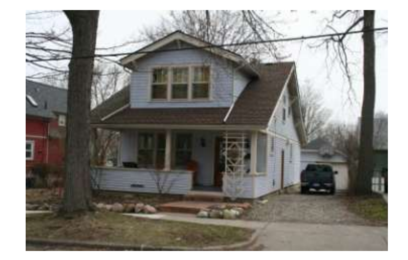
PHOTO INFO File name Fourth_523_4.JPG Date April-May, 2008