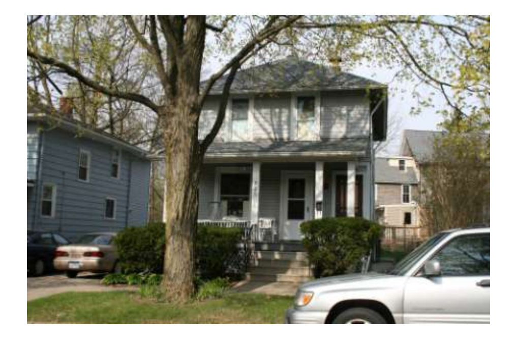
PHOTO INFO File name Fifth_326_1.JPG Date April-May, 2008