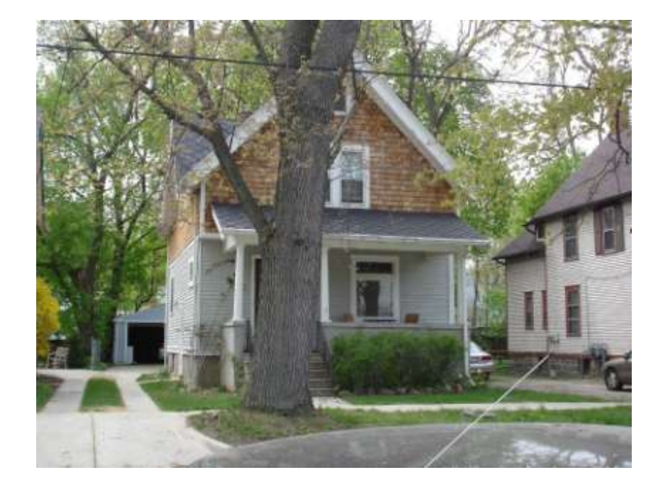
PHOTO INFO File name First_536.JPG Date April-May, 2008