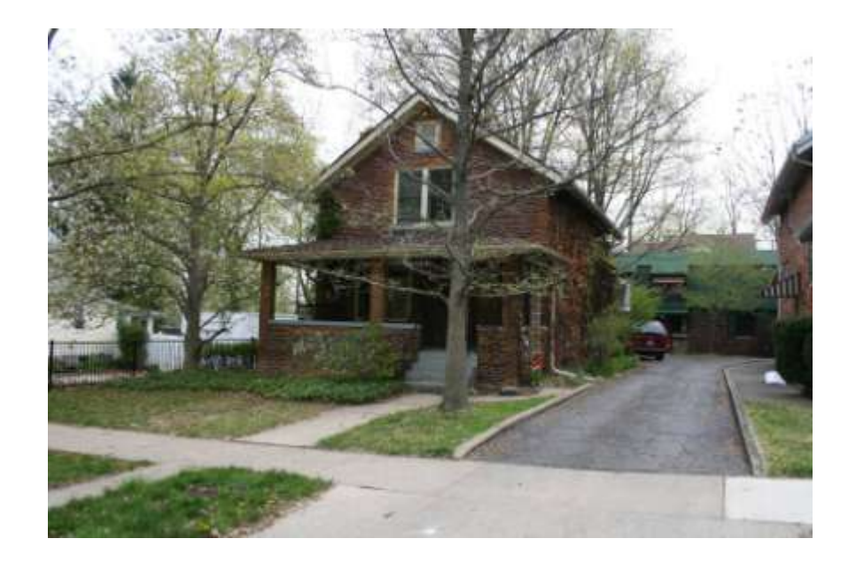
PHOTO INFO File name Fifth_633_1.JPG Date April-May, 2008