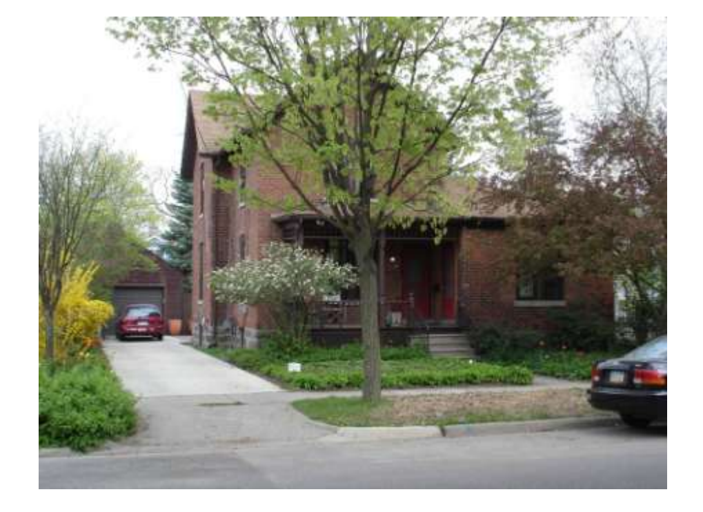
PHOTO INFO File name First_539.JPG Date April-May, 2008