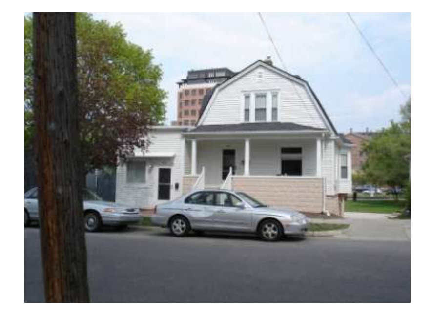
PHOTO INFO File name First_431-33.JPG Date April-May, 2008