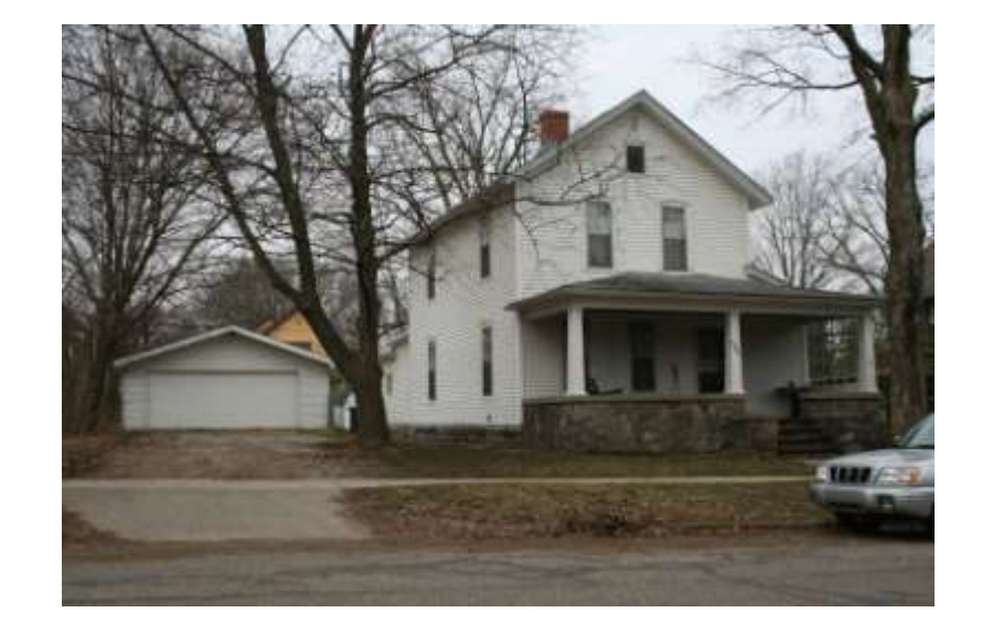
PHOTO INFO File name Fourth_524.JPG Date April-May, 2008