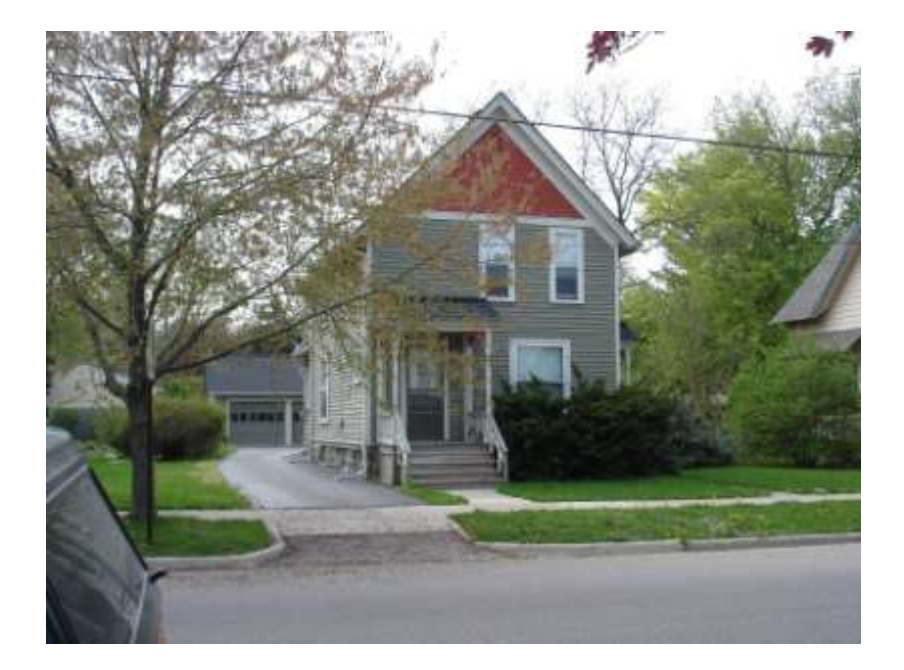
PHOTO INFO File name First_544.JPG Date April-May, 2008