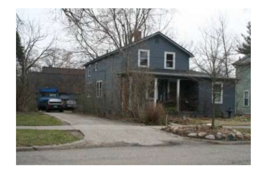
PHOTO INFO File name Fourth_437.JPG Date April-May, 2008