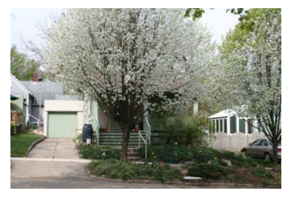
PHOTO INFO File name Fifth_550_2.JPG Date April-May, 2008