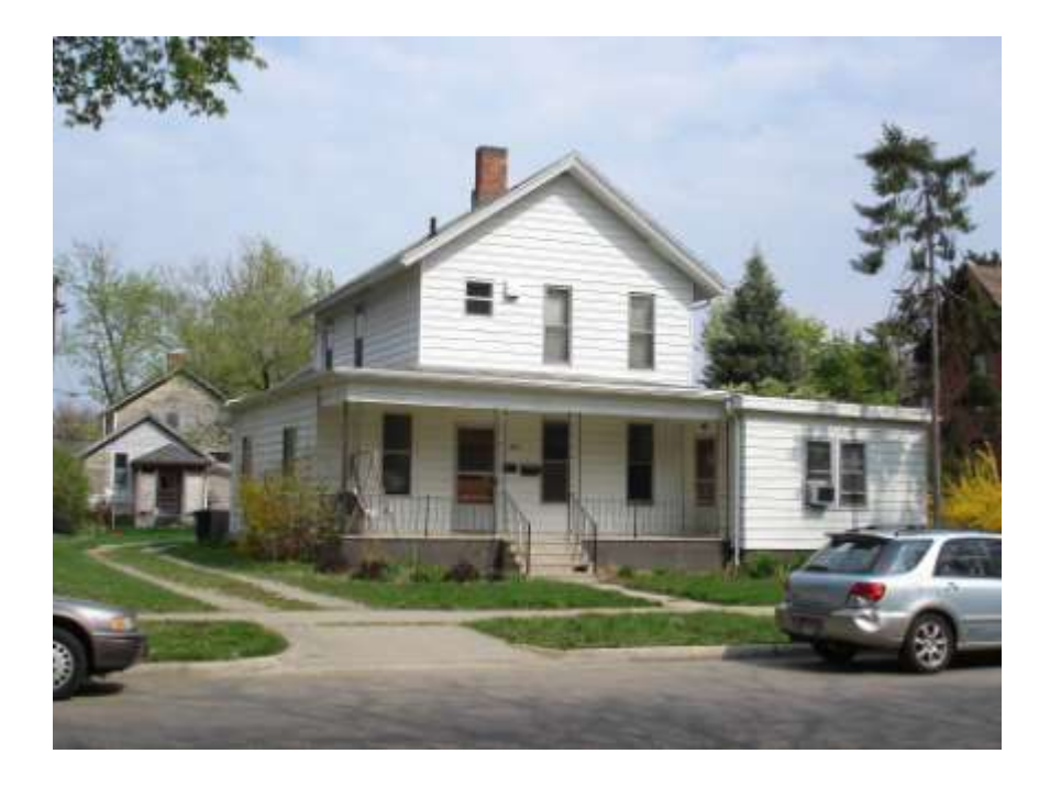
PHOTO INFO File name First_531.JPG Date April-May, 2008