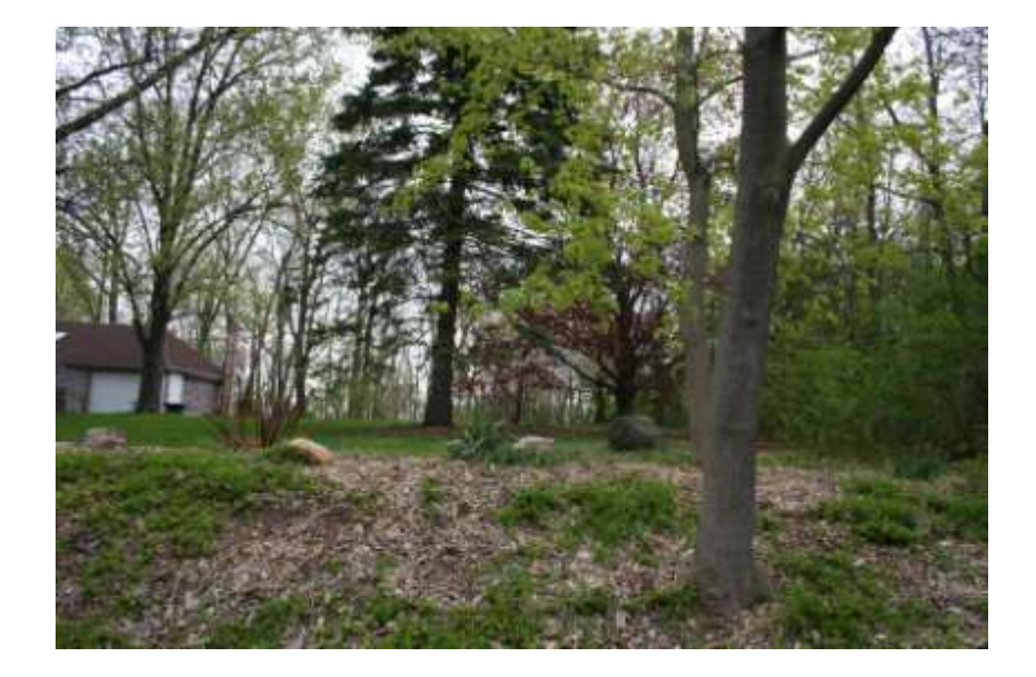
PHOTO INFO File name Fifth_713_1.JPG Date April-May, 2008