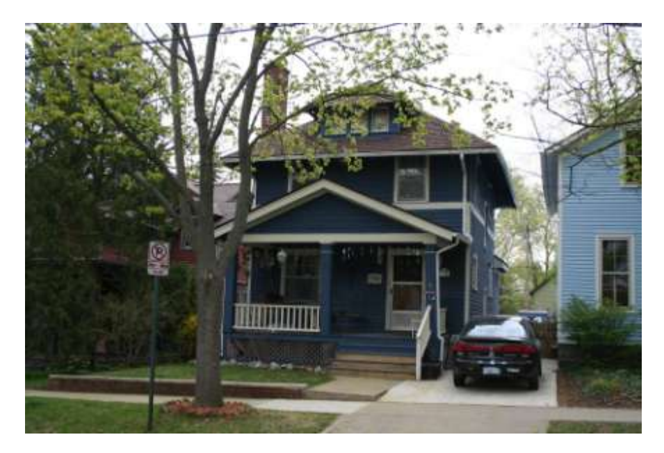
PHOTO INFO File name Fifth_519_1.JPG Date April-May, 2008