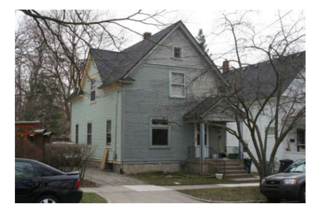
PHOTO INFO File name Fourth_309.JPG Date April-May, 2008