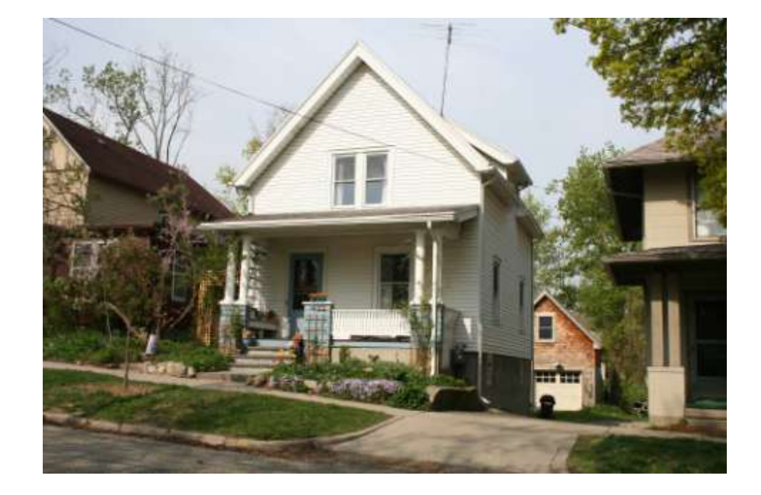
PHOTO INFO File name Fifth_422_1.JPG Date April-May, 2008