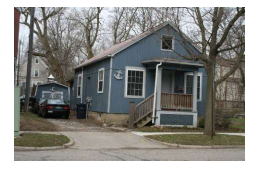
PHOTO INFO File name Fourth_344.JPG Date April-May, 2008