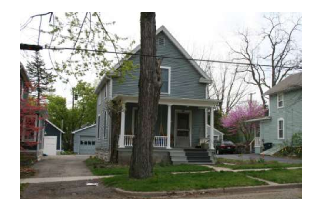
PHOTO INFO File name Fifth_533_2.JPG Date April-May, 2008