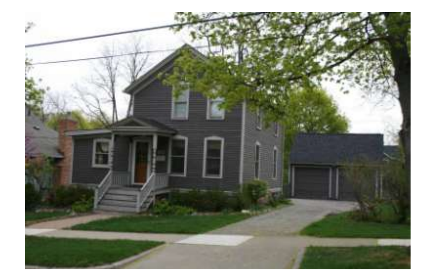
PHOTO INFO File name Fifth_543_1.JPG Date April-May, 2008