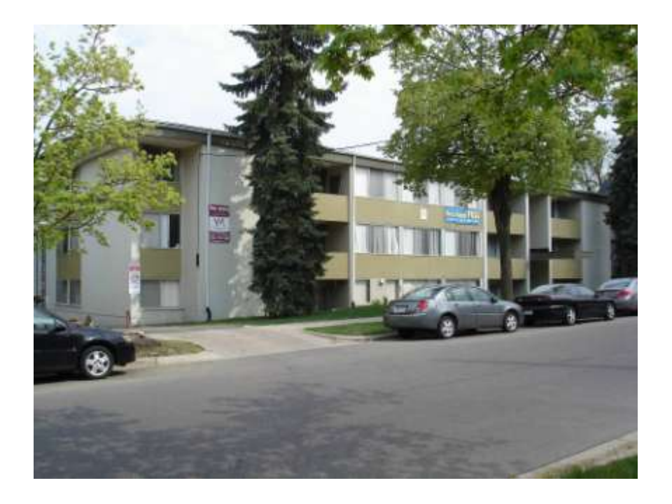
PHOTO INFO File name First_441.JPG Date April-May, 2008