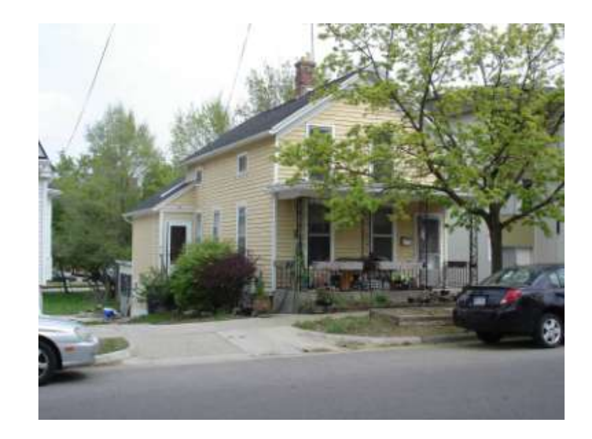
PHOTO INFO File name First_435.JPG Date April-May, 2008