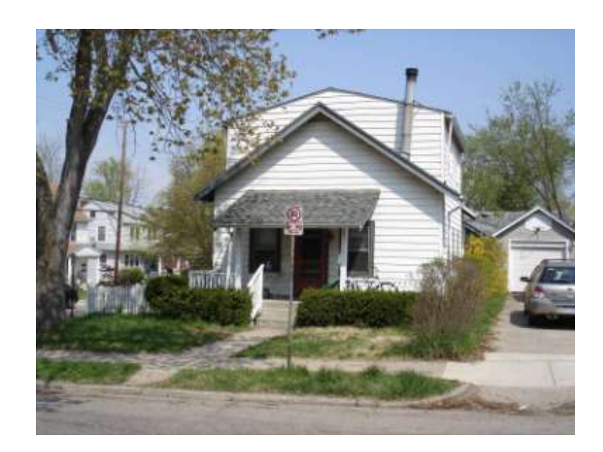
PHOTO INFO File name First_801.JPG Date April-May, 2008