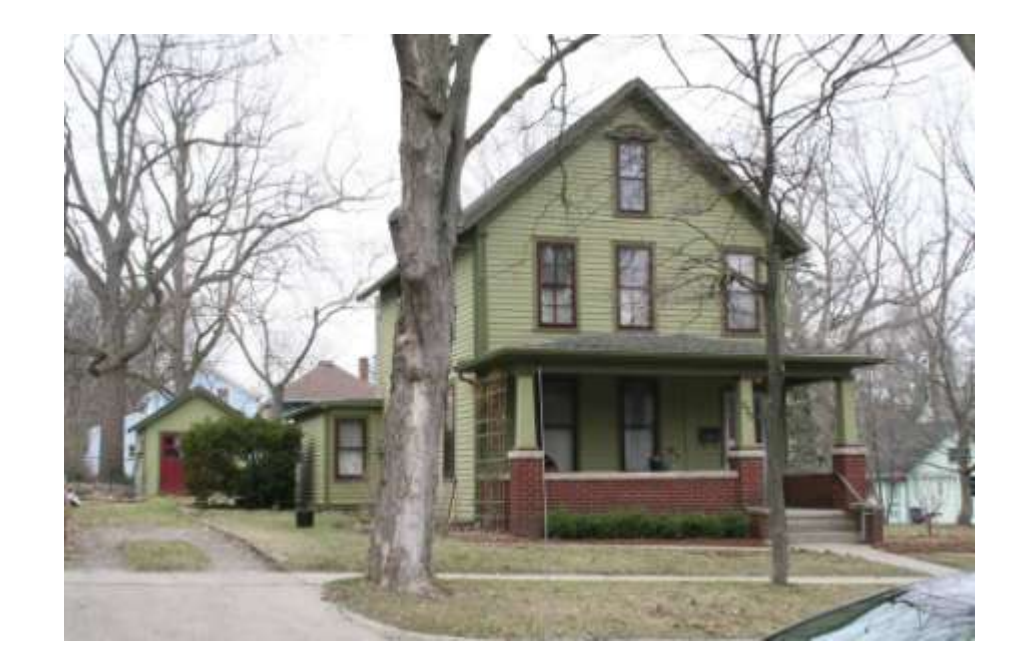
PHOTO INFO File name Fourth_520.JPG Date April-May, 2008