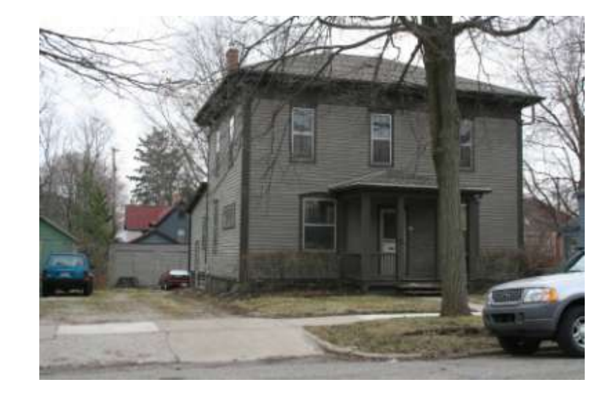
PHOTO INFO File name Fourth_431.JPG Date April-May, 2008