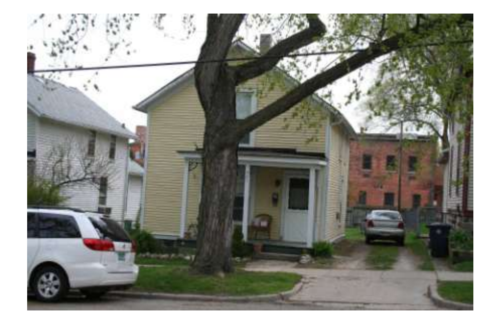
PHOTO INFO File name Fifth_421_1.JPG Date April-May, 2008