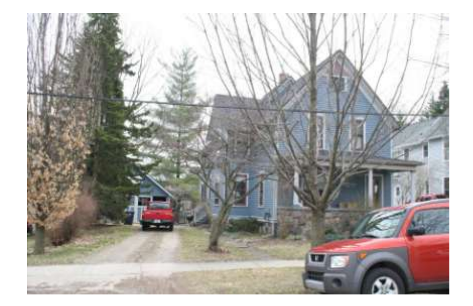
PHOTO INFO File name Fourth_509_4.JPG Date April-May, 2008