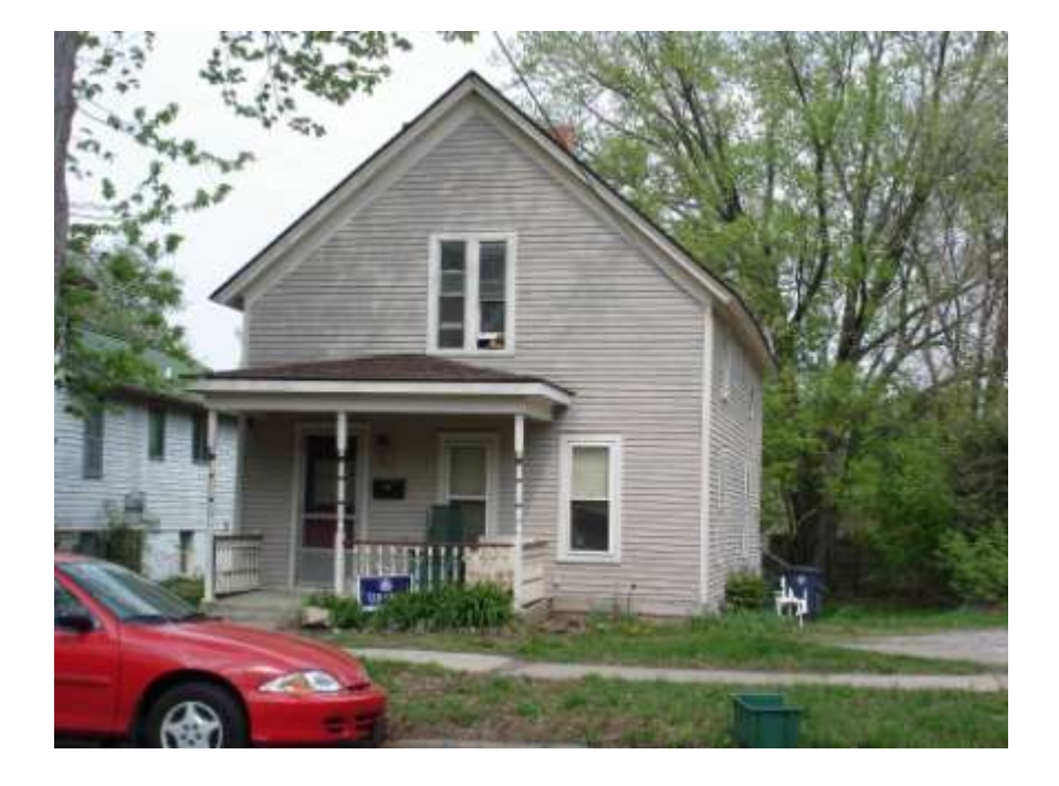
PHOTO INFO File name First_511.JPG Date April-May, 2008