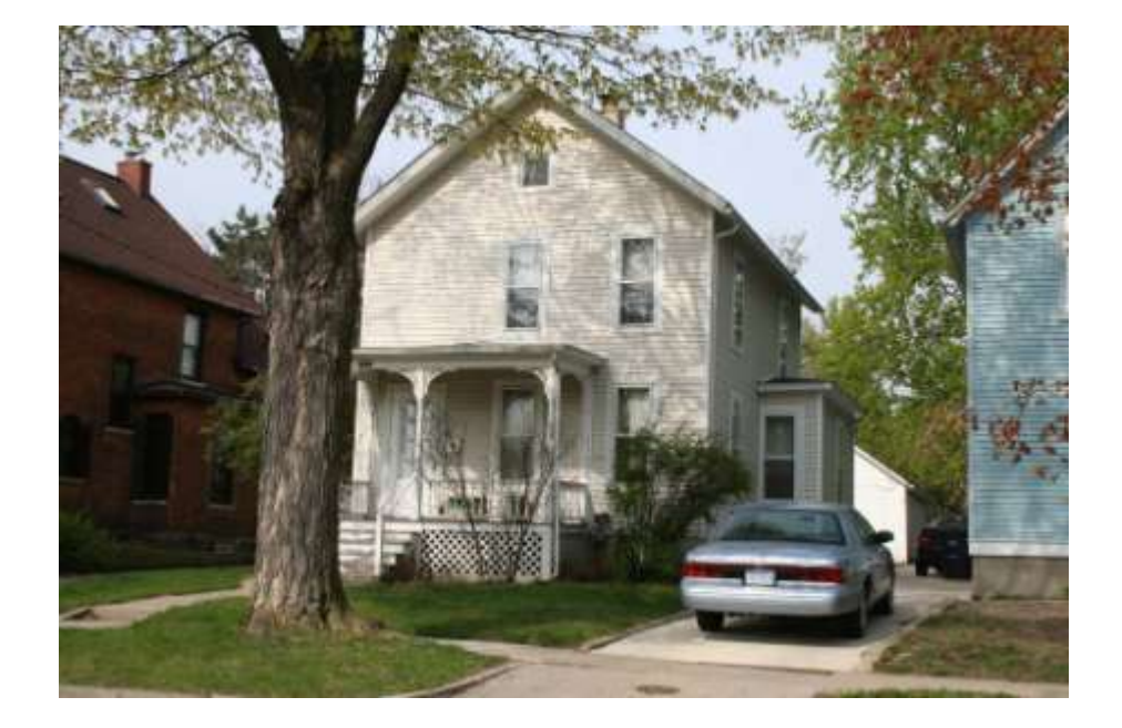
PHOTO INFO File name Fifth_444_1.JPG Date April-May, 2008