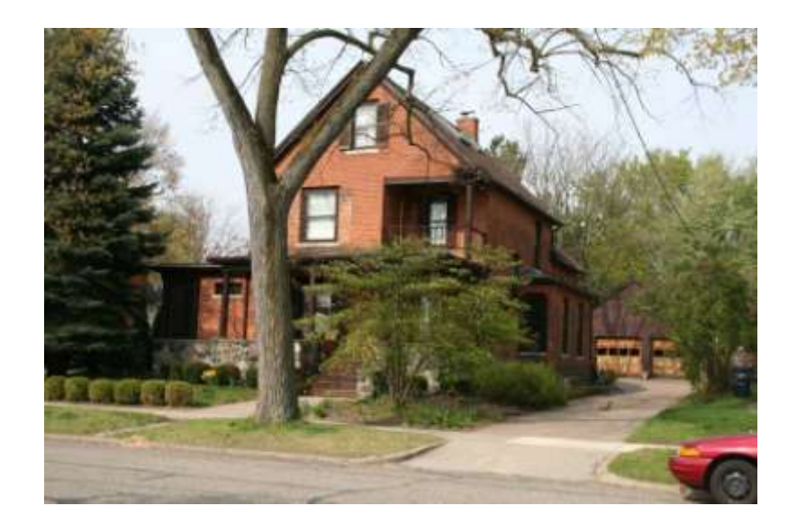
PHOTO INFO File name Fifth_448_1.JPG Date April-May, 2008