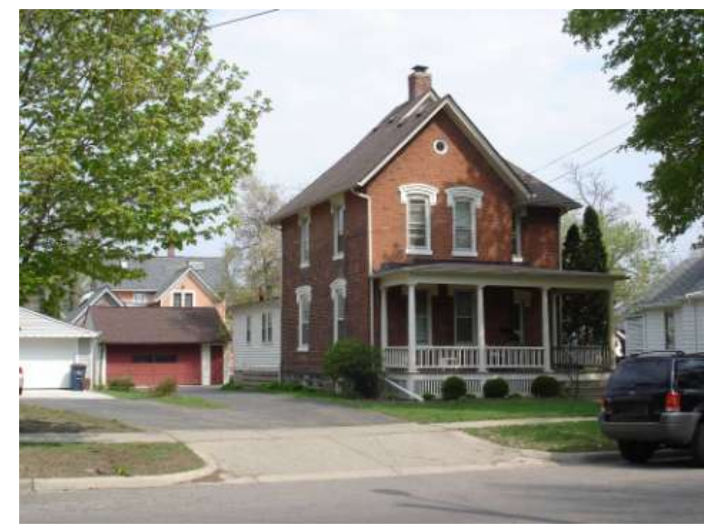
PHOTO INFO File name First_525.JPG Date April-May, 2008