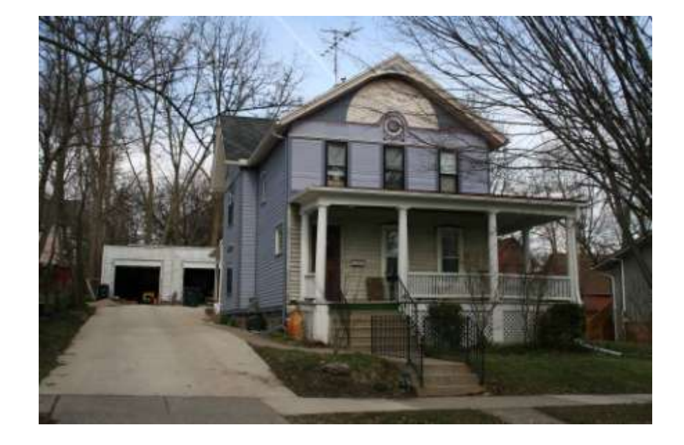
PHOTO INFO File name First_614_2.JPG Date April-May, 2008