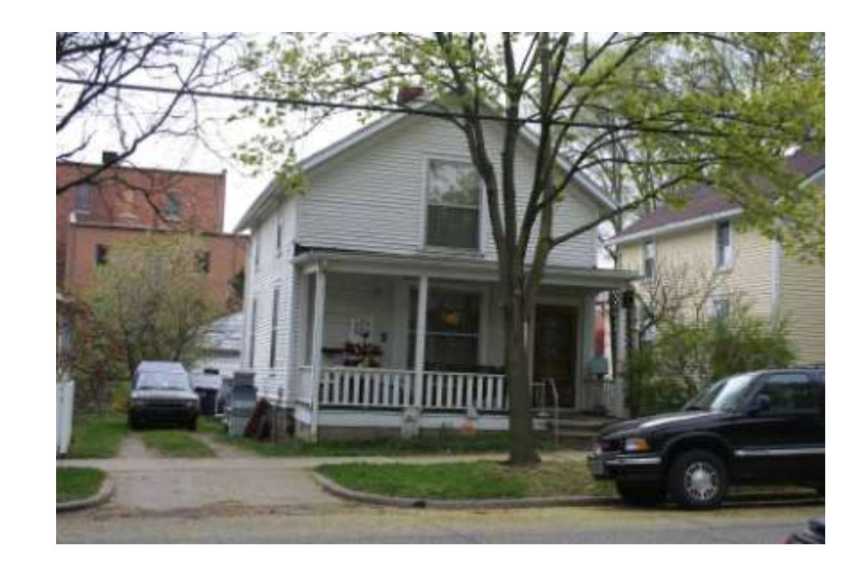
PHOTO INFO File name Fifth_417_2.JPG Date April-May, 2008