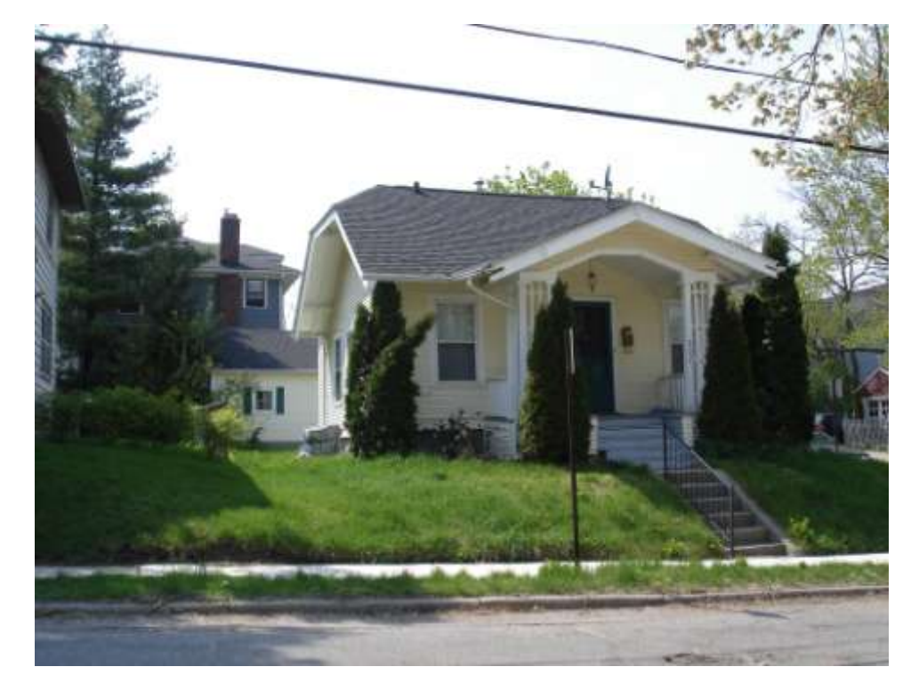
PHOTO INFO File name First_802_2.JPG Date April-May, 2008