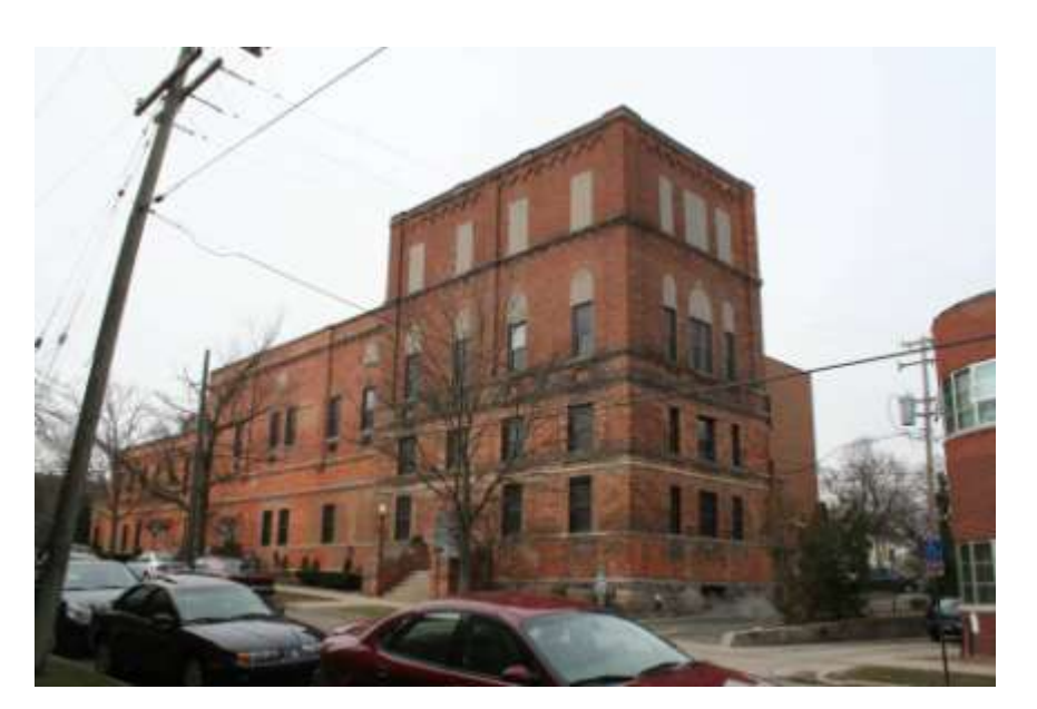
PHOTO INFO File name Fourth_416_2.JPG Date April-May, 2008