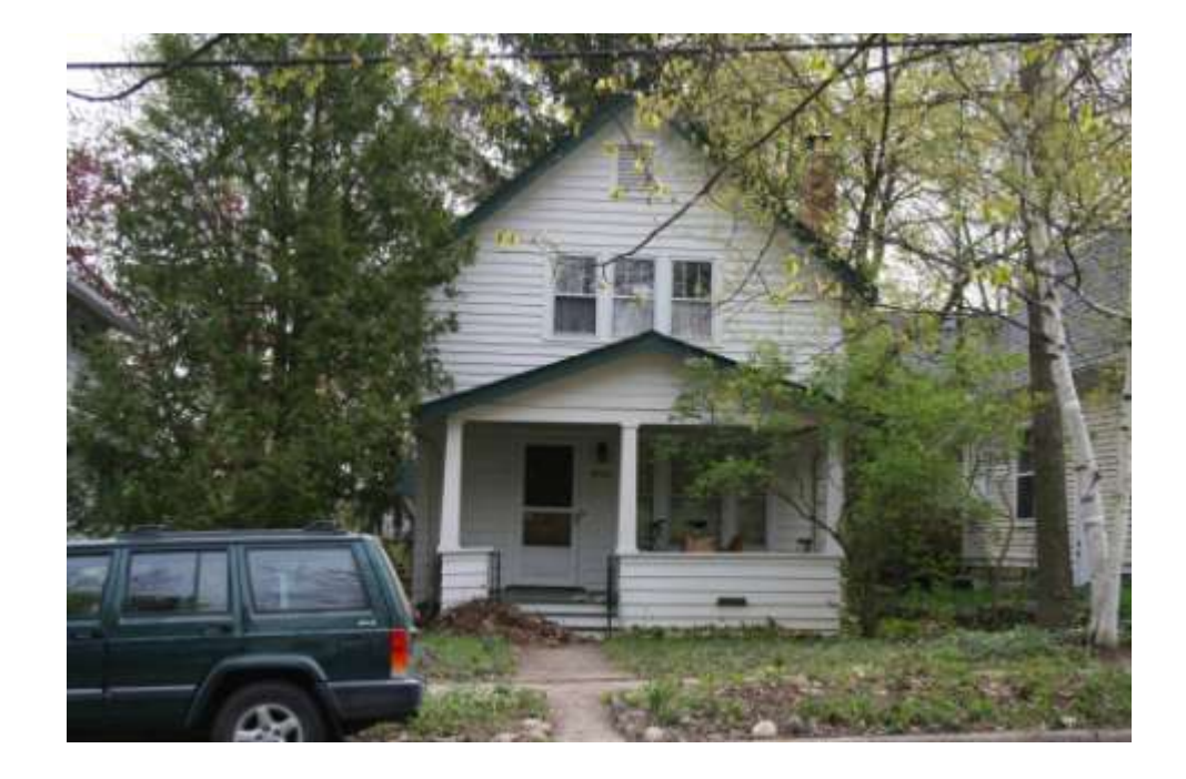
PHOTO INFO File name Fifth_625_2.JPG Date April-May, 2008