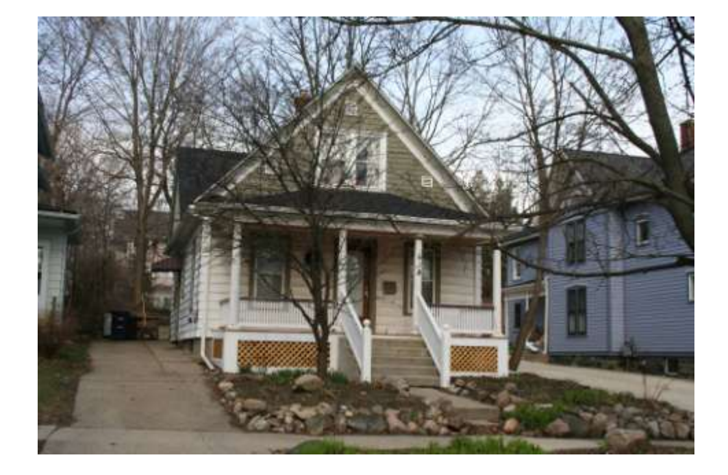
PHOTO INFO File name First_618_2.JPG Date April-May, 2008