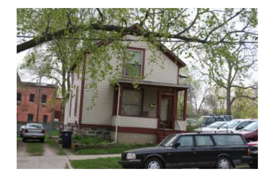
PHOTO INFO File name Fifth_425_2.JPG Date April-May, 2008