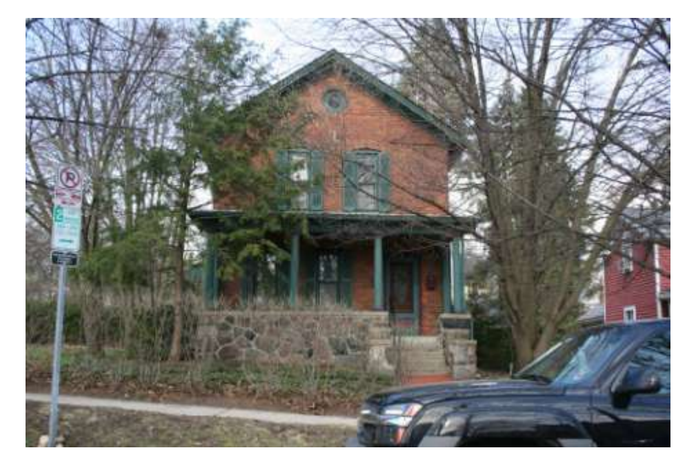
PHOTO INFO File name First_632_2.JPG Date April-May, 2008