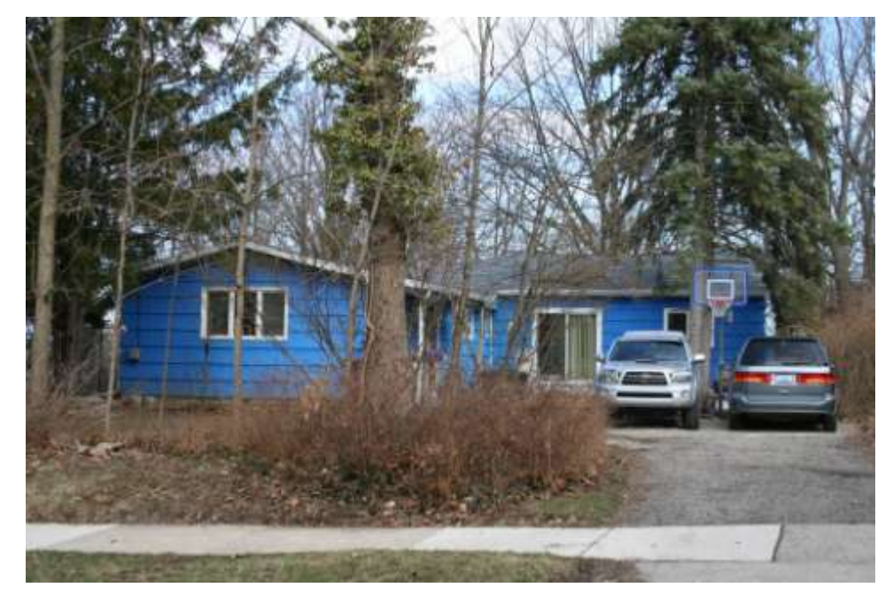
PHOTO INFO File name Fifth_731_2.JPG Date April-May, 2008

This building has had major modifications and is no longer recognizable as its original use, a bowling alley.