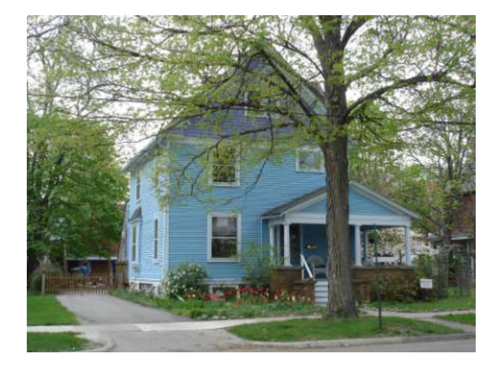
PHOTO INFO File name First_524.JPG Date April-May, 2008