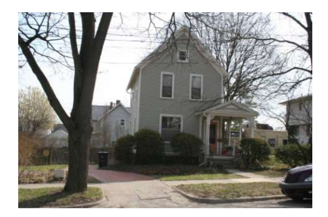
PHOTO INFO File name First_631.JPG Date April-May, 2008