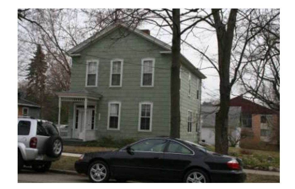
PHOTO INFO File name Fourth_443_2.JPG Date April-May, 2008