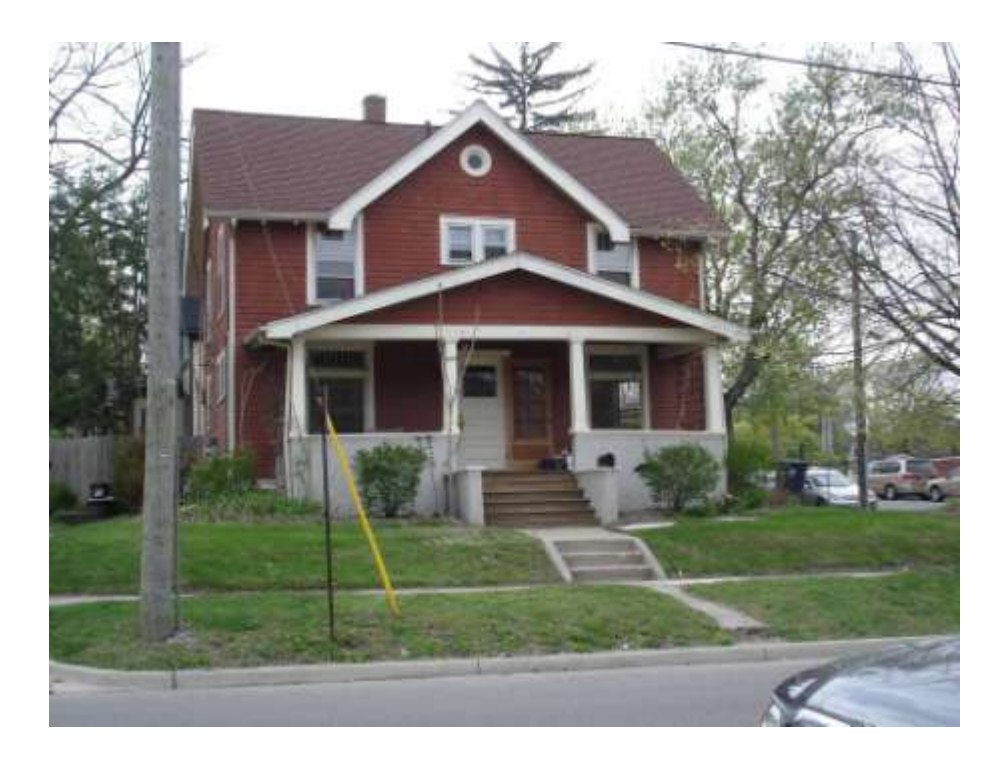
PHOTO INFO File name First_404.JPG Date April-May, 2008