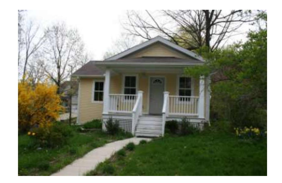
PHOTO INFO File name Fifth_639_1.JPG Date April-May, 2008