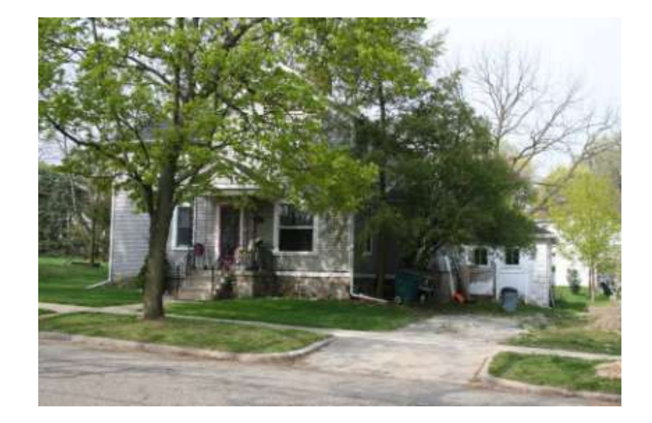
PHOTO INFO File name Fifth_532_2.JPG Date April-May, 2008