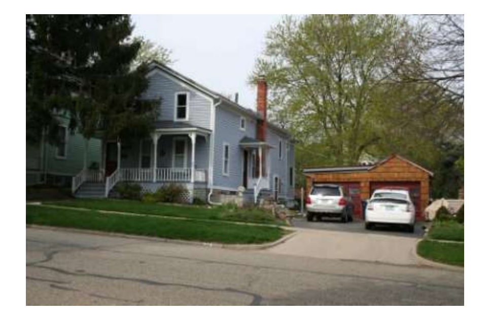
PHOTO INFO File name Fifth_544_1.JPG Date April-May, 2008