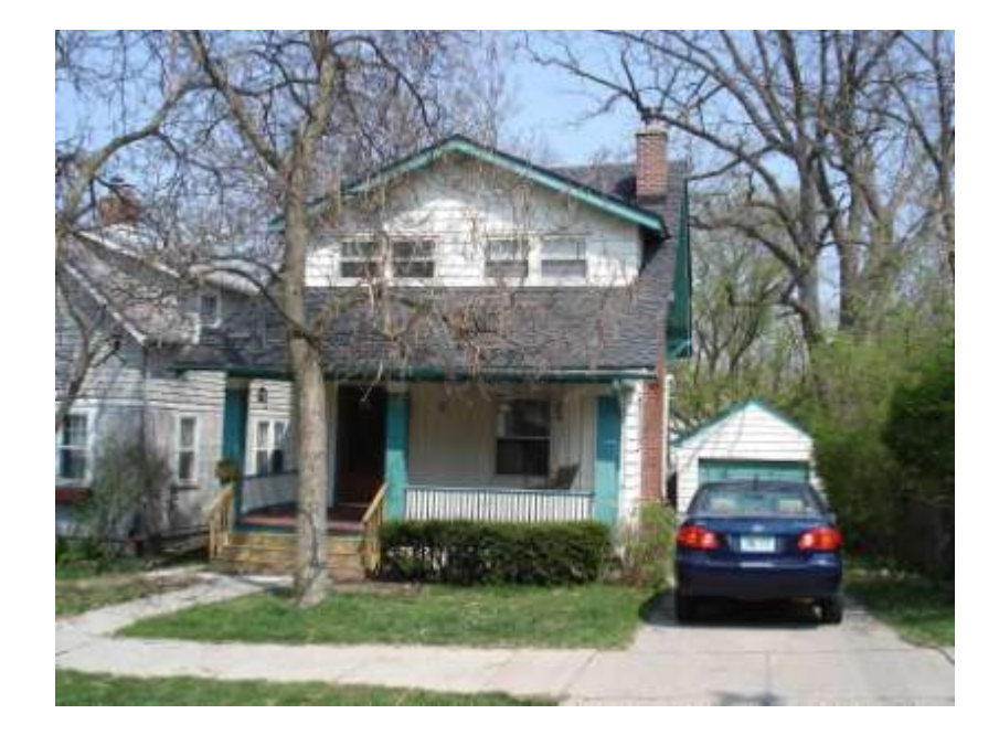
PHOTO INFO File name First_805.JPG Date April-May, 2008