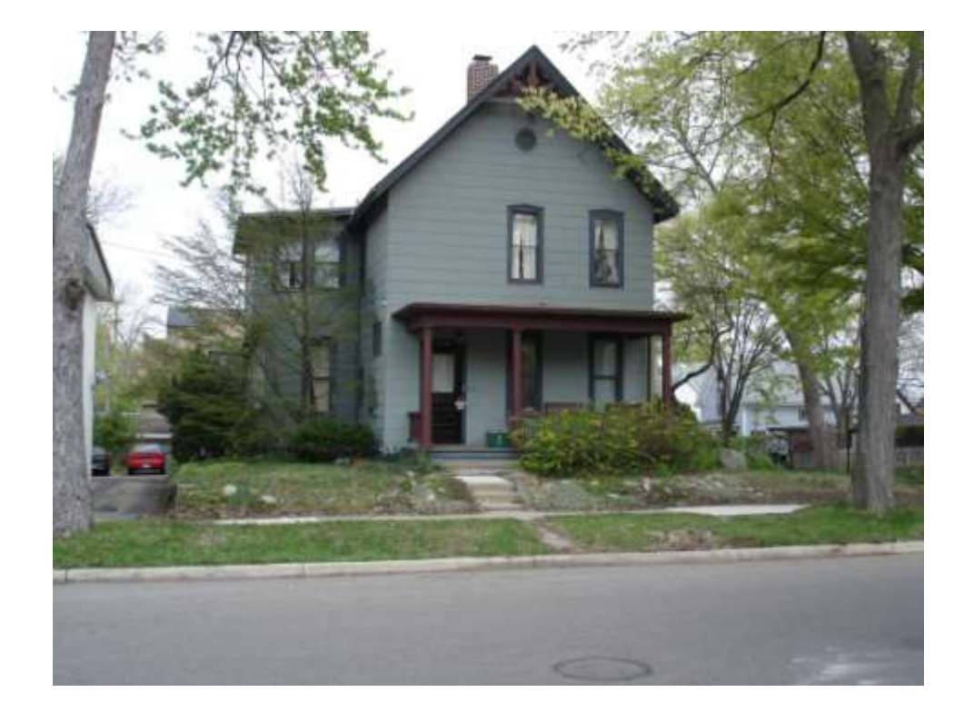
PHOTO INFO File name First_453.JPG Date April-May, 2008