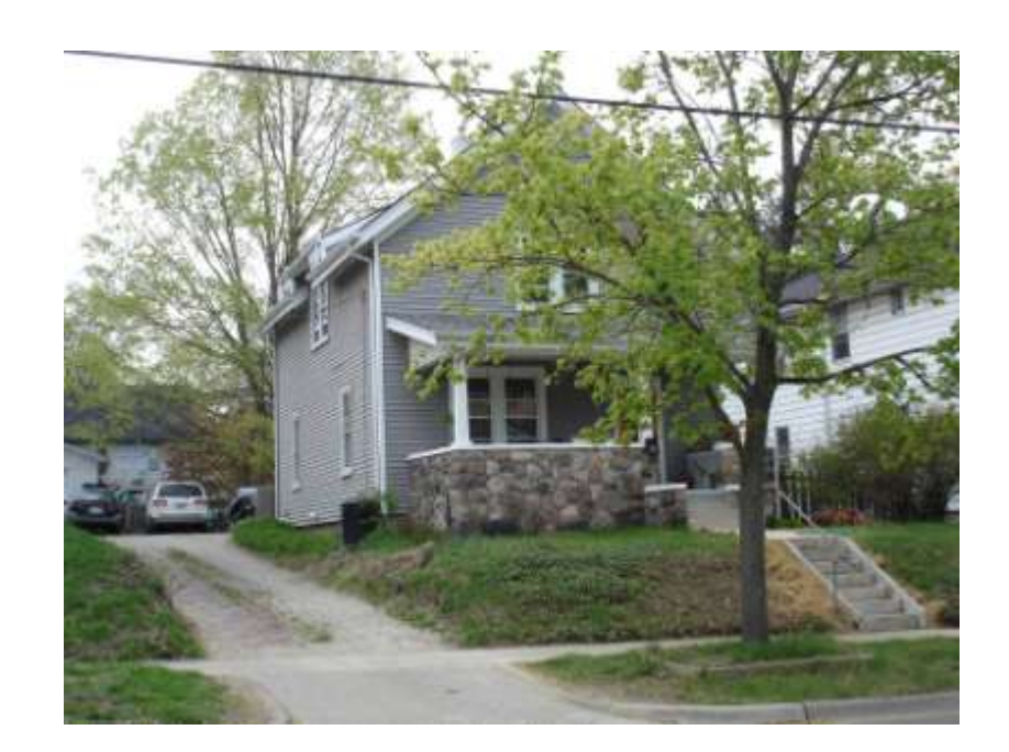
PHOTO INFO File name First_430.JPG Date April-May, 2008