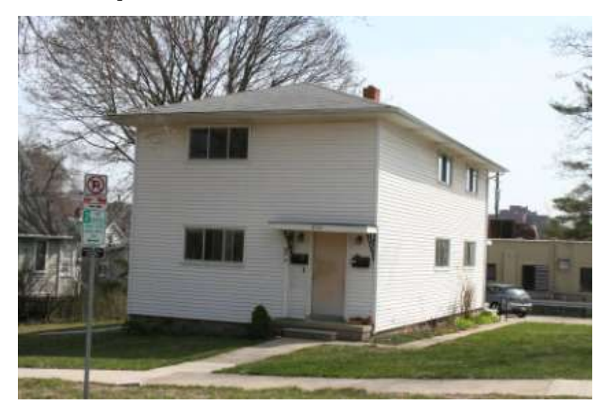
PHOTO INFO File name First_635_2.JPG Date April-May, 2008