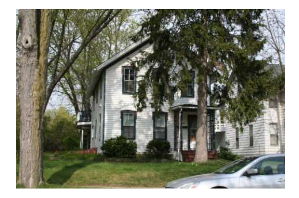
PHOTO INFO File name Fifth_436_2.JPG Date April-May, 2008