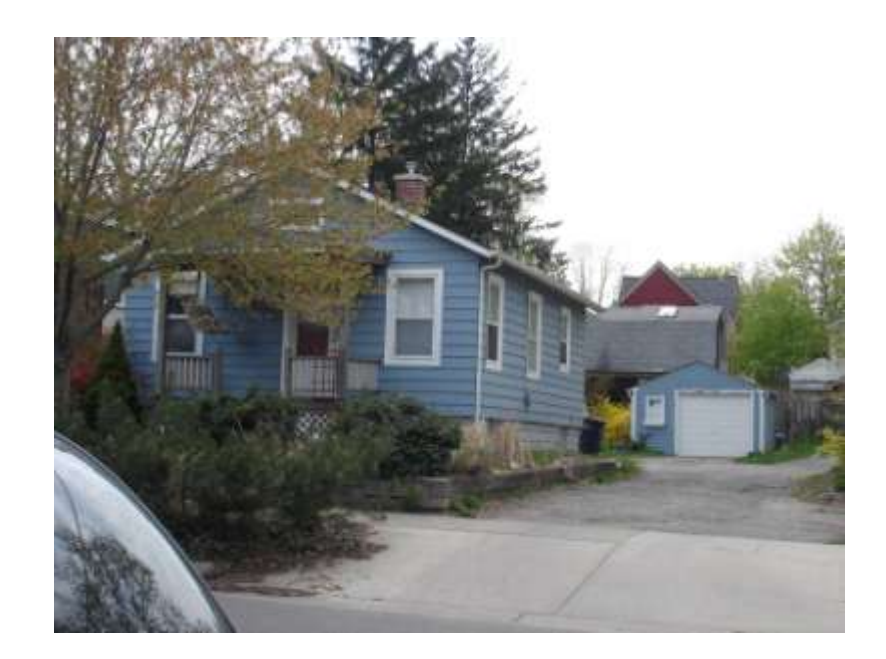
PHOTO INFO File name First_418_2.JPG Date April-May, 2008