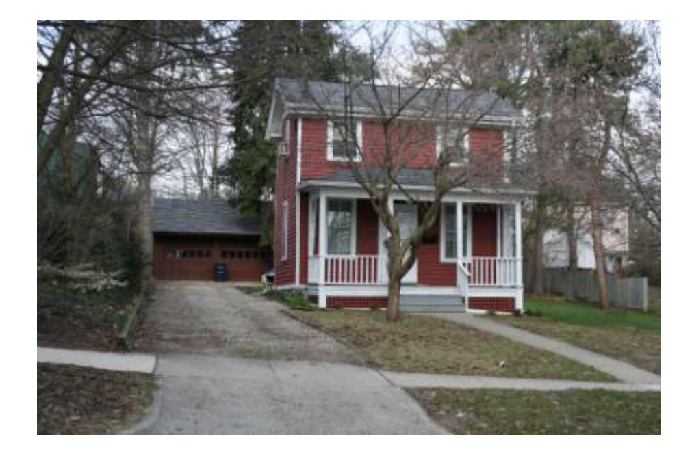
PHOTO INFO File name First_628_2.JPG Date April-May, 2008