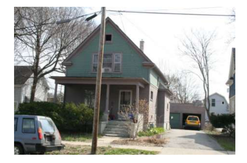
PHOTO INFO File name First_609_2.JPG Date April-May, 2008