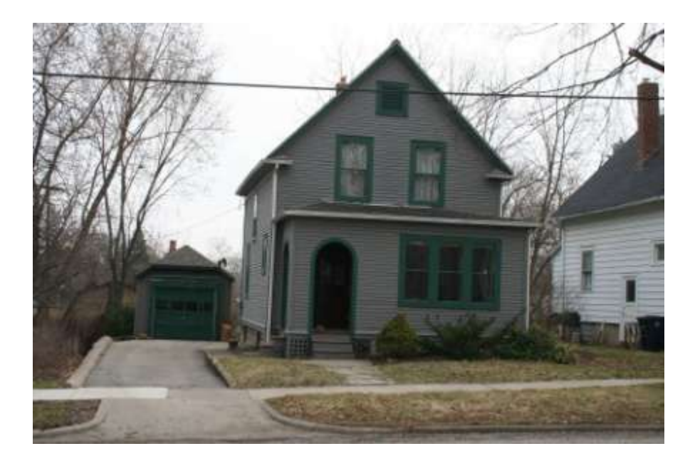
PHOTO INFO File name Fourth_539.JPG Date April-May, 2008