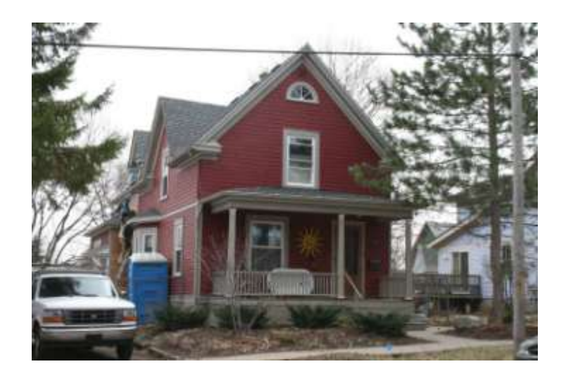
PHOTO INFO File name Fourth_519_3.JPG Date April-May, 2008