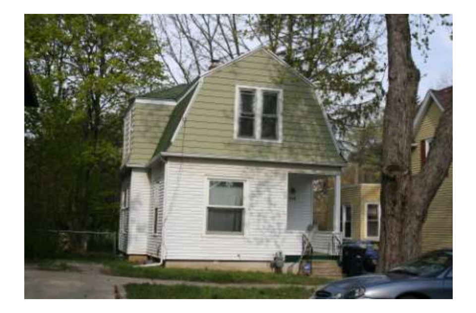
PHOTO INFO File name Fifth_416_2.JPG Date April-May, 2008