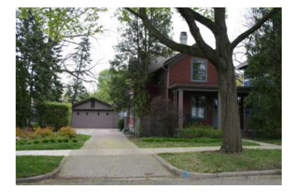
PHOTO INFO File name Fifth_515_2.JPG Date April-May, 2008