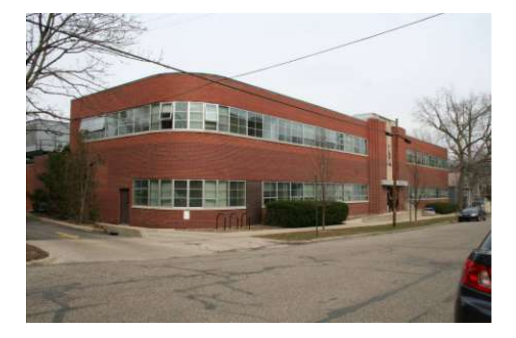
PHOTO INFO File name Fourth_400.JPG Date April-May, 2008