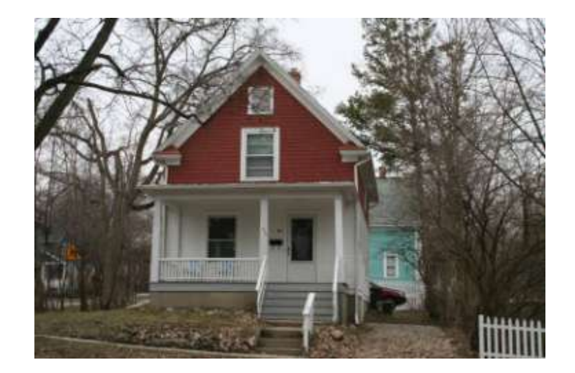
PHOTO INFO File name Fourth_554_3.JPG Date April-May, 2008