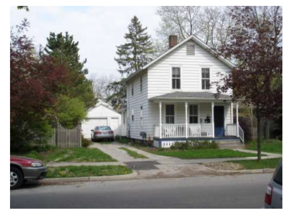
PHOTO INFO File name First_543.JPG Date April-May, 2008