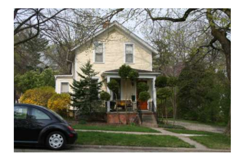
PHOTO INFO File name Fifth_538_2.JPG Date April-May, 2008