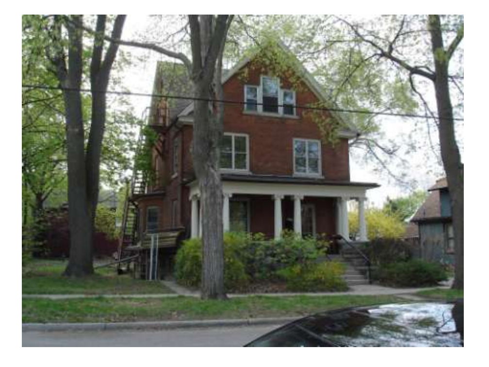
PHOTO INFO File name First_554.JPG Date April-May, 2008