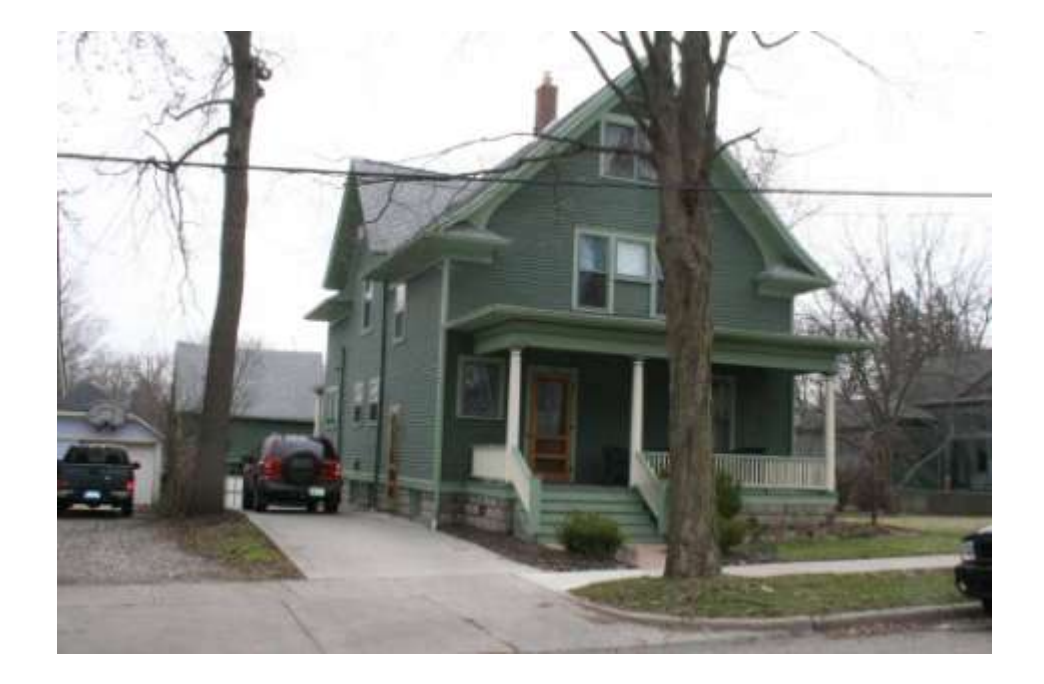
PHOTO INFO File name Fourth_525.JPG Date April-May, 2008