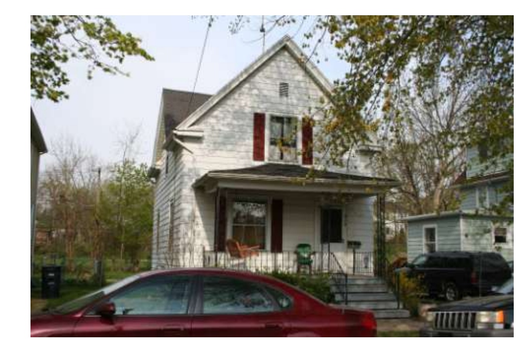
PHOTO INFO File name Fifth_410_2.JPG Date April-May, 2008