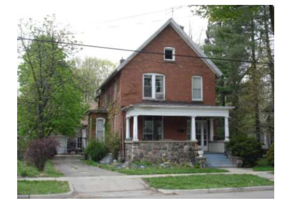
PHOTO INFO File name First_520.JPG Date April-May, 2008