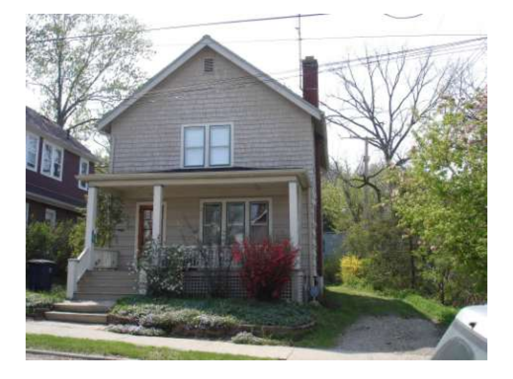
PHOTO INFO File name First_710.JPG Date April-May, 2008