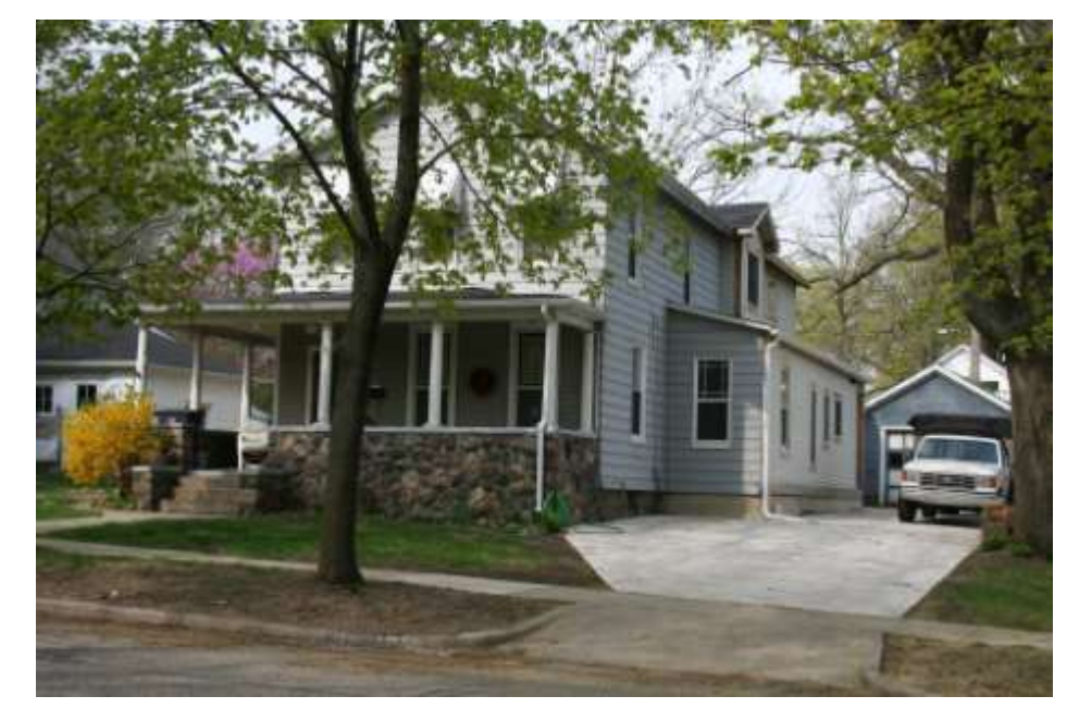
PHOTO INFO File name Fifth_526_2.JPG Date April-May, 2008