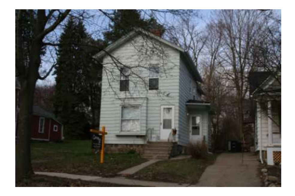
PHOTO INFO File name First_622.JPG Date April-May, 2008