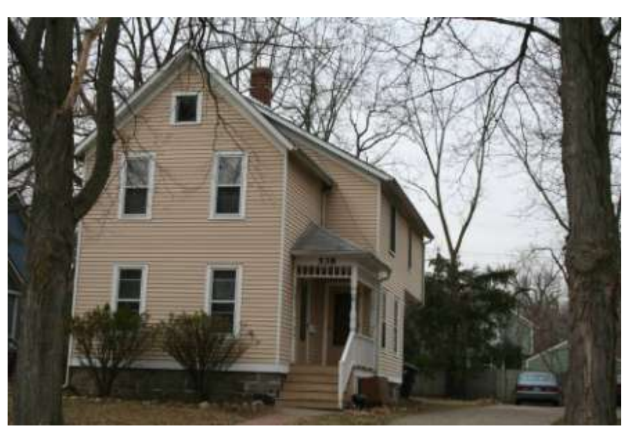
PHOTO INFO File name Fourth_538_3.JPG  Date April-May, 2008