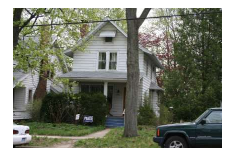
PHOTO INFO File name Fifth_621_1.JPG Date April-May, 2008