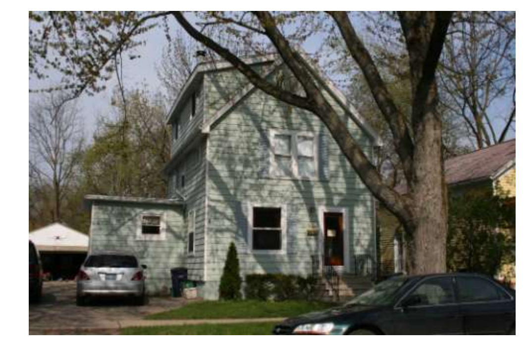
PHOTO INFO File name Fifth_406_2.JPG Date April-May, 2008