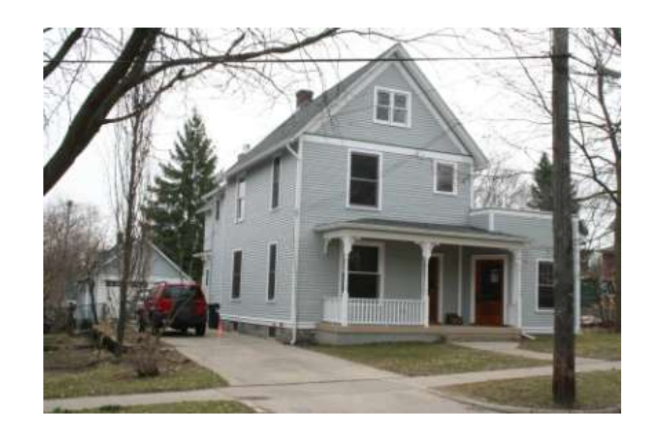
PHOTO INFO File name Fourth_513.JPG Date April-May, 2008