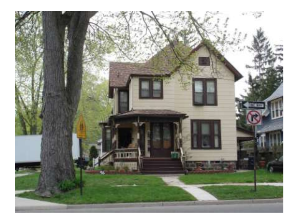
PHOTO INFO File name First_454_2.JPG Date April-May, 2008