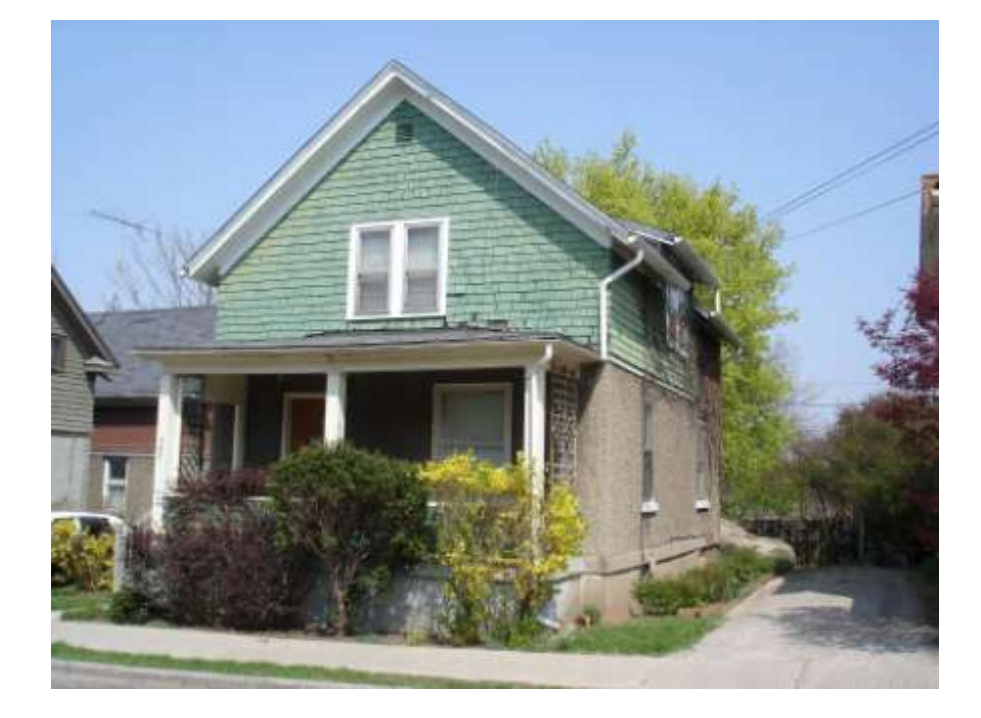
PHOTO INFO File name First_707.JPG Date April-May, 2008