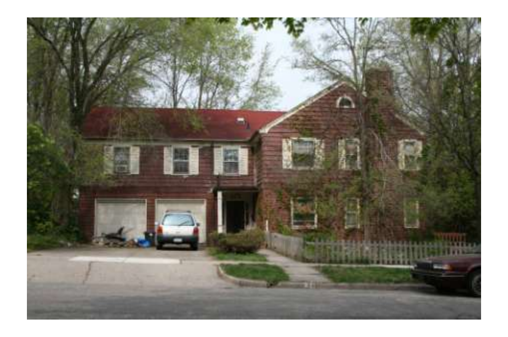
PHOTO INFO File name Fifth_602_2a.JPG Date April-May, 2008