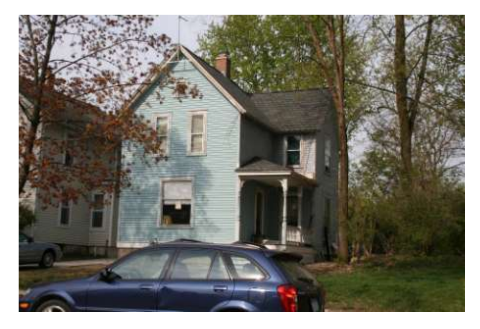
PHOTO INFO File name Fifth_442_1.JPG Date April-May, 2008