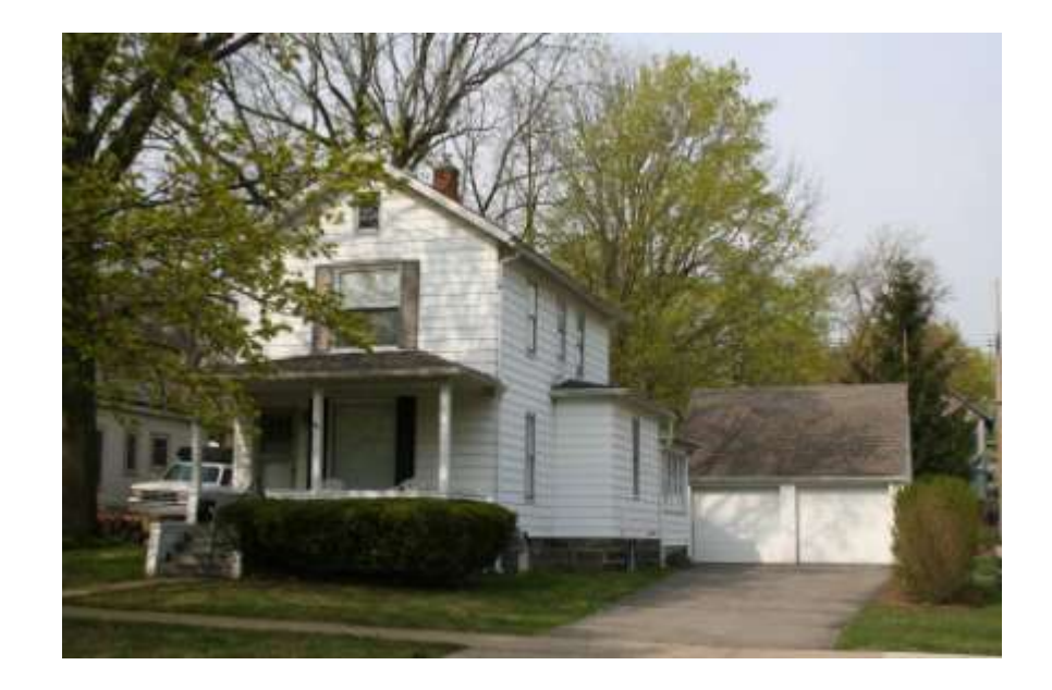
PHOTO INFO File name Fifth_520_1.JPG Date April-May, 2008