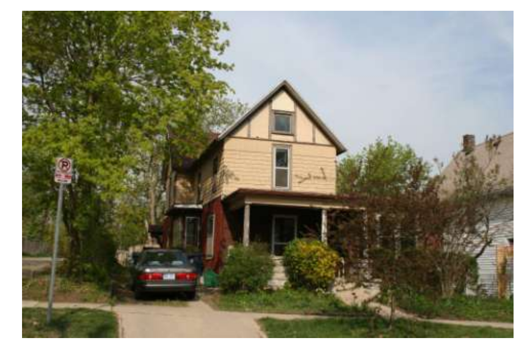
PHOTO INFO File name Fifth_426_2.JPG Date April-May, 2008