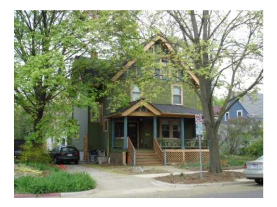
PHOTO INFO File name First_553.JPG Date April-May, 2008