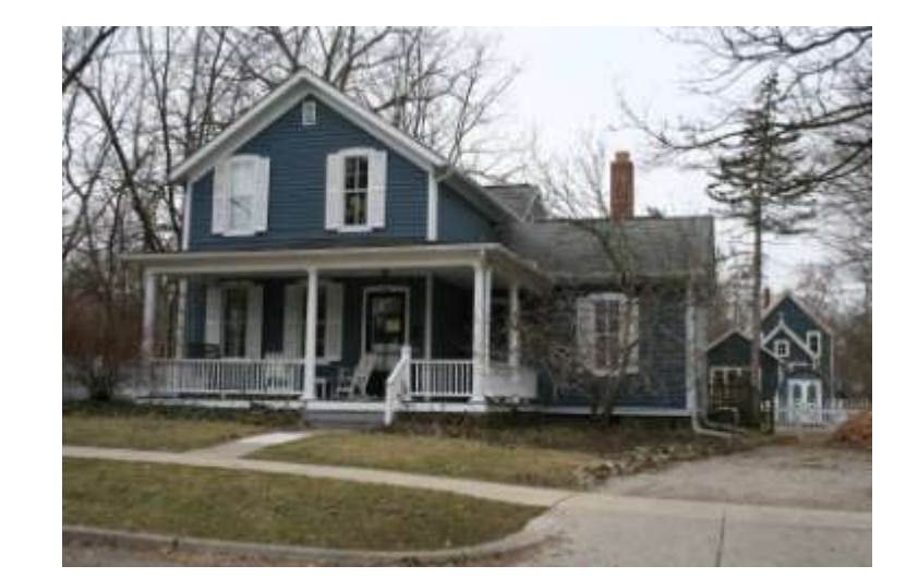
PHOTO INFO File name Fourth_532_2.JPG Date April-May, 2008