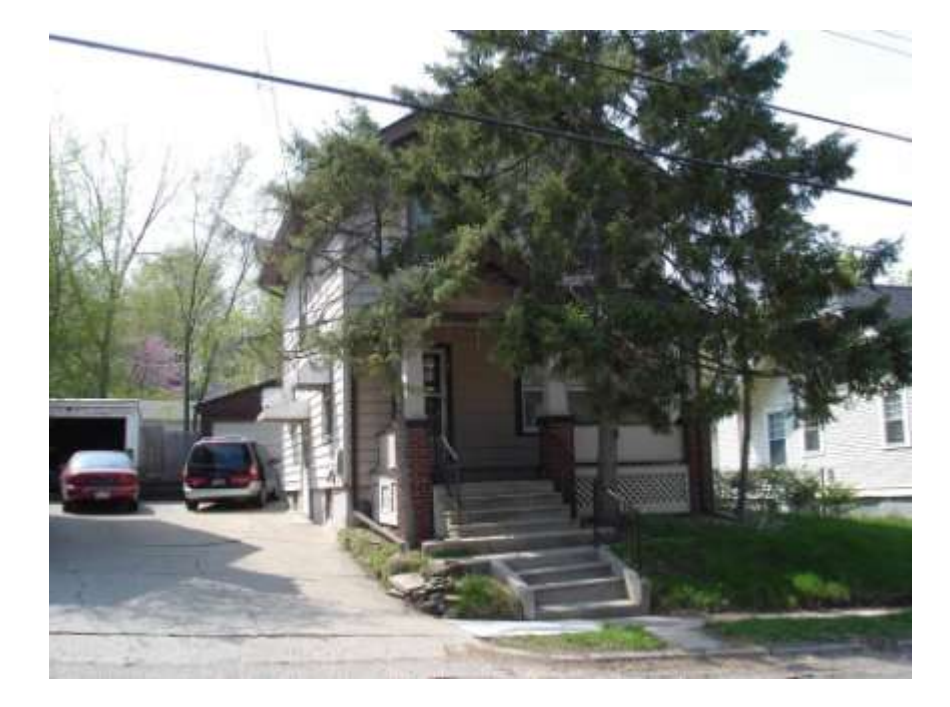
PHOTO INFO File name First_804.JPG Date April-May, 2008