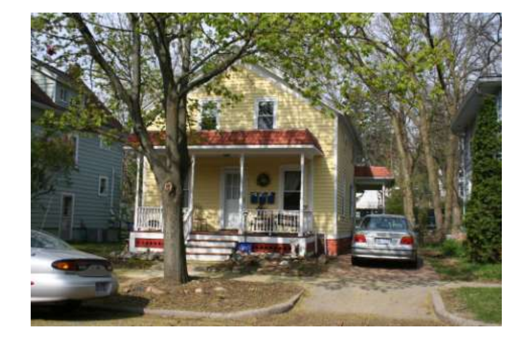
PHOTO INFO File name Fifth_400_1.JPG Date April-May, 2008