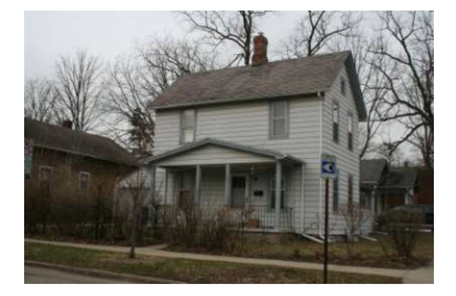
PHOTO INFO File name Fourth_502_2.JPG Date April-May, 2008