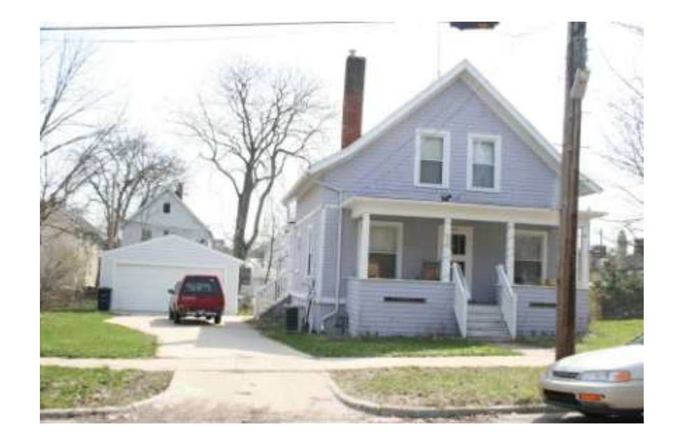
PHOTO INFO File name First_625.JPG Date April-May, 2008