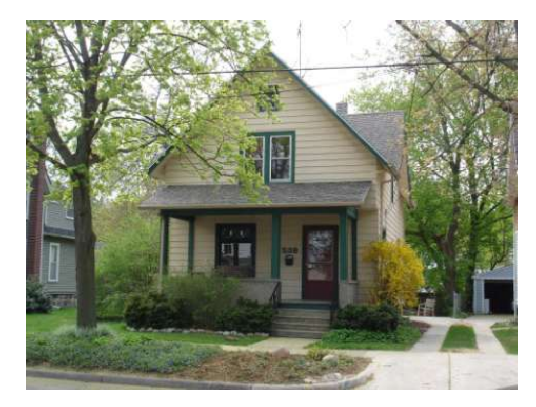
PHOTO INFO File name First_538_2.JPG Date April-May, 2008