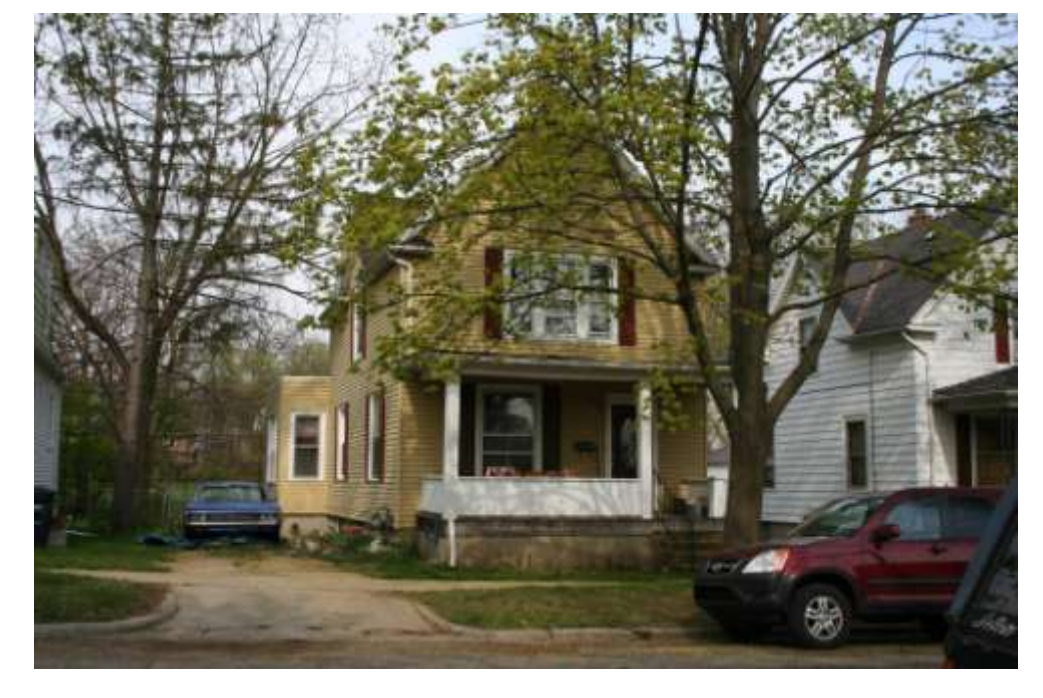
PHOTO INFO File name Fifth_414_2.JPG Date April-May, 2008