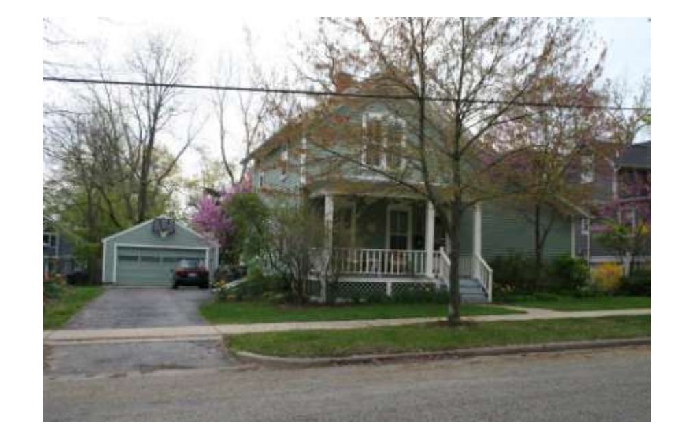
PHOTO INFO File name Fifth_539_2.JPG Date April-May, 2008