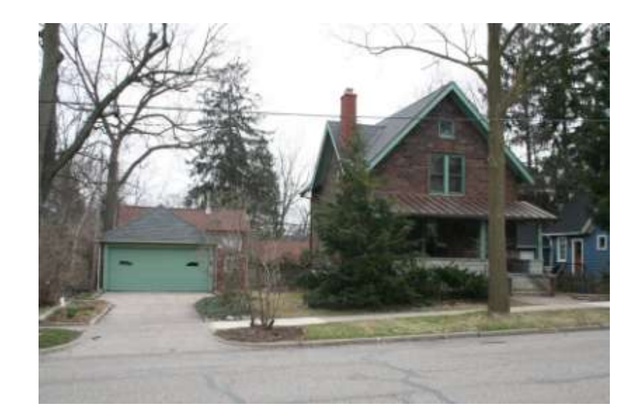
PHOTO INFO File name Fourth_549.JPG Date April-May, 2008