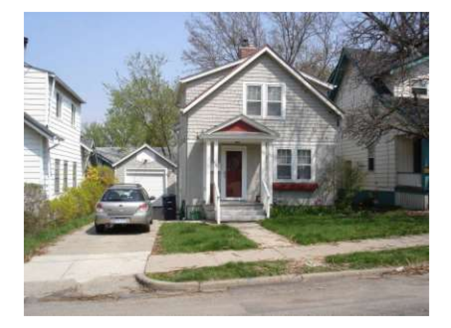
PHOTO INFO File name First_803.JPG Date April-May, 2008