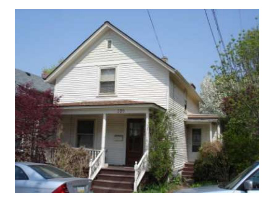
PHOTO INFO File name First_709.JPG Date April-May, 2008