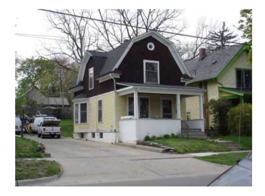
PHOTO INFO File name First_410.JPG Date April-May, 2008