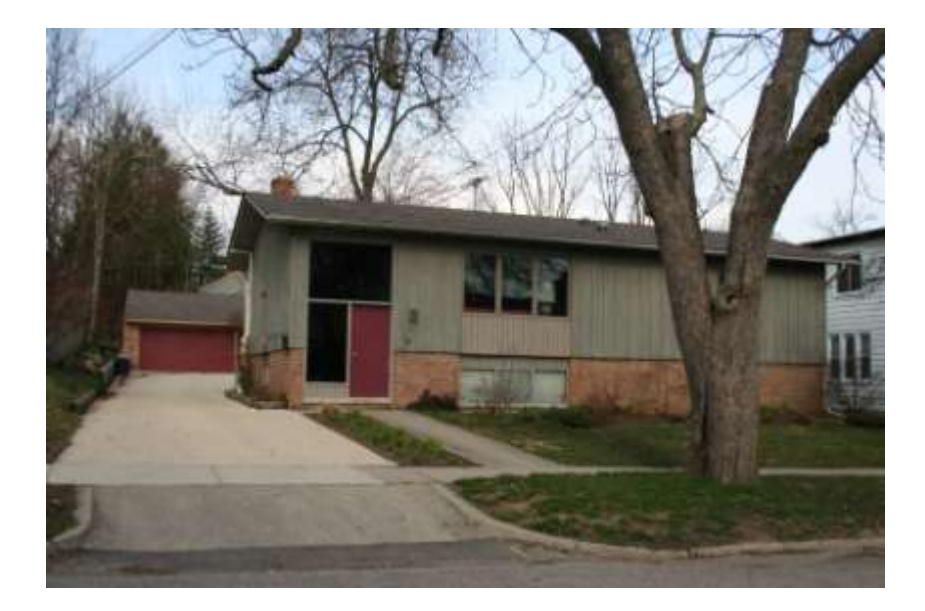
PHOTO INFO File name First_606-8_2.JPG Date April-May, 2008