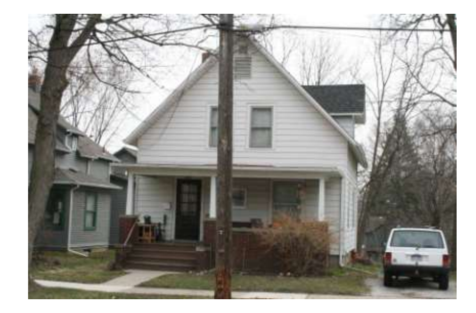
PHOTO INFO File name Fourth_543_2.JPG Date April-May, 2008