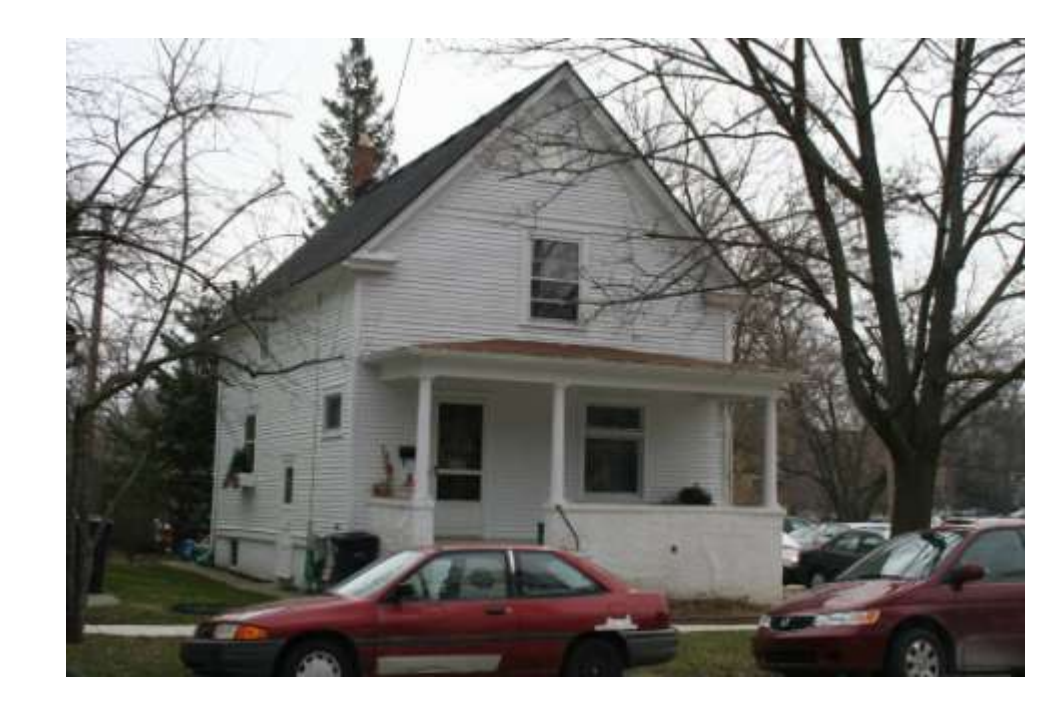
PHOTO INFO File name Fourth_311.JPG Photographer K. Kidorf Date April-May, 2008