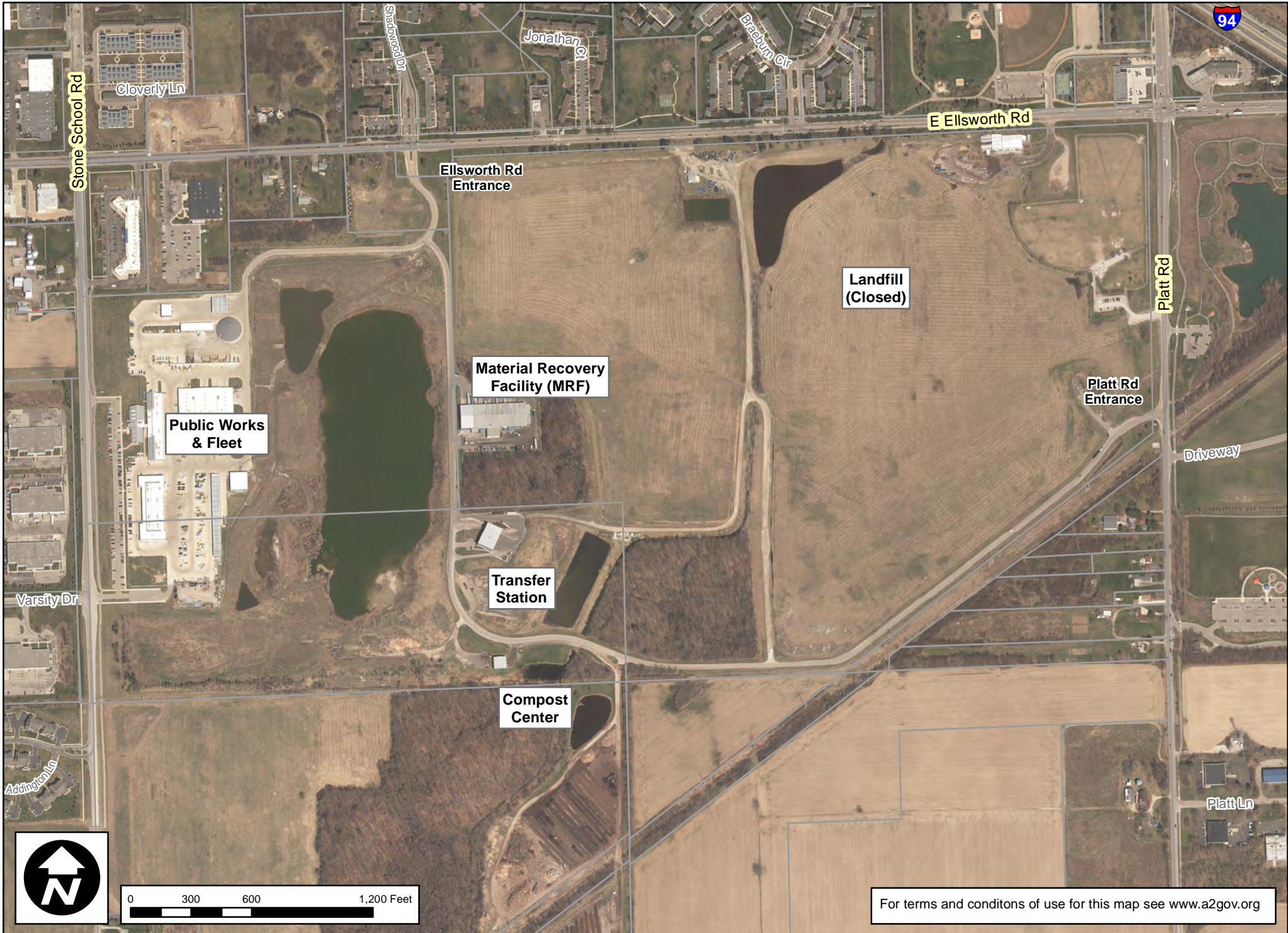
Figure 1 - Wheeler Operations Center