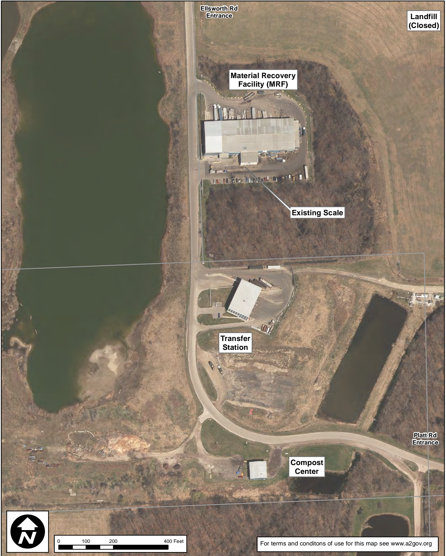
Figure 4 - Solid Waste Facilities