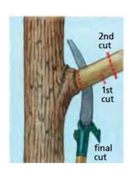
Figure B