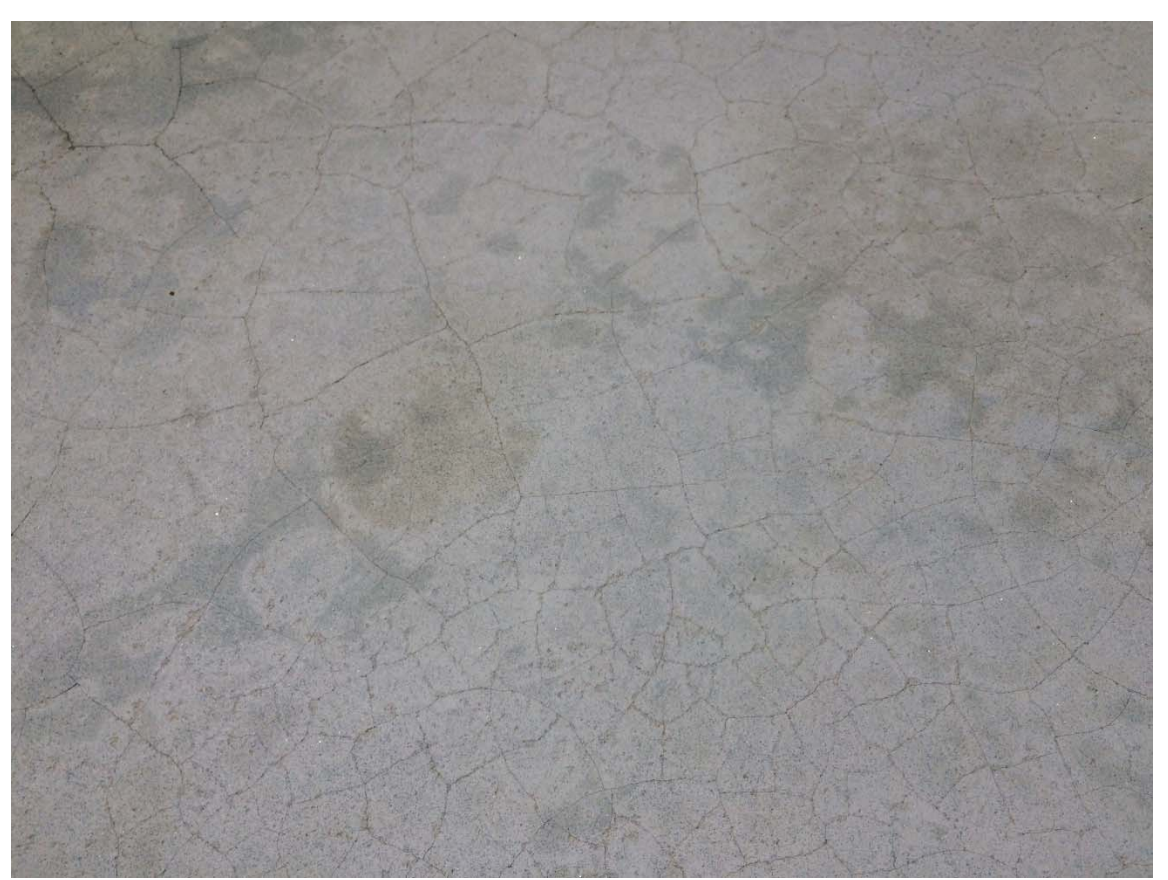
Delaminating Marcite in wading pool