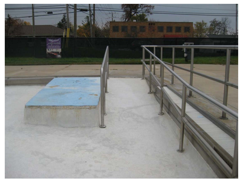
Ramp entering wading pool