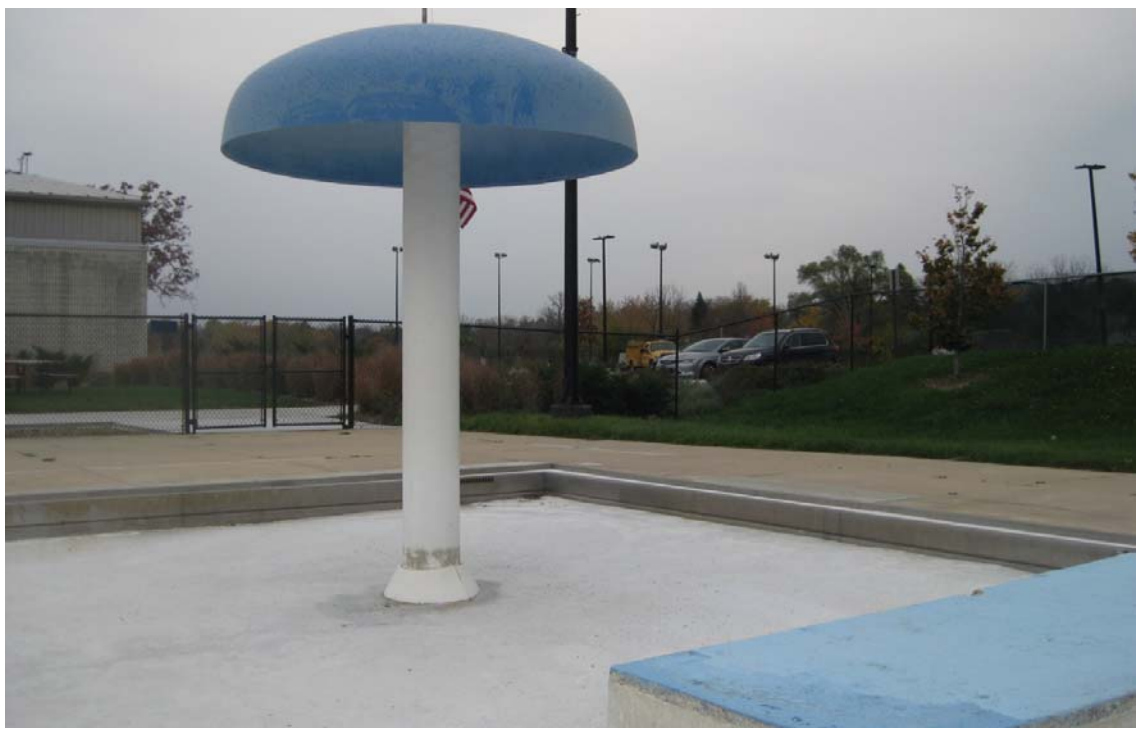
Water feature in wading pool