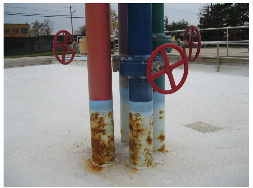
Base condition of water feature in wading pool