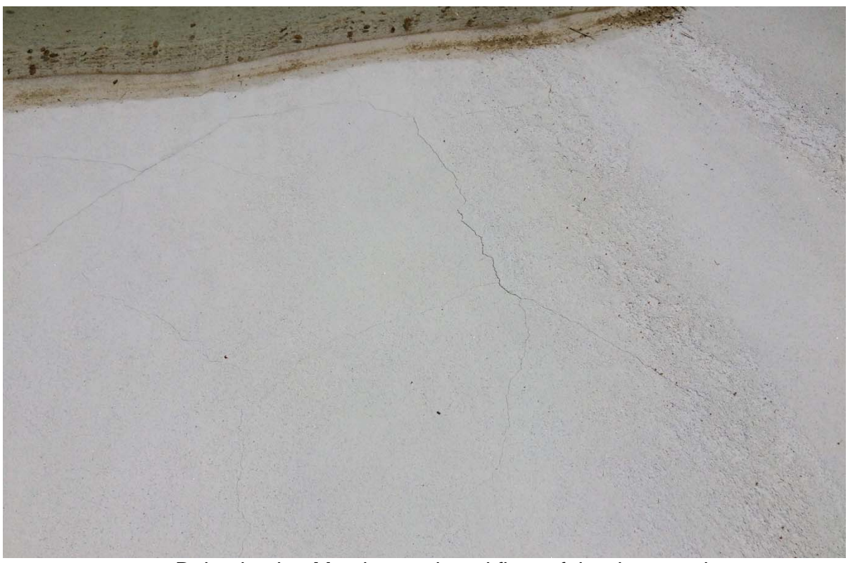
Delaminating Marcite on sloped floor of the deep pool