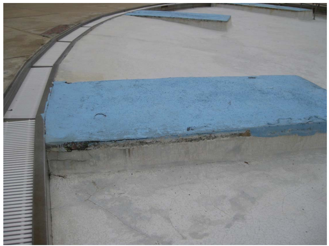
Concrete pads in wading pool