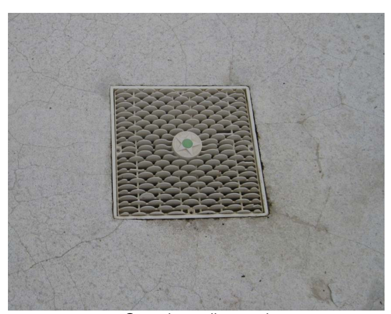
Grate in wading pool