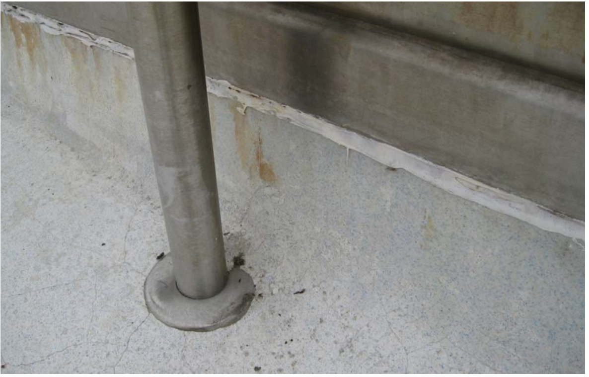
Install base cones on handrail system