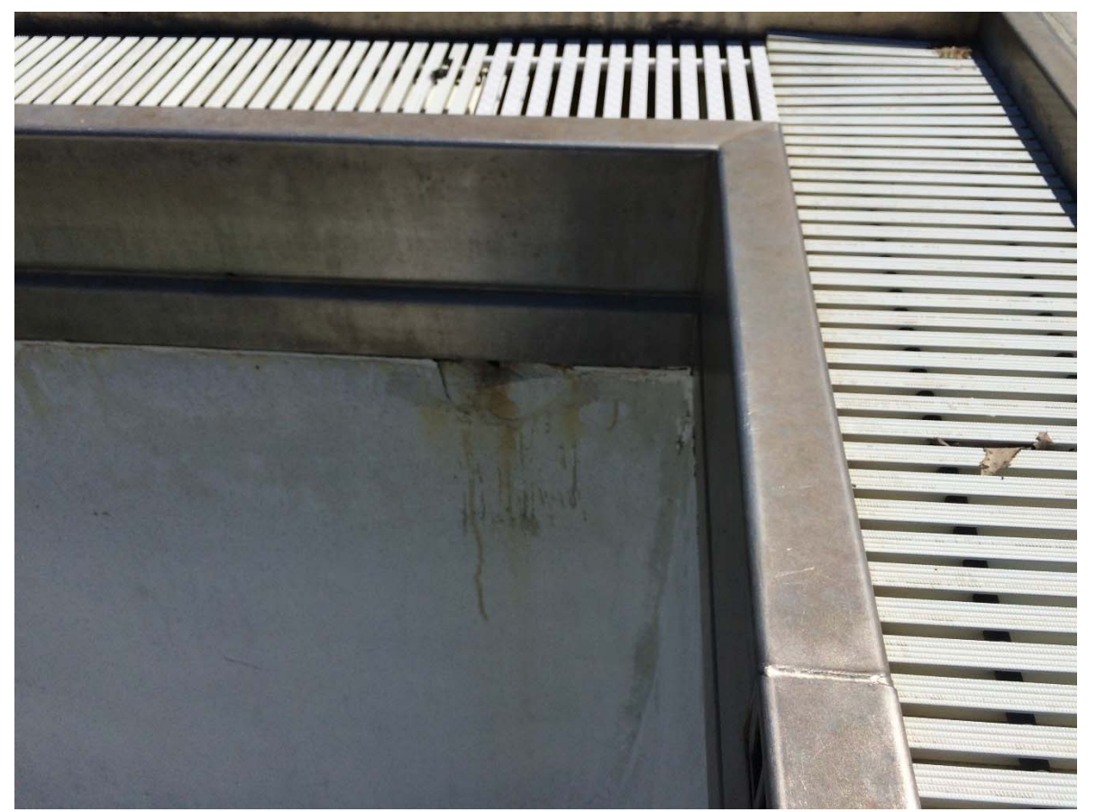
Spalling concrete beneath stainless steel gutter SW corner of deep pool