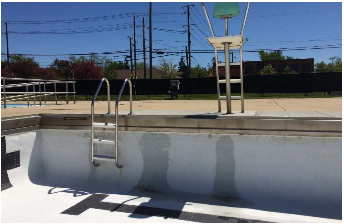
Leaking stainless steel gutter south wall east of deep pool