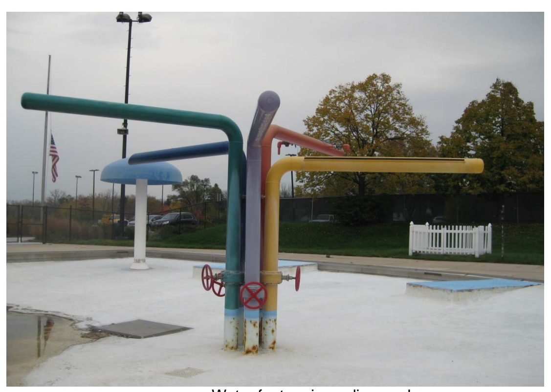
Water feature in wading pool