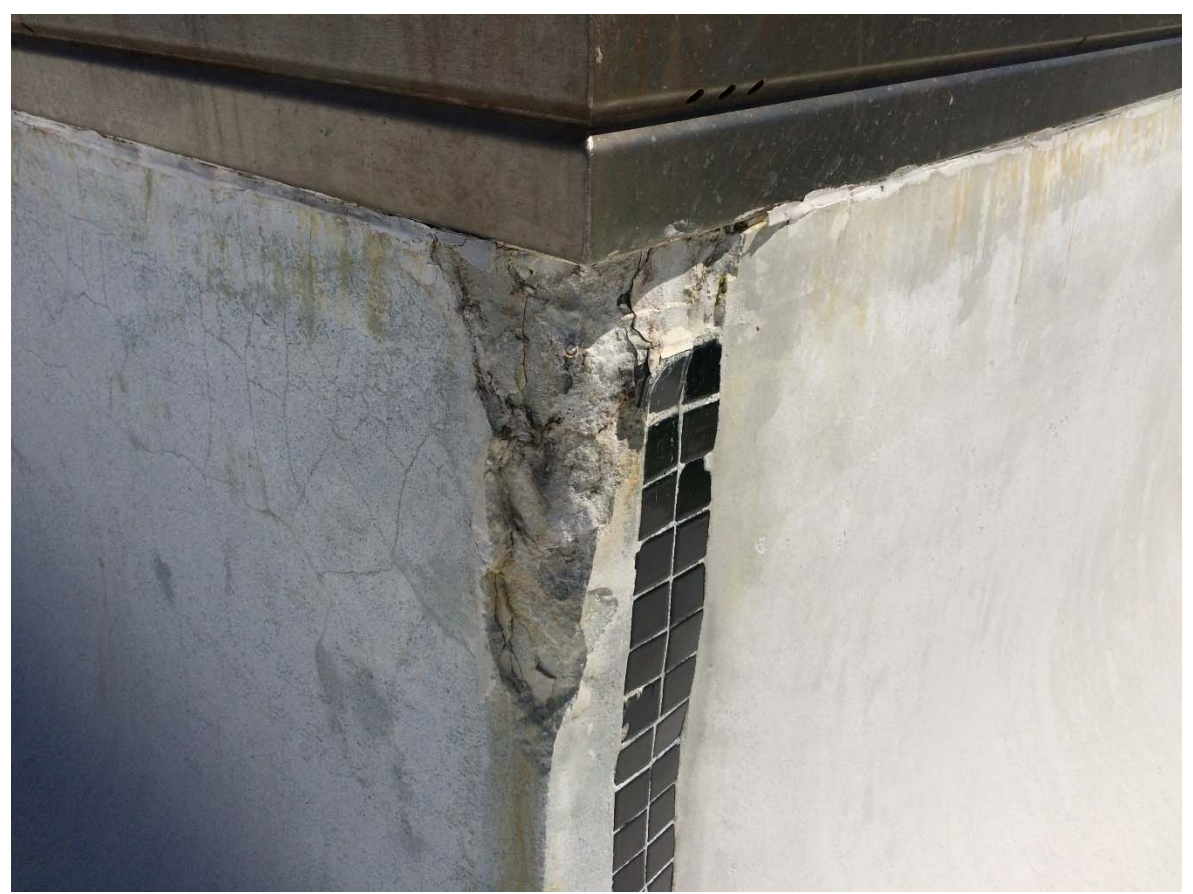
Spalling concrete on NE corner of deep pool