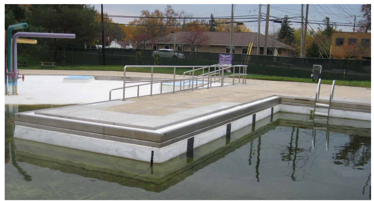
Area between wading pool and lap pool