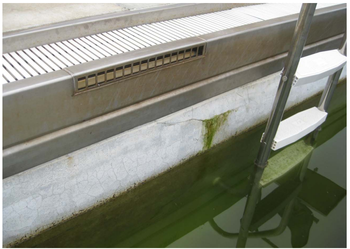
Condition of Marcite in deep pool