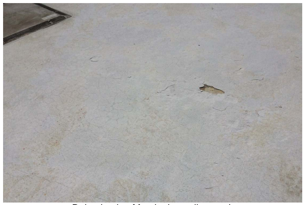
Delaminating Marcite in wading pool