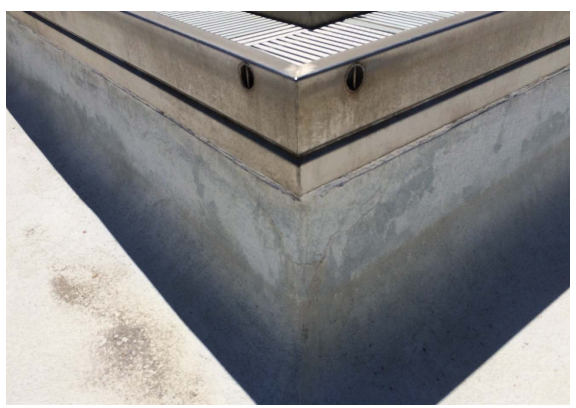
Delaminating Marcite in NW corner of wading pool