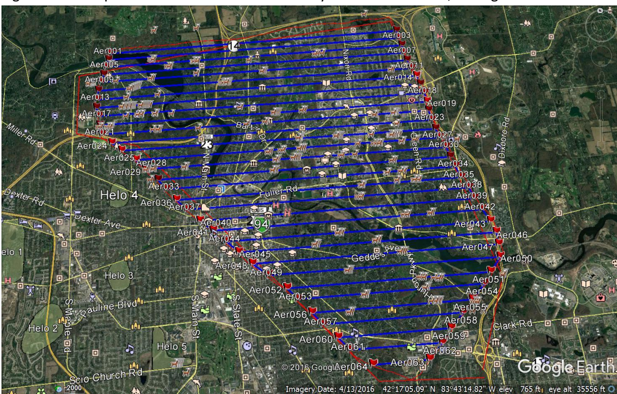
Figure 2. Helicopter transects flown on 1 February 2017 in Ann Arbor, Michigan.

The survey of the study area was flown in two legs separated by refueling. The first session was conducted starting at \sim 0930 h and there was still snow suspended in the vegetation (transects Aer001 – Aer025). During the second flight much of the snow had dissipated from the vegetation, increasing the detection rate (transects Aer025 – Aer063).