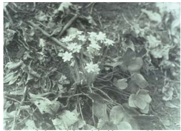
Historical photo of sharp-lobed hepatica. Photo circa 1930.

To address these problems the Natural Area Preservation Division (NAP) of the City of Ann Arbor Department of Parks and Recreation has begun invasive species removal, native tree planting, prescribed ecological burning, and erosion control. The latter includes installing water bars (logs that divert water from steep trails). For details on controlled burning see the fact sheet "Prescribed Ecological Burns" available from NAP. See the "Park Neighbors and Yard Waste" fact sheet regarding yard waste dumping, also available from NAP.