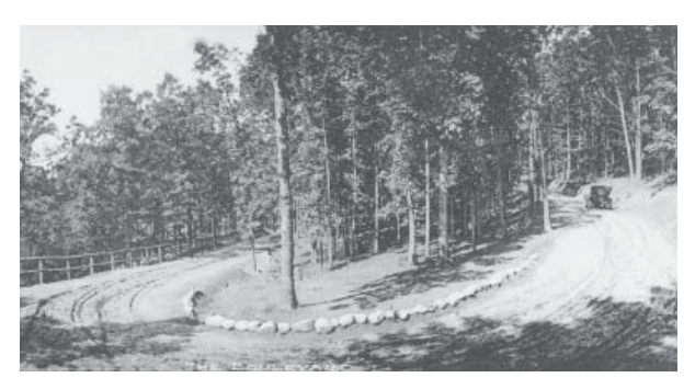
Hairpin turn on the road through Cedar Bend Nature Area designed in 1905. Photo from a 1910 postcard.

A Piece of Ann Arbor's Natural and Human History