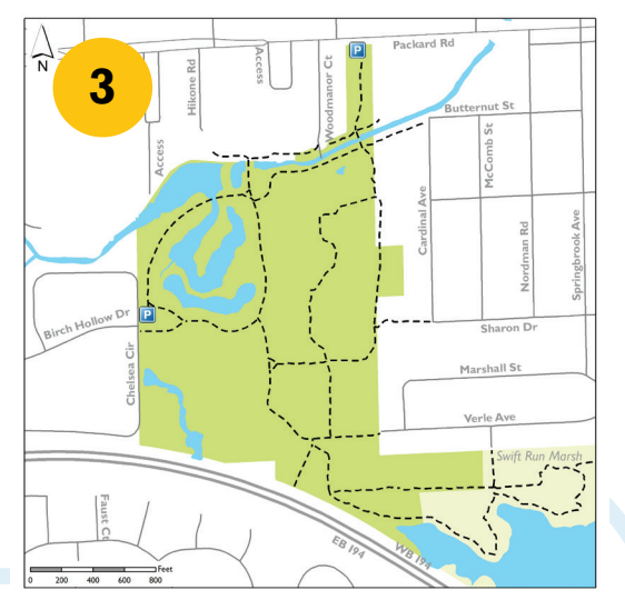
Located at 3500 Birch Hollow Drive