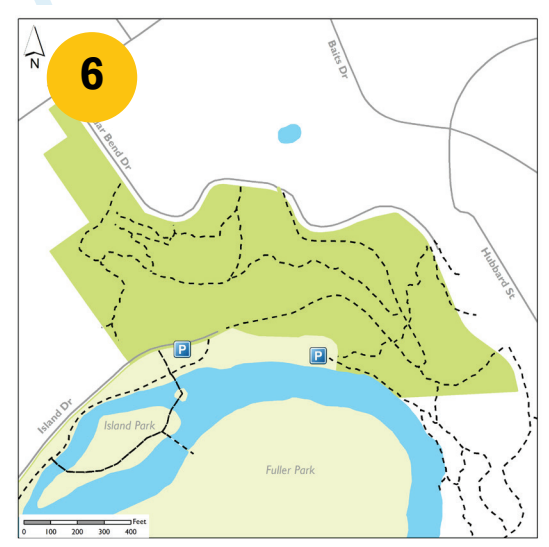
Located at 1495 Cedar Bend Road.