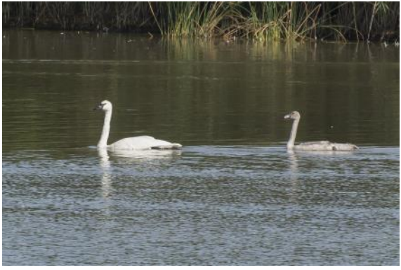
Trumpeter Swans, Cygnus buccinator

one another, USDA-NRCS PLANTS Date especially in the evening hours. During the day, Red-winged bla