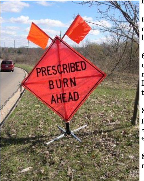
The signs placed by NAP staff before a burn can begin

few copies of the site map, grab flagging, marker, and some more flagging.