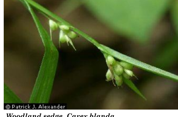
Woodland sedge, Carex blanda

One of the most delightful activities to do within Furstenberg is to watch wildlife. The system of trails winding through the park hold benches and viewing points to catch a glimpse of some of the interesting species that establish themselves in the spring. The swaying cattails of Furstenberg's marsh offer a chorus of animal vocalizations. Gray tree frogs, Green frogs and Wood frogs call to