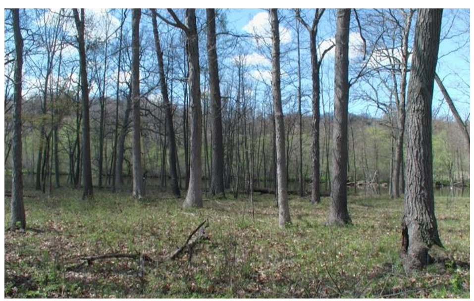
The oak savanna at Furstenberg Nature Area

The land that is now Furstenberg Nature Area was acquired in 1971 by the City of Ann Arbor. It was not until the 1990s, however, that major ecological and aesthetic improvements began. The boardwalk and bridge connecting Gallup and Furstenberg gave greater access to the park. Fire management and invasive shrub removal improved the area's ecological quality and biodiversity. Today, one can see the changes by strolling through or paddling by the marvelous 38 acres.