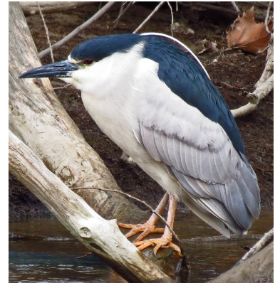
A Black-crowned Night Heron in Argo Nature Area.