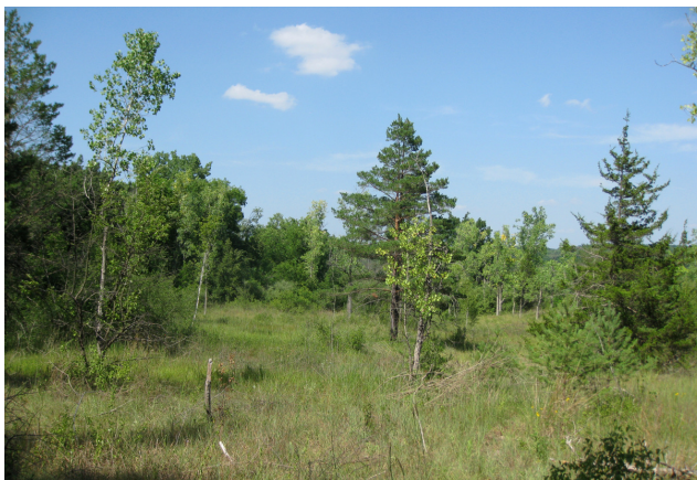
The prairie at Bluffs Nature Area is just one of the plant communities which will be easier to access with the soon to be developed entrances on Sunset and Huronview.

A small prairie, one of the more notable plant communities, has sprouted on an exposed gravelly slope that once served as a staging area when nearby M