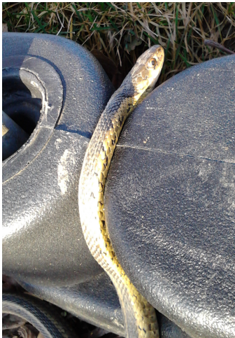
A harmless Garter Snake at Ward Park playground this past March.

When you go out into nature, you never know what you will see. Some NAP volunteers actively survey for the animals that call our parks “home,” and some just happen to have the opportunity to observe them when they visit or participate in other activities. That was the case for volunteers at Garlic Mustard Weed-Out Day in May, who saw a female wild turkey on nest in Cedar Bend Nature Area. The observation was even more special because this particular turkey had a rare mottled white/grey coloration pattern (the biological term is “leucistic,” in which pigment is lacking in certain body cells). The excitement of this find had only begun to wear off when volunteers from the U-M law school a month later spotted another female turkey (with the normal color pattern) in the same park!