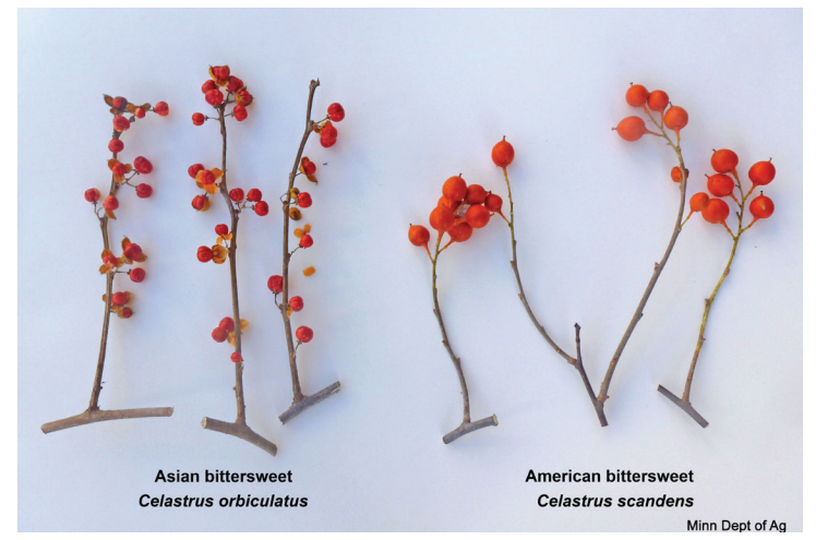
Monika Chandler with the Minnesota Department of Agriculture

Oriental (Asian) bittersweet threatens Michigan's native plant community with its sprawling growth, outcompeting native plants of vital nutrients and sunlight. Due to its aggressive nature, it easily smothers ground vegetation and twines around trees so tightly that it eventually girdles them. Even more, the tangled mess of vines taking over its host's canopy creates extra weight on the tree, adding additional stress to the branches. From