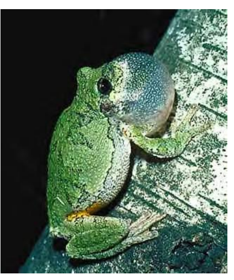
Gray Treefrog Calling

The timing of frog calling depends on the weather and on the species. Some species call very early in the spring even while there is still some ice on the ponds. Some call later in the spring and a few are still calling in early summer. All frogs call mainly at night, so they can't be seen by predators, and will call most strongly when it is relatively warm and the air is damp. In some species, Wood Frogs for example, all the calling and egg-laying happens in a very short period of time, just 2 or 3 nights at any one pond. In other species, like Spring Peepers, American Toads, and Green Frogs, males may call for several weeks. The first frogs to call, starting as early as mid-March, are Wood Frogs, Spring Peepers, and Chorus Frogs. All 3 use very temporary pools that dry up in late summer, and they lay eggs as soon as they can. Later in the spring, from mid April through May, American Toads, Gray Treefrogs, and Leopard Frogs are calling. They use temporary pools too, but also breed at the edges of permanent waters, if there is enough vegetation for their tadpoles to hide in. Finally in mid-to-late-May, Green Frogs and Bullfrogs start to call, and they may carry on into July. They need permanent waters with lots of vegetation, because their big tadpoles need more than one summer to finish growing.