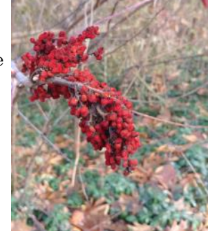
Sumac and Vinca

Join us on the fourth Thursday of each month, April through September, for Nature Walks with Natural Area Preservation and the Ann Arbor District Library. Some of AADL's science tools will be available! Check our website for locations. NAP@a2gov.org/NAPevents