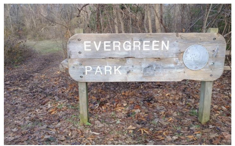
Sign at Evergreen Park

In the original plans for the neighborhood, the north-south street called Parkwood veered south and connected to Valley Drive. Additionally, Kingwood Street connected through to Pinewood Street, completing the grid pattern of the neighborhood. Houses were built along Parkwood, lining both