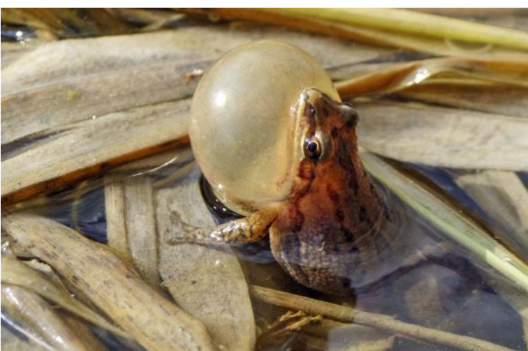
Chorus Frog Calling

Frogs call for one main reason: to attract a mate. In the species found here, males do nearly all the calling. They gather in ponds and pools, or along the river, trying to be chosen by a female. Each species has a unique "advertisement call" that males make to attract females and show off their qualities as potential mates. Males listen to each other, adjusting their timing and assessing the competition. They sometimes push and shove for the best calling spots, but a