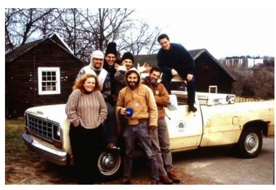
NAP's first staff members.