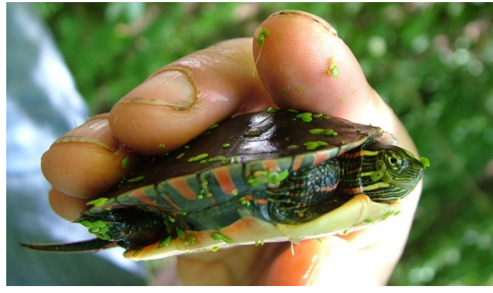
A painted turtle found by a NAP volunteer.