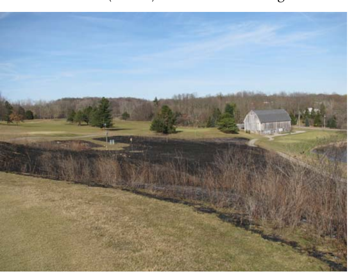
Leslie Park Golf Course following a controlled burn.

amazing potential for connecting these woodland habitats through existing or potential corridors in the course. These corridors can provide transitional habitat and allow for the exchange of genetic information between currently isolated populations of amphibians and butterflies. The main challenge to the ecological potential of this area is that the core remaining oakhickory woodlands and wet meadows are currently separated from each other by low diversity shrublands and old fields, lawns, roads and urban structures.