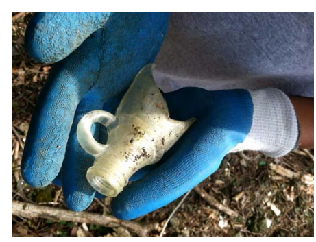
A piece of an antique bottle discovered at the archaeological dig.

Excitement is high for some sixthgraders at Scarlett Middle School who are getting a chance to be archaeologists and environmental stewards at the same time thanks to the discovery of an old farm dump deep in the Scarlett Mitchell