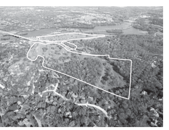
Aerial view of Huron Hills Golf Course (outlined in white) and Woods, with Huron River in background

This 23-acre preserve at Huron Hills Golf Course consists of two oak-hickory woodlands. The woods and adjoining golf course were acquired by the city from the University of Michigan in 1951. Although the land had been used as a private golf course since 1922, several years had passed without proper maintenance. During the early 1950s, additional parcels were purchased from private landowners. Shortly thereafter, construction of additional holes and cleanup of existing greens began. Huron Hills Golf Course was opened for play in July 1955. NAP began managing the woods in 2002, mainly through prescribed ecological burns and invasive species removal.