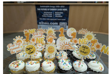
The A2SEU turned 1 on April 27!