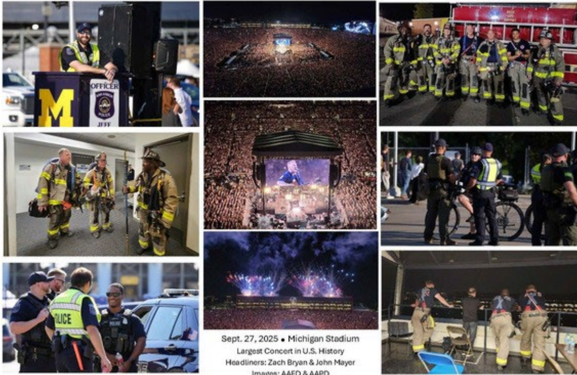
Sept. 27, 2025 • Michigan Stadium Largest Concert in U.S. History Headliners: Zach Bryan & John Mayer

Ann Arbor signage has recently been updated to include newest Sister City, Lubny, Ukraine. Signs are located on State Street north of Ellsworth, Plymouth Road west of US-23 and Platt Road north of I-94.