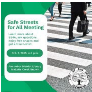
Photo credit: Quinn Evans Architects and Photographer James Haefner

Do you want to learn more and stay informed about the SEU? Stay in the loop by subscribing to regular updates right to your inbox!