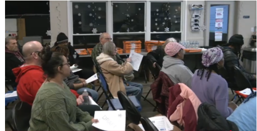
Bryant pilot kickoff meeting

The SEU is preparing to install and provide our very first pilot solar + storage services in the Bryant neighborhood this spring . We held a kickoff informational meeting with Bryant residents on March 6 th . Anyone interested is invited to watch the full meeting recording or a short highlight reel that includes some resident perspectives!