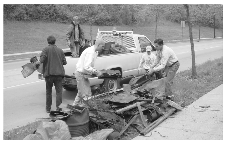
Workday volunteers hauling trash from newly acquired Dicken Woods.

In the past couple years I have gone through great pains to puree volunteer related data and I have communed with The Great Volunteer Database – all in an attempt to dazzle and amaze you with the ever-increasing throng of NAP volunteers. Well, I'm done with it – that circus ringleader position isn't for me!