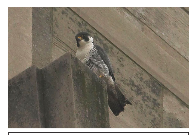
Peregrine on the Burton Bell Tower

*A group of turkeys is called a "rafter."