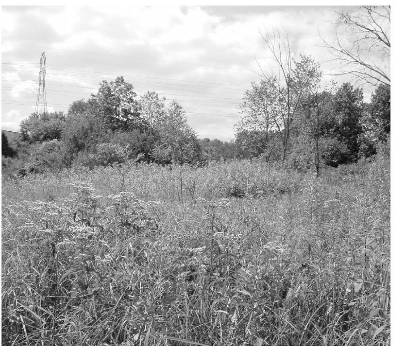
Foxfire West Nature Area: Photopoint 6, August 30, 2004

If you'd like to help Maggie with NAP's photo documentation, contact our office.