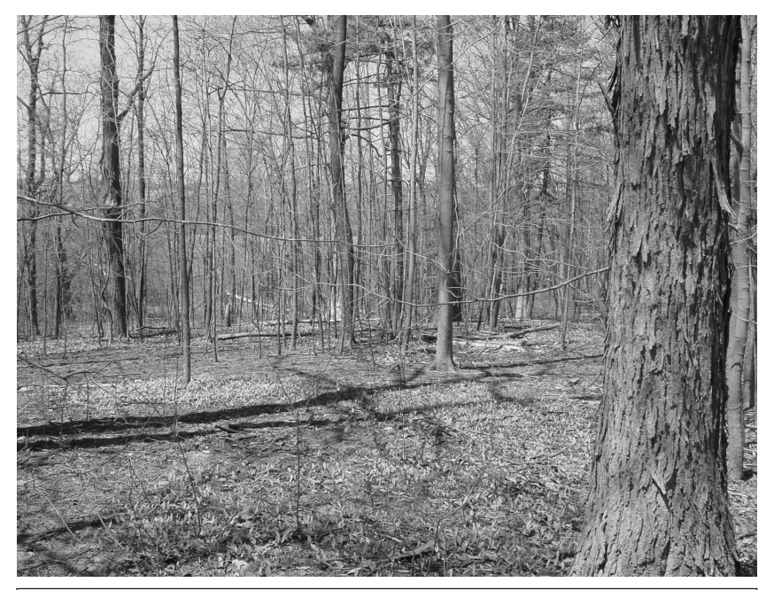
Hansen Nature Area: Photopoint 4, April 29, 2003

It is a typical photopoint day in May and I am heading to Hansen Nature Area, a ten-acre woods off of South Maple Road, to take the spring photos. With map in hand, my work is a little like a treasure hunt. I must find the exact spots in Hansen where photos have been