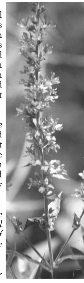
Lythrum salicaria, purple loosestrife

Invasive Plants of the Upper Midwest is available from University of Wisconsin Press: www.wisc.edu/wisconsinpress/books/3601.htm