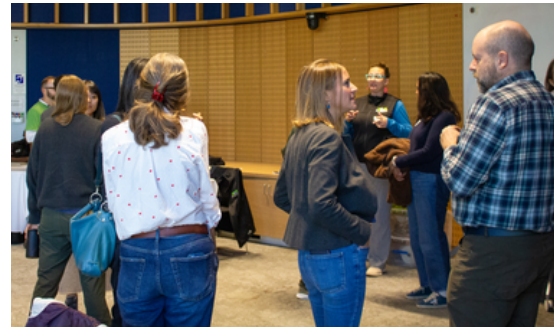
Chatting with A2Zero Ambassadors