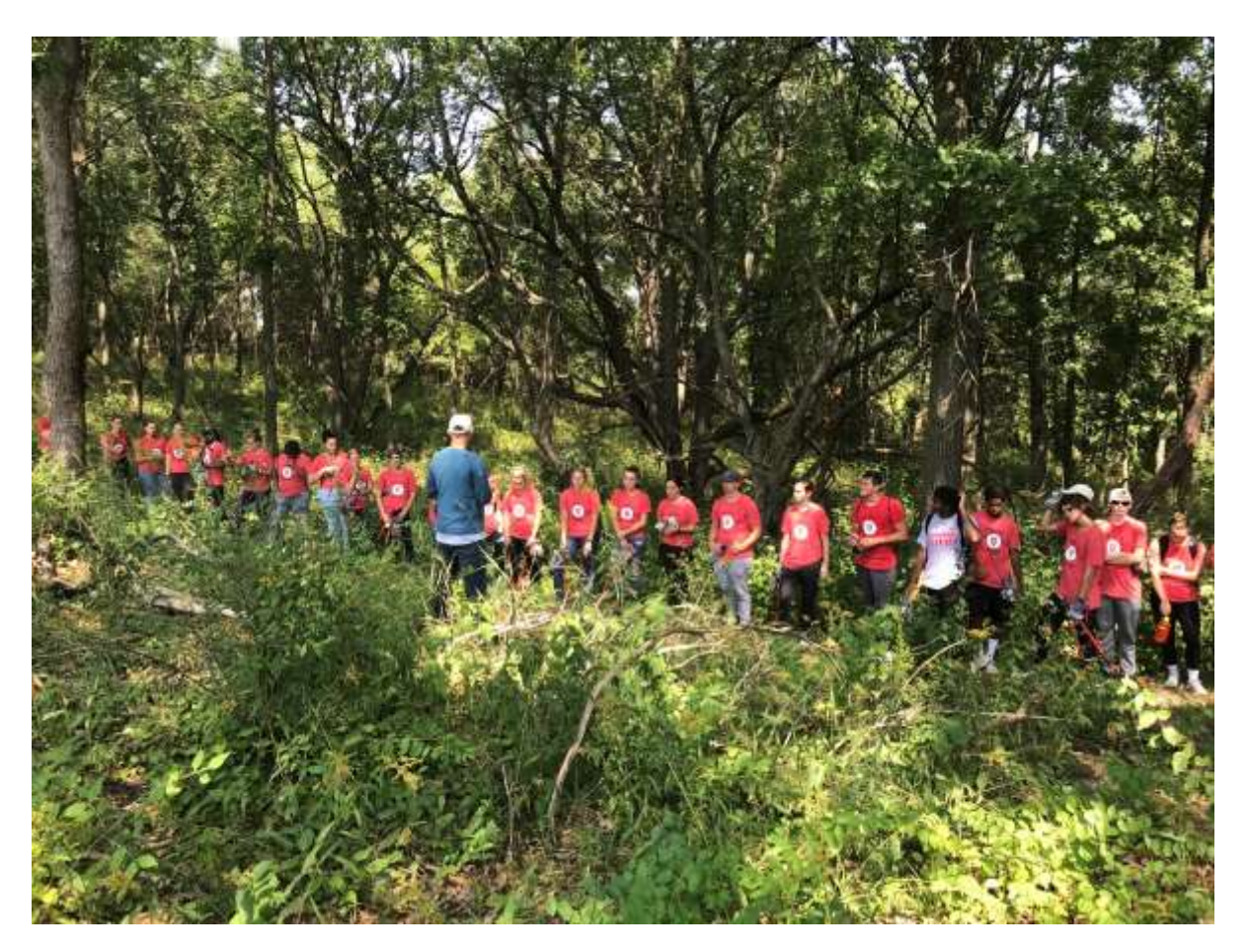
Students from Concordia University receiving instruction at Ruthven Nature Area in August.