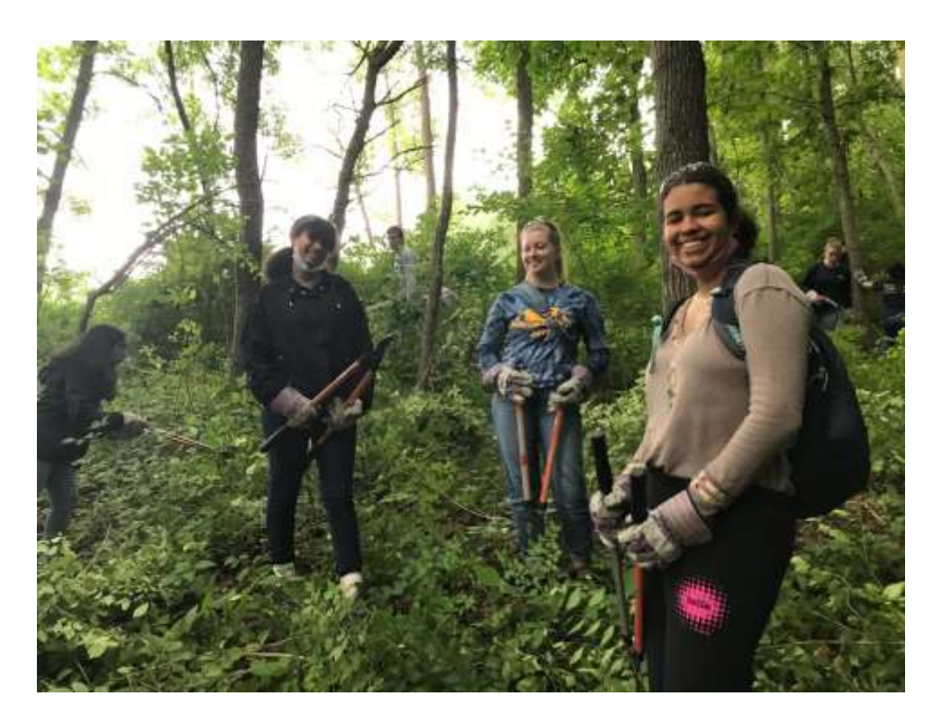
Michigan Community Scholars work in Bluffs Nature Area in August.