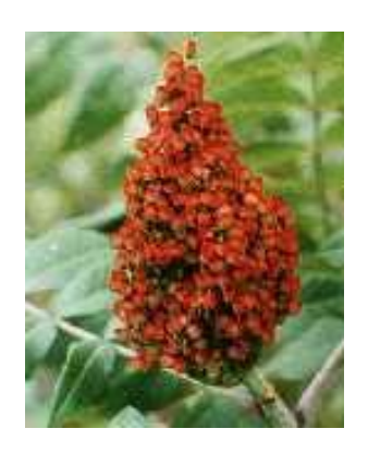
smooth sumac fruit

Other members of the Rhus genus include poison sumac (R. vernix) and poison ivy (R. radicans). Poison ivy has only three leaflets, making it unmistakable from sumac. Poison sumac looks very similar to smooth and staghorn sumac but grows in wet areas, while staghorn and smooth sumac prefer drier sights. All three sumacs are found in open, sunny spots or on the edges of wooded areas. Both poison sumac and poison ivy also have white fruit, not red, so there's no danger of accidentally making poisonous sumac beverages.