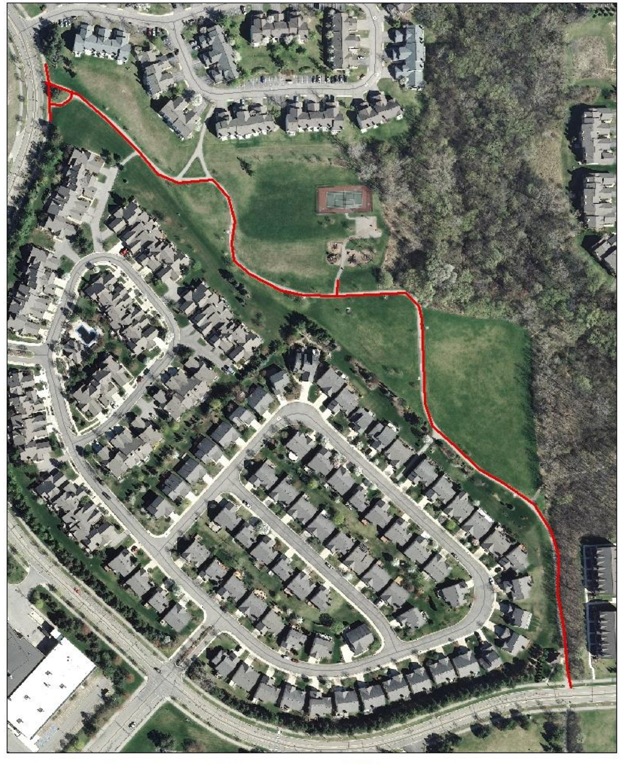
Cranbrook Park Path Paving

O 70 140 280 Feet Area to be repayed ________