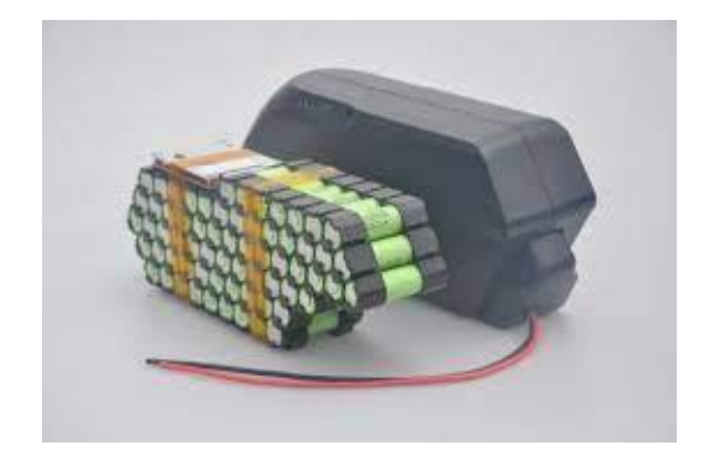
Figure 4A Figure 4B

Battery packs may be permanently installed or removable from the mobility device. They are located externally on the frame, floorboard (Figure 5A and 5B) or rear rack of the mobility device but can be found internally on some devices. An internal mount is common when the mobility device is foldable (Figure 6). The mobility device in the closed (folded) position may give direct access to the lithium-ion battery pack.