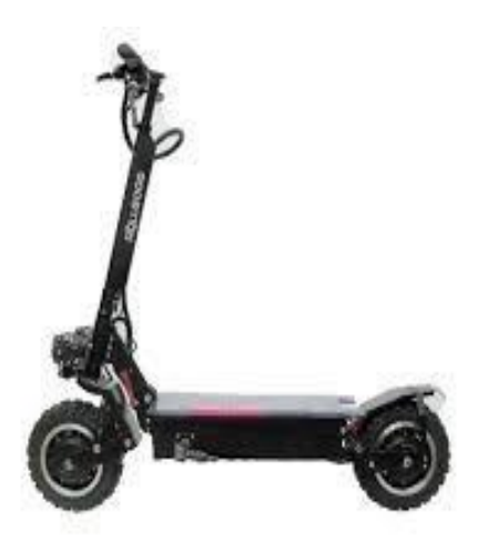
Figure 2A Figure 2B