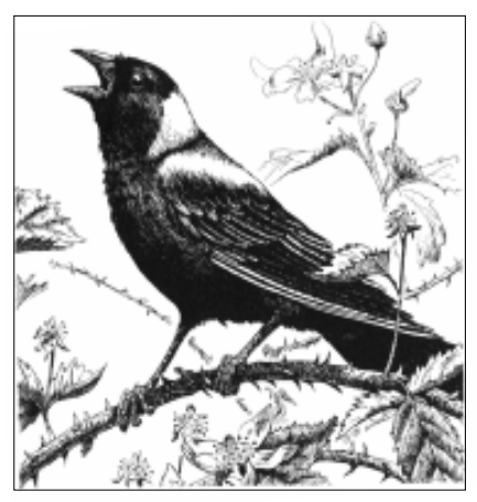
Bobolink from The Atlas of Breeding Birds of Michigan