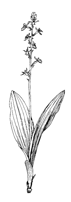
orchid fen twayblade from Michigan Wildflowers

This season I've also had good success locating and collecting specimens to document the rarer plant species already known in NAP's plant inventory. Hopefully, our preservation efforts will enable us to pass on living organisms to the next generation, not just dead, dried specimens that are now the only evidence of some of the former flora of Ann Arbor. Having high quality natural areas is essential to maintain Ann Arbor's botanical diversity for those in the future to enjoy.