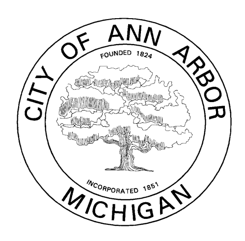
RFP # 907 Due Tuesday, July 22, 2014 at 10:00 AM

City of Ann Arbor Community Services Area Parks and Recreation Services 301 East Huron St Ann Arbor, Michigan 48104