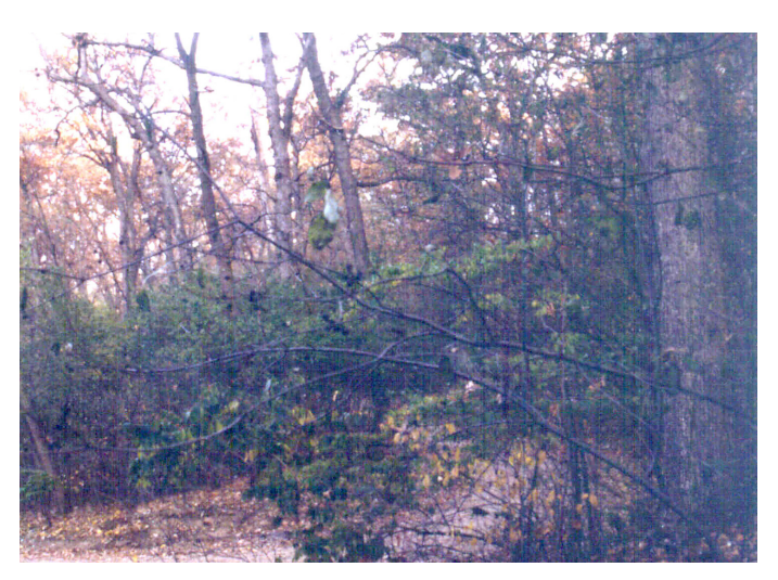
1997 with a thick layer of invasive shrubs.