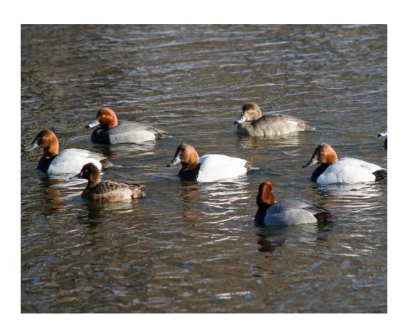
This mixed flock of redhead and canvasback ducks was seen in the Huron River near Barton Nature Area.