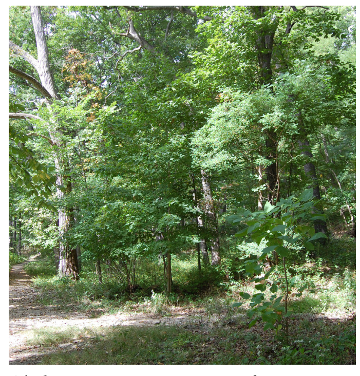
The hairpin turn in 2015 - return of an open native woodland.