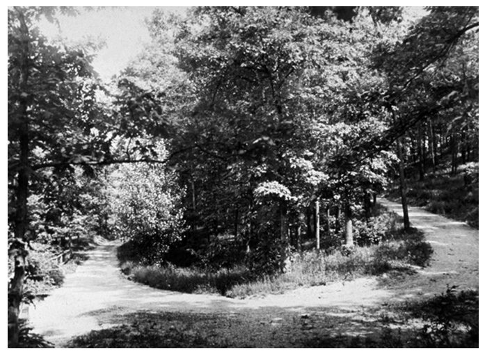
Changing views of the hairpin turn, first circa 1920.

One particularly unique feature of Cedar Bend is the so-called "hairpin turn" that can be found on the southeast side of the park. The sharp turn in this former road reflects a similar pattern made by the Huron River as it cuts back to the south, winding gracefully along the landscape. The continuity of these two features make for a unified aesthetic in this beautiful nature area, and with help from our amazing volunteers, native biodiversity at Cedar Bend will continue to thrive, providing an enchanting place for Ann Arbor's citizens to explore year-round.