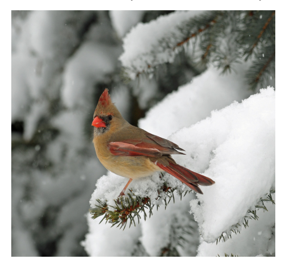
Cardinals (like this female) are common winter residents