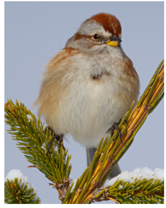
American Tree Sparrow in winter

Whether you are interested in songbirds, woodpeckers, or waterfowl, Ann Arbor's parks have something for you to enjoy in the winter. Don't forget that our parks are great places to bird any season of the year!