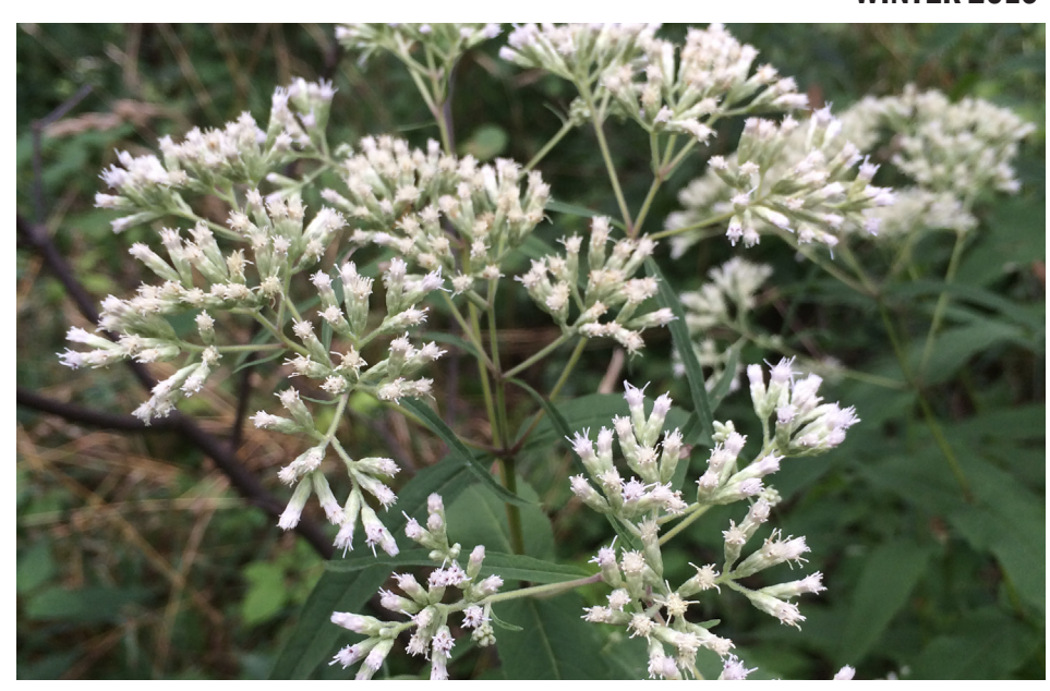
Upland boneset (Eupatorium sessifolium) is a rare wildflower in Michigan, listed by the state as Threatened. It is only found in oak openings and oak savannas. These open oak woodlands were once common across southern Michigan but are now almost completely wiped out. The upland boneset in Cedar Bend grew after invasive shrubs were removed and controlled burns were used to help restore habitat in the park.

Through the years, the landscape of Cedar Bend has changed. The view of the Huron River has evolved, as shrubs, young trees, and native wildflowers have established and spread. However, the timeless feel of this nature area remains. Wander down the winding trails on a quiet morning and find yourself in a towering stand of hickory and oak. Elegant branches arch ever upward, hosting songbirds and squirrels in their branches. In the cold, still grip of winter, delicate petals of spring wildflowers are gone, and no leaves remain to filter light through the