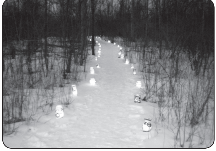
Path of luminaries.

Students of Dicken Elementary made luminaries in their art classes. This year's design had multi-colored intricate geometric designs cut into small squares of colored paper affixed to glass containers. The candle-lit luminaries followed