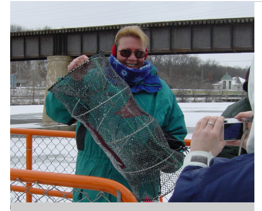
A Salamander Survey volunteer holding a funnel trap.