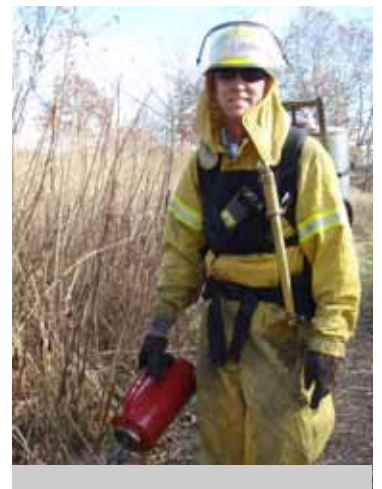
Drano at a prescribed burn.

A ALL STREET AND A STREET NTEERING WITH NAP