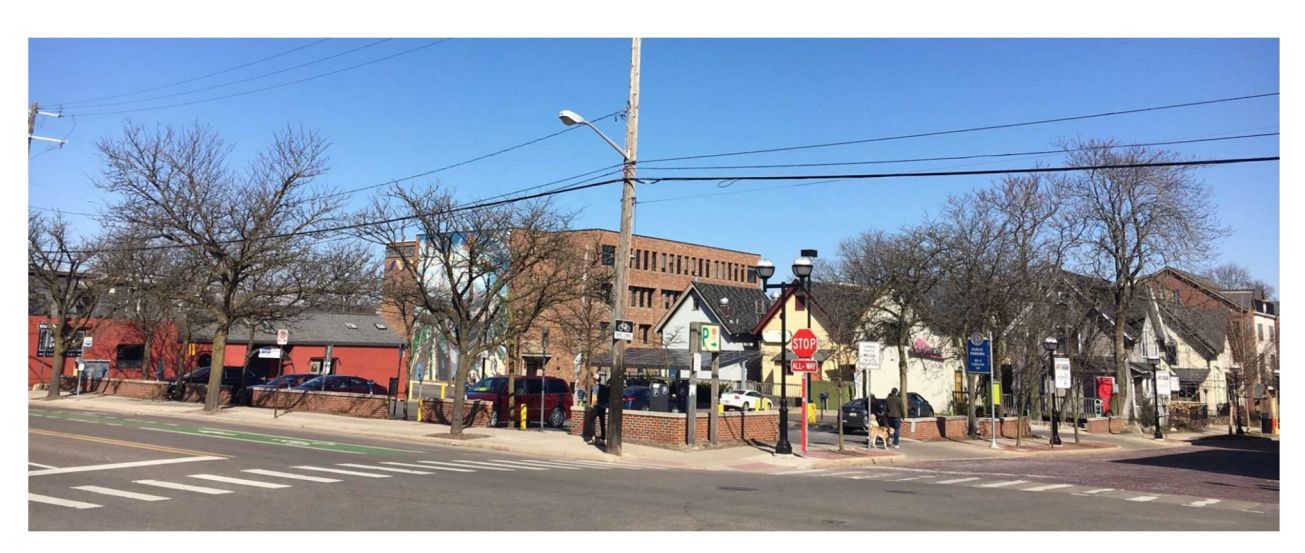
Fourth & Catherine Parking Lot

Today 121 E Catherine Street hosts approximately 50 surface parking spaces managed by the DDA as the Fourth & Catherine Parking Lot - a paid lot serving neighborhood businesses. The Site is also used seasonally for public events. Additional public parking is provided on-street and in the Ann Ashley Structure two blocks to the west. There are approximately 5,250 off-street and 600 on-street parking spaces within a 1/4 mile of the Site.