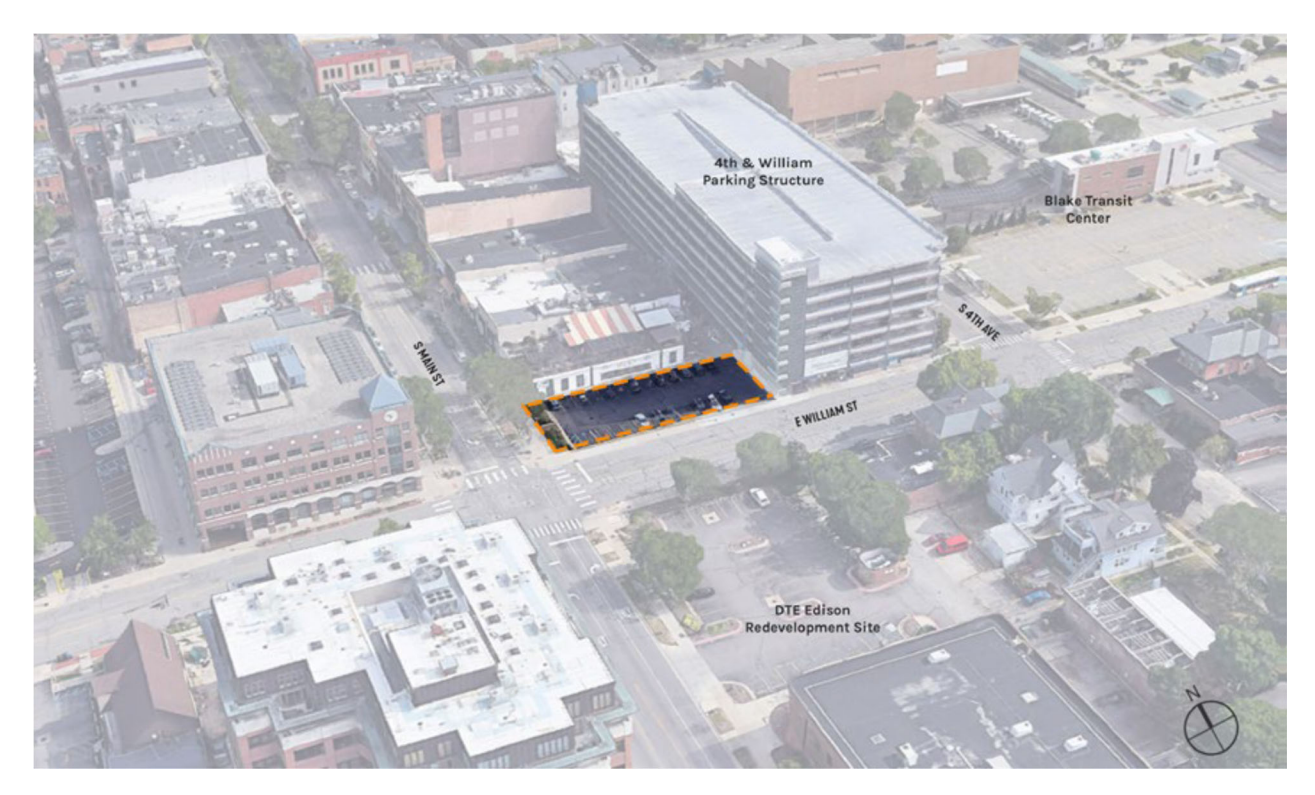
Aerial context map

353 S Main is approximately 7,000 square feet, located on the northeast corner of Main and William. Key adjacent uses include Main Street and Liberty Street businesses and the William Street bike lane. As of September 2020, demolition started on the DTE Edison building immediately south of the site to develop a luxury apartment building marketed to students. The proposed development for 353 S. Main includes a 6-10-story building.