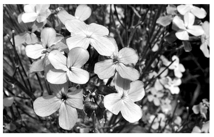
Dame's rocket, Hesperis matronalis

soil surface to ensure that the stem does not separate from the roots. In Ann Arbor, plants can be placed with other marked compostables for free curbside compost collection. All patches should be monitored each spring for signs of recurrence until the seed bank is exhausted. Another way you can help is by volunteering this spring to help NAP control the spread of Dame's rocket in our natural areas. On the Stewardship Calendar on page 5, look for any workday to remove garlic mustard or Dame's rocket.