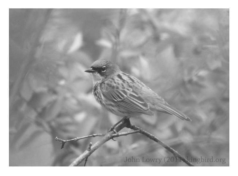
The endangered Kirtland's Warbler has only been sited in Ann Arbor 12 previous times since 1875, which makes this little fellow a very special guest! photo by John Lowry, taken at Dolph Nature Area

Dolph Nature Area is well known by birders as a premier warbler hot spot in the spring. Apparently the birds know it, too! The May 10th visit of a male Kirtland's Warbler was a first for the site. With fewer than 1800 pairs of birds, the Kirtland's Warbler is one of the rarest warblers in the world. The species is listed as endangered in both Michigan and the U.S. Kirtland's Warblers winter in the Bahamas and breed mostly in areas of the Upper Peninsula and the northern end of the lower peninsula of Michigan where there are Jack Pines. They are rarely seen on migration in Michigan, and there are only 12 records for this bird being seen in Ann Arbor since 1875, so the many birders who came to Dolph on May 10th to see this bird consider themselves quite fortunate! What a good reminder of the high importance our natural areas serve to wildlife, including some globally rare species!