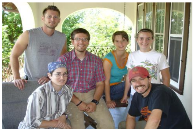
NAP Crew in 2007

working as a Natural Resource Steward for the MDNR, Parks and Recreation Division. I started and continue to grow the Volunteer Steward program in Southeast Michigan state parks, leading volunteer workdays year-round