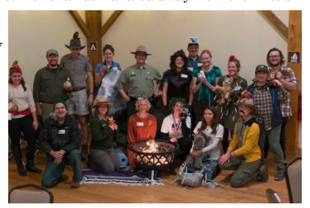
Staff in costumes at the potluck, 2017

and bustle of the city. The field skills that I acquired have been invaluable in my current job, and I am very grateful for everything I learned from my NAP mentors. An unexpected lesson I learned was the value of volunteers to a habitat restoration program - without public support and active involvement, restoration projects are not able to achieve their full potential.