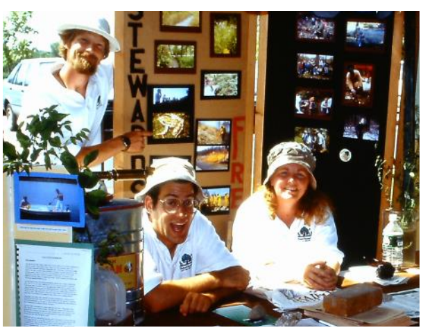
Huron River Day, 1996

I conducted rare plant surveys, and from there to UM Herbarium, where I've enjoyed working with the Michigan Flora Project. NAP gave me the opportunity to gain some local field experience, but more importantly, I learned about the importance of having places where people can connect with nature. I retired this summer from UM and am very much looking forward to sharing more time in nature with my grandchildren.