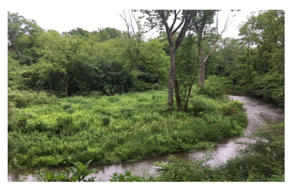
Mallets Creek runs through Braun Nature Area.

Downstream, a red-bellied woodpecker posts itself atop a snag's outstretched arm. It lingers there, sunning and preening. I crouch behind the nearest tree, fumbling with the knobs on a borrowed pair of binoculars.