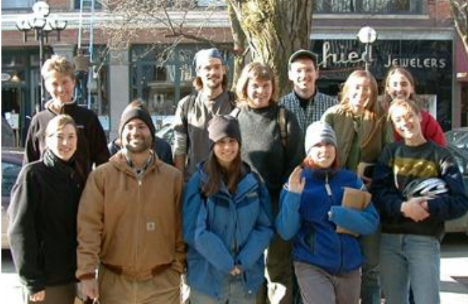
NAP Staff in 2001

the Bird Lab at University of Michigan and ALWAYS work the polls on election days. I love being retired!