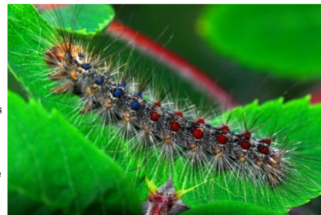
Gypsy moth caterpillar

The gypsy moth caterpillar is pretty neat looking and not too hard to identify. The caterpillar has a yellow head with black eye spots that are reminiscent of raccoon eyes, five pairs of blue spots down its back followed by six pairs of red spots, and spiky clusters of hair protruding from its sides. There are a few similar-looking caterpillars, but the gypsy moth caterpillar does not build a tent or a web like their look-alikes. The gypsy moth itself is unremarkable in appearance. The female is a light cream color, the male is tan, and they both have brown wavy patterns on their wings. Notably, the females do not fly (despite having wings) and are slightly bigger than the males. The females lay their eggs in fluffy, tan masses on the bark of trees. Gypsy moth caterpillars, female moths, and eggs are most often found on oaks but they will use a wide variety of trees.