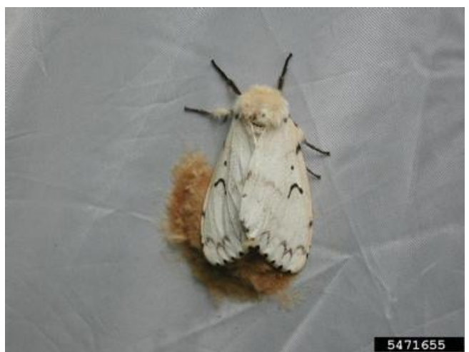
Female gypsy moth laying eggs

There are several choices for combating these destructive insects including cultural practices like removing woody debris, mechanical controls such as scraping off eggs, and several insecticide options. Perhaps the best option that was added to our arsenal since the outbreak of the early 90s is a biological control. Researchers had been aware of a fungus, Entomophaga maimaiga , that caused a gruesome death for the gypsy moth caterpillar in their native range in Japan. Attempts were made to introduce the fungus to North America several times throughout the 1900s but it wasn't until 1989 when its effectiveness was first noticed. After a bit more research, the fungus was released here in Michigan and most years it does a good job of controlling gypsy moth infestations.