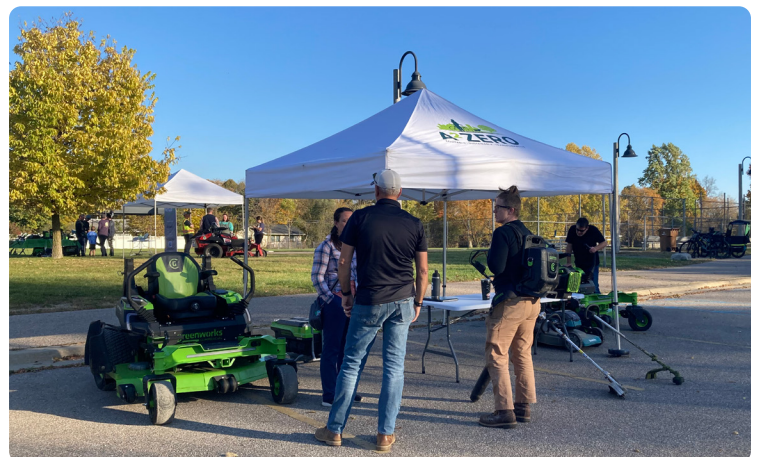
The 2024 Sustainable Lawn Care Learning Session.