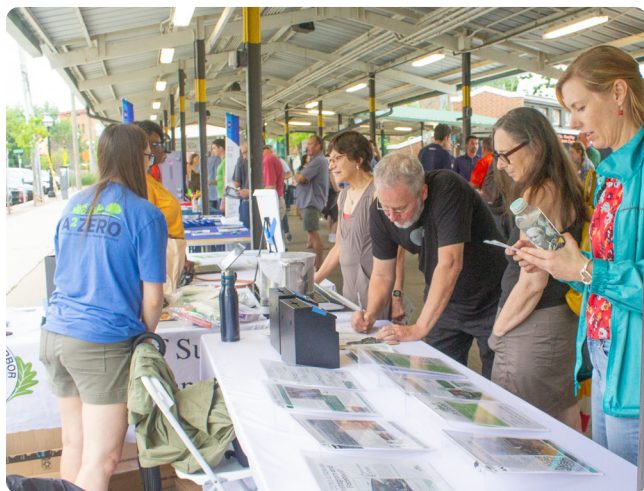
Residents at the A 2 ZERO table for the 2024 Electrification Expo.