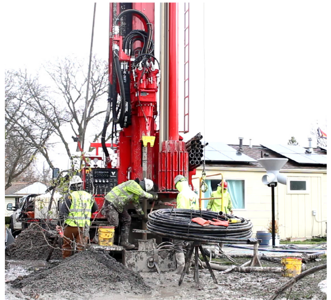
Drilling for the geothermal system at the Bryant Community Center.