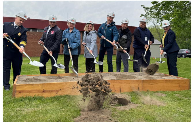
City officials break ground on Fire Station 4, Michigan's first net-zero fire station.