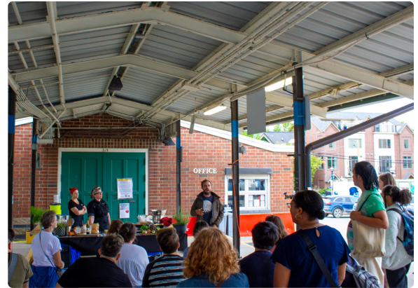
The 2024 Local Food Festival.