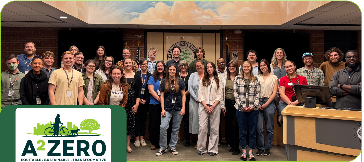
The full Office of Sustainability and Innovations team, June 2025.

THE OFFICIAL NEWSLETTER OF A 2 ZERO AND THE ANN ARBOR OFFICE OF SUSTAINABILITY AND INNOVATIONS