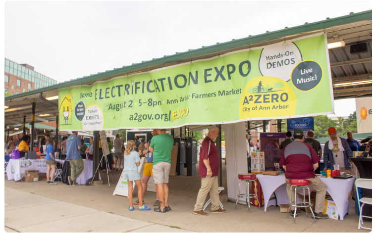
The 2024 Home Electrification Expo.