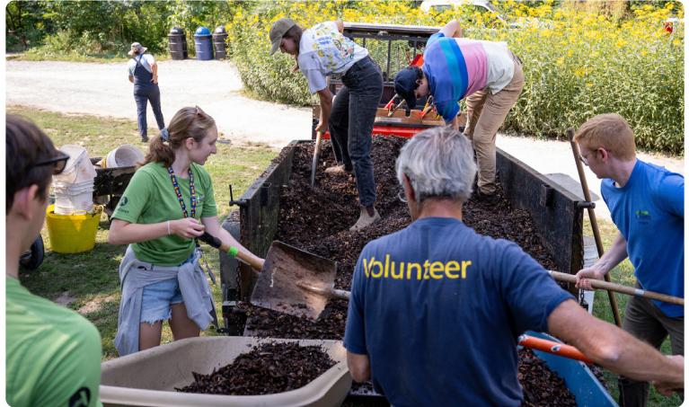
Bicentennial tree planting, 2024.