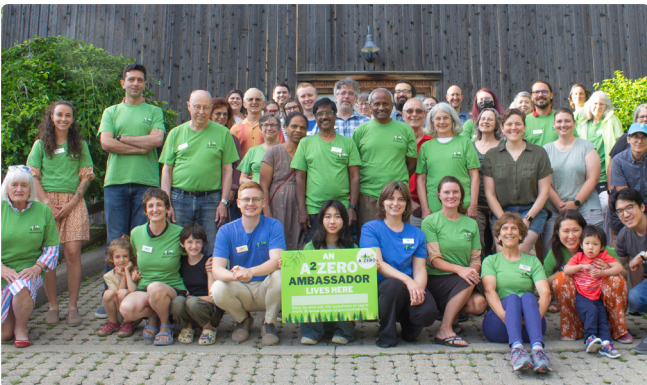
The June 2024 Ambassador Graduation, where the A 2 ZERO goal of 100 Ambassadors graduated was achieved.