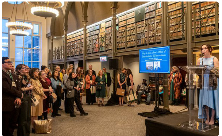
Staff accepts the Climate Action Hero Award for Best in the Midwest.