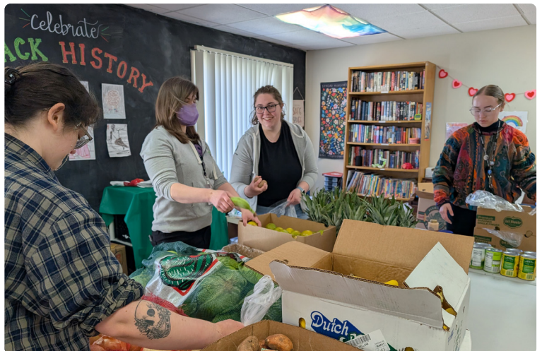
Sustainability and Innovations Fellows (formerly referred to as Climate Corps members) distribute food at Green Baxter Court.