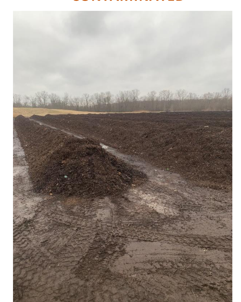
PAPER BAGS ARE CLEANER AND LESS CONTAMINATED