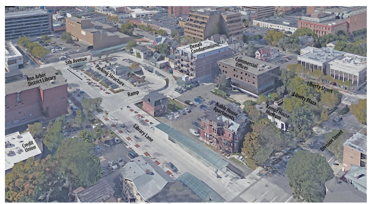
Birdseye photo of Library Block from southeast

The remaining sections of this report detail how our recommendations were formed, additional considerations and related appendices, including a summary of Task Force activities and community engagement efforts.