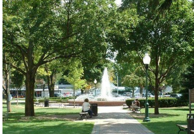
Bhadra Court, India