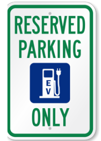
Image 2 parking signage

EV parking spaces should use the MDOT-approved sign illustrated in Image 2 to ensure EV use. The standardized sign helps create continuity among EV drivers and the general public. Sign details are available on the Clean Energy Coalition website (see the Resources section of this guide for a link). The parking space should be painted with the EV symbol, shown in Image 1. The paint color should match the color of the parking space lines, and dark colors should be avoided.