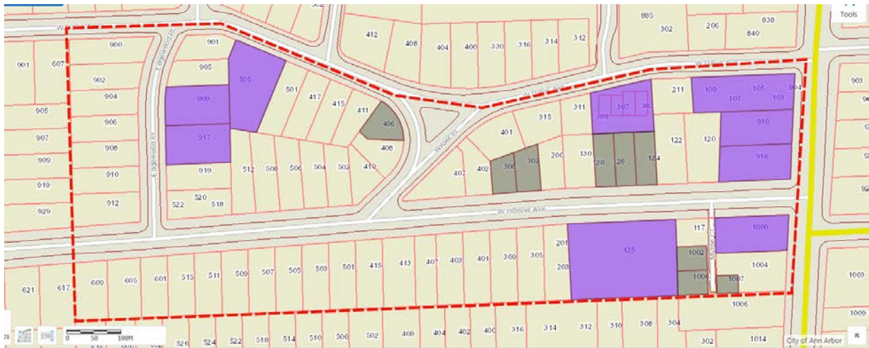
Figure 1- There are 9 conforming lots in the study area, shown in purple. These lots will remain conforming regardless of zoning designation. There are 9 lots with less than 4,000 square feet, shown in gray. These lots will remain nonconforming regardless of zoning designation. The rezoning study focuses on the best fit for the 52 unshaded lots having between 8,499 and 4,000 square feet.