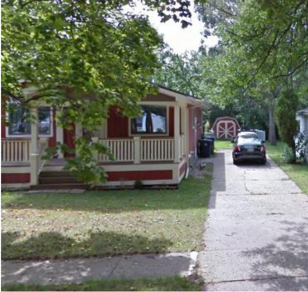
Legal tandem parking space for ADU