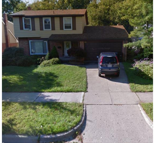
Does NOT meet parking requirement, as located in required front open space